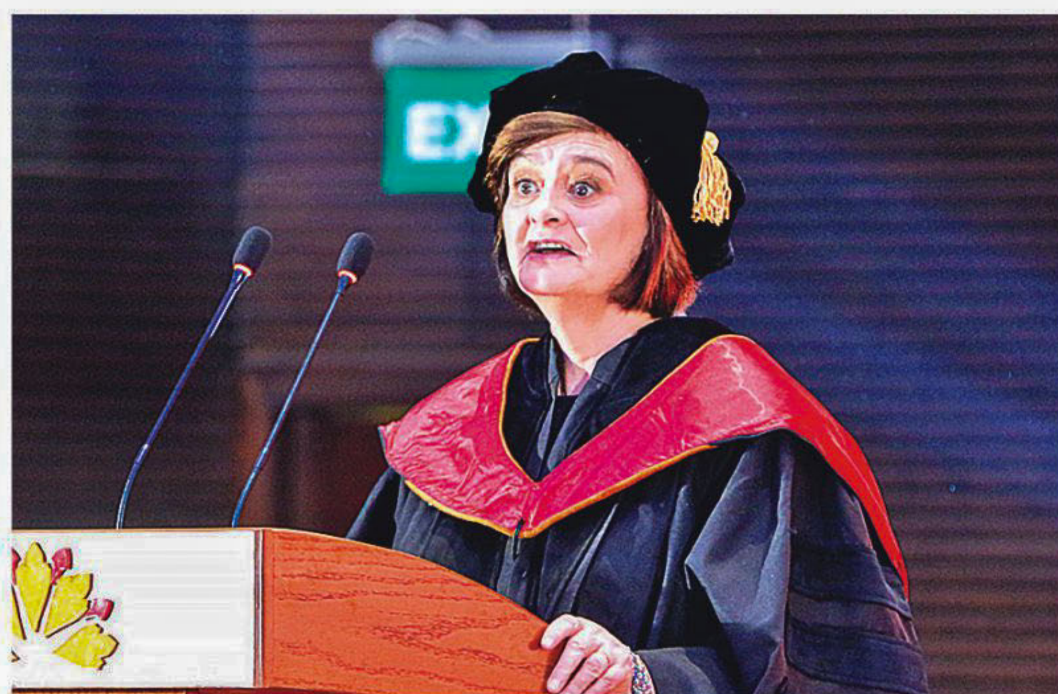
The Chancellor of AUW Cherie Blair