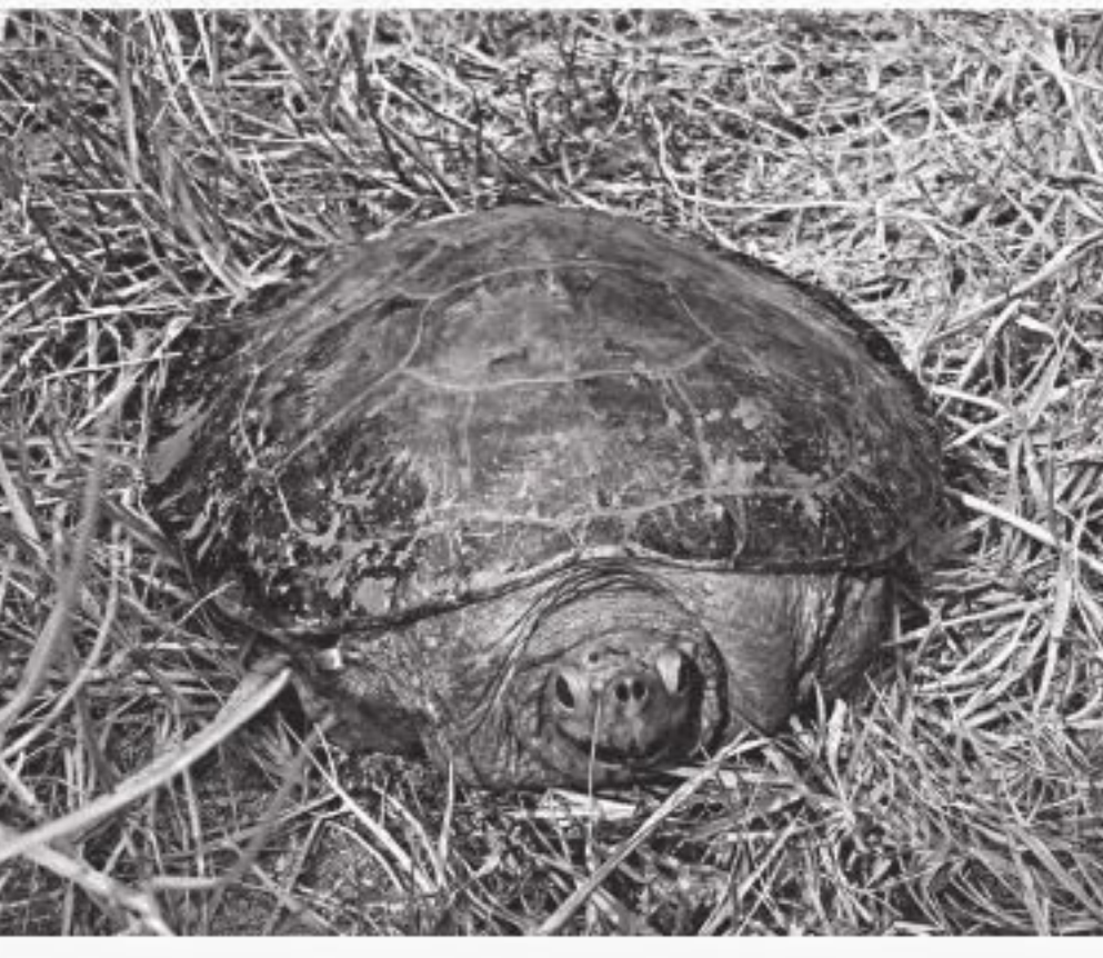
CLOCKWISE FROM LEFT: Ten of the Batagur Baska offspring hatched at Karamjal wildlife breeding centre in the East Sundarbans, a conservationist holds one of the offspring in his palm, and the mother of the hatchlings.