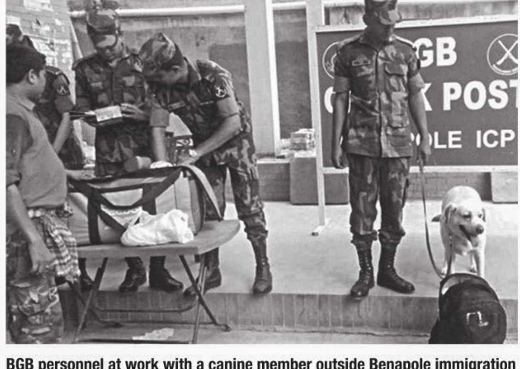
BGB personnel at work with a canine member outside Benapole immigration terminal on Wednesday.

OUR CORRESPONDENT, Benapole Border Guard Bangladesh (BGB) on Wednesday deployed its dog squad to screen arriving baggage and passengers after they pass through security checks at Benapole immigration check post. Lt Col Selim Reza, commanding officer of BGB 49 Battalion, said the trained canines are capable of detecting any suspicious item, especially if a luggage contains drugs and explosives materials inside. However, many passengers passing through immigration and police security checks inside the immigration terminal said additional screenings by BGB at two spots -- at Amarkhali, only two kilometers apart, and Natunhat -- is already causing immense inconvenience to passengers. Now the screening by the dog squad will only cause further inconvenience by lengthening their travel time before they reach their final destinations. Hoping that the new screening by canines would make security checks