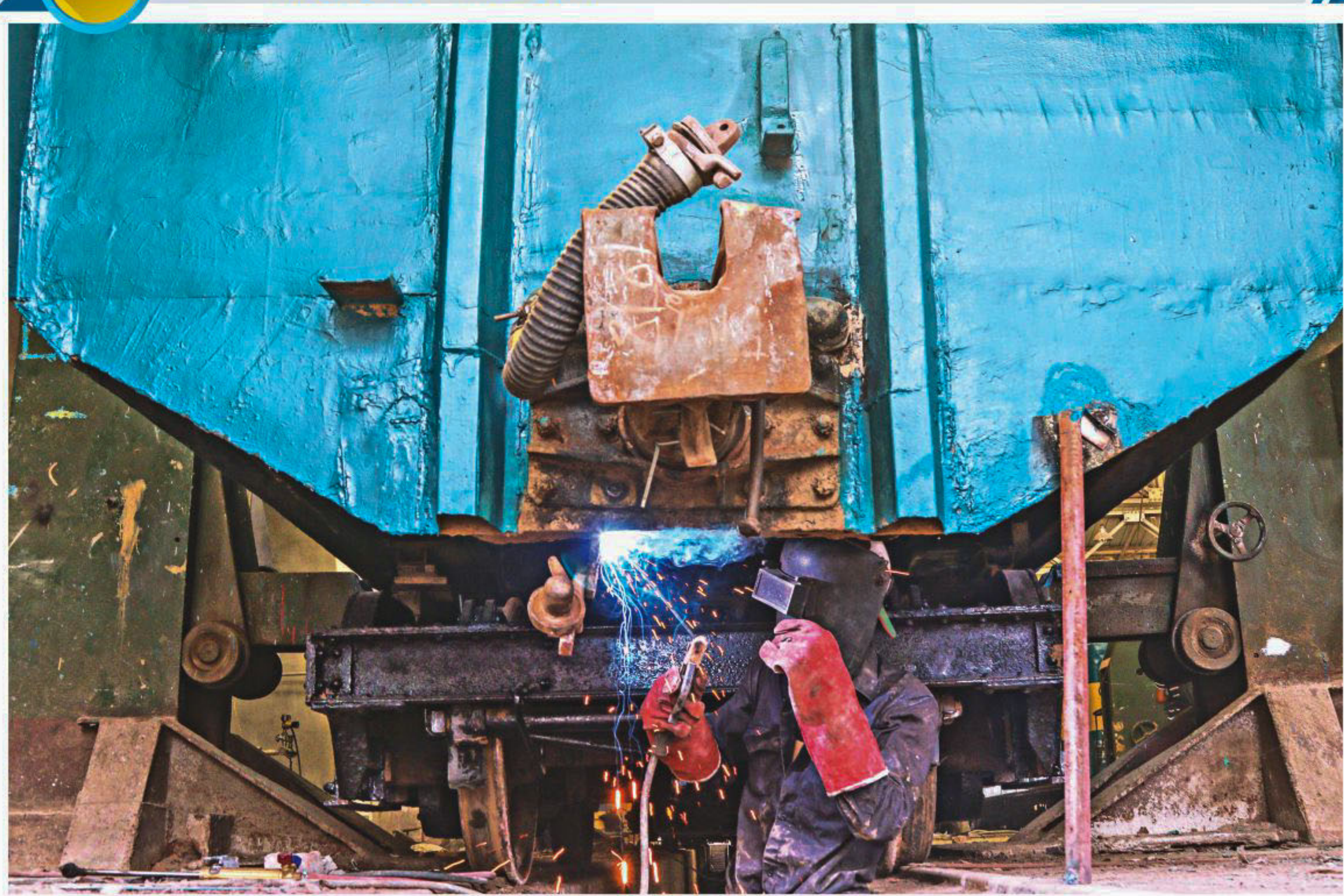
Trains carry thousands of homebound passengers every Eid. Bangladesh Railway takes special care to make sure that their journeys are safe and comfortable. A railway worker is seen busy with repair work, at Railway's Pahartoli workshop in Chattogram on Wednesday.