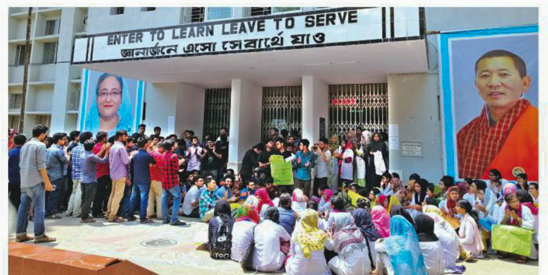
Students stage a sit-in at college premises.