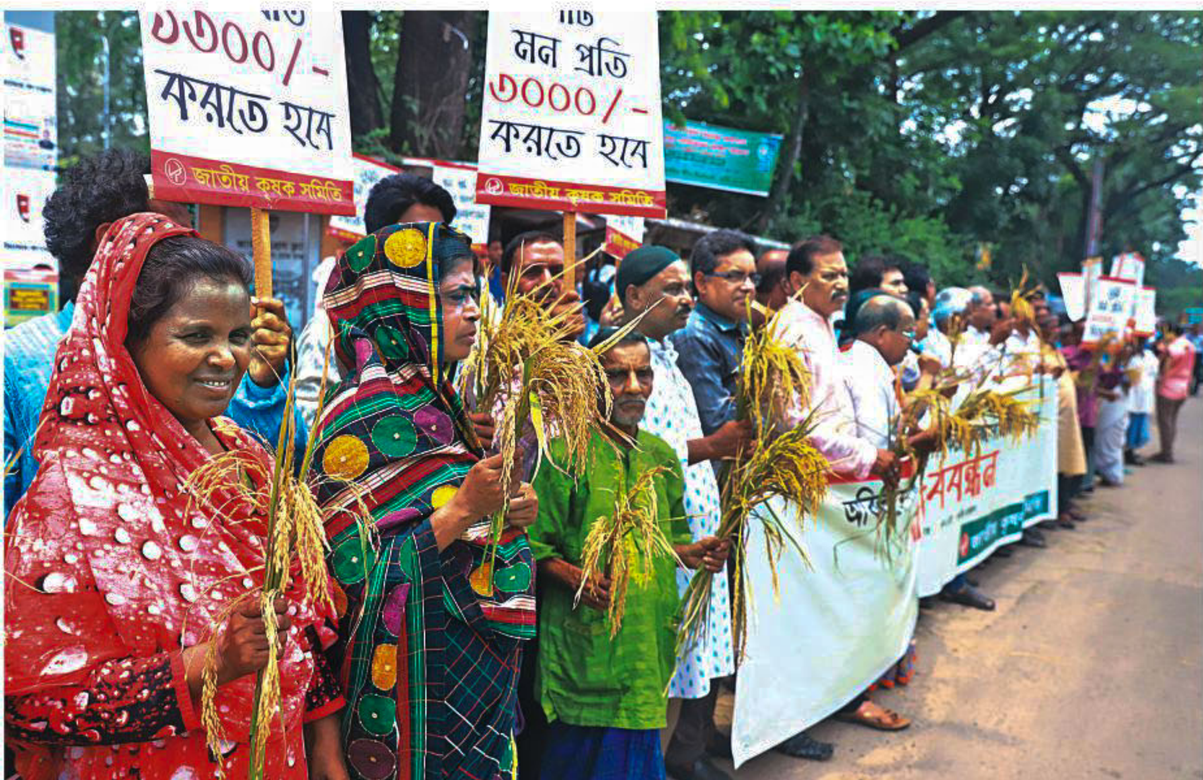
Jatiya Krishak Samity, an organisation working for farmers' rights, formed a human chain in front of the Jatiya Press Club yesterday, demanding subsidised pricing for rice procurement, as well as setting of fair prices for jute, wheat and maize.