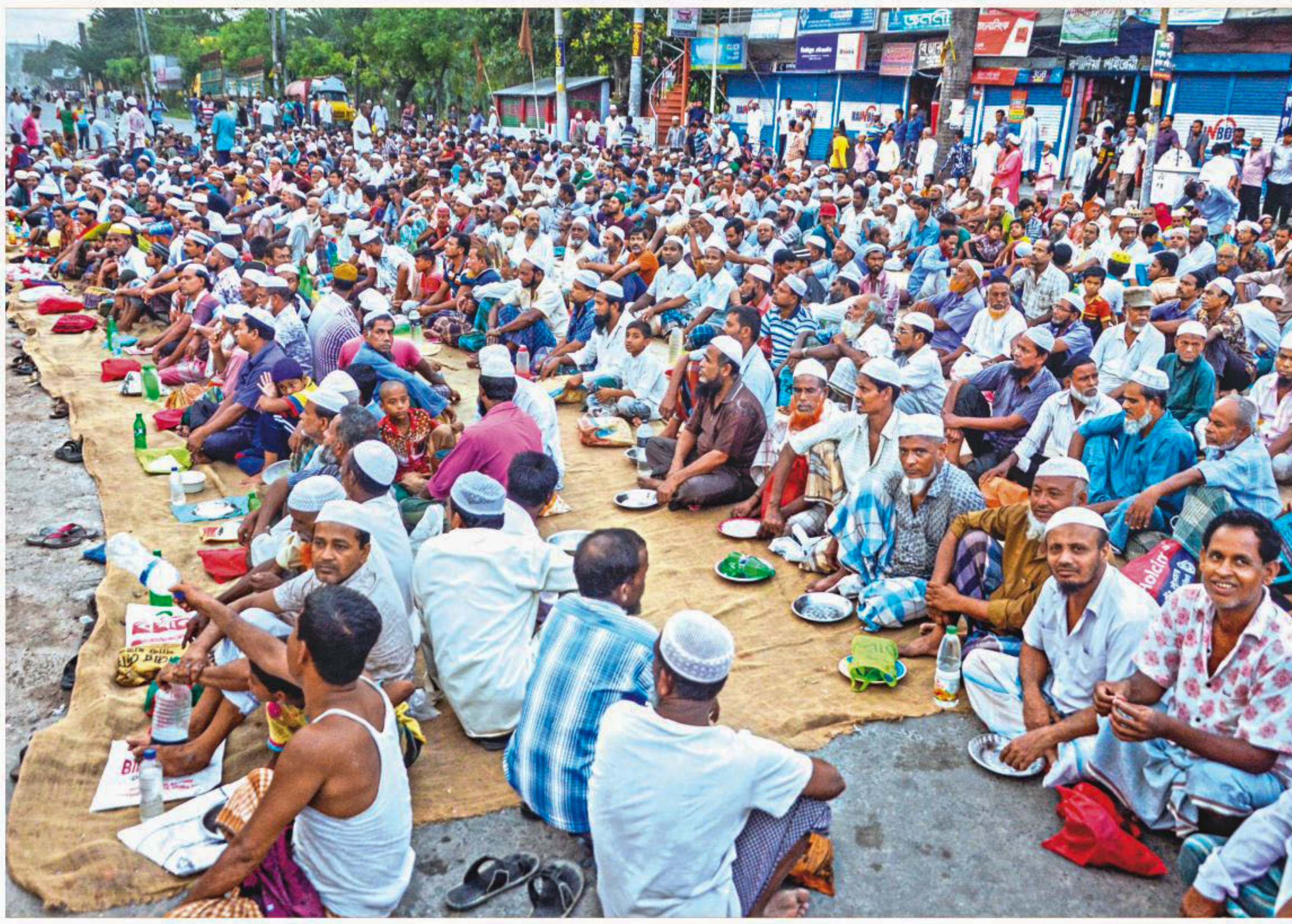
Demonstrating jute mill workers wait to have their iftar on Dhaka-Khulna highway at Natunrasta Mor yesterday evening. They blocked the highway from 4:00pm to 7:00pm demanding arrears.

The NFSL, in the study report, said it found the presence of excessive levels of lead and pesticides in raw cow milk, SEE PAGE 10 COL 2