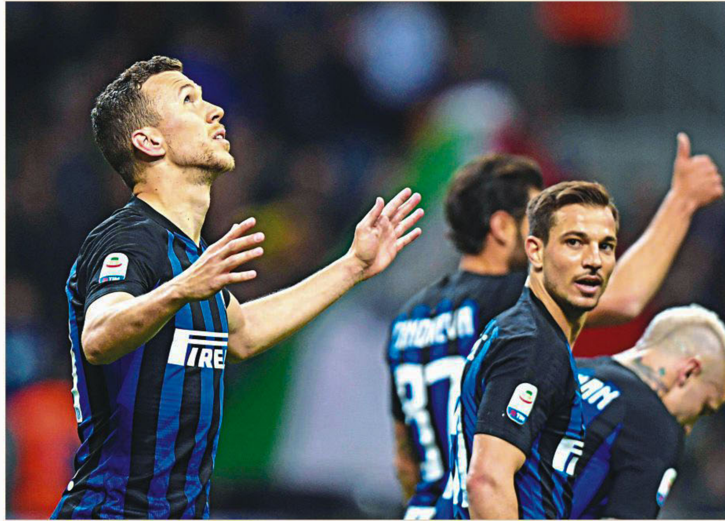
Inter Milan forward Ivan Perisic (L) looks to the heavens after scoring the opening goal against Chievo during their Serie A encounter at the San Siro on Monday.

Bologna moved ahead of Fiorentina into 13th position with a 4-1 win over Parma which leaves the promoted side just three points clear of a return to Serie B next season.