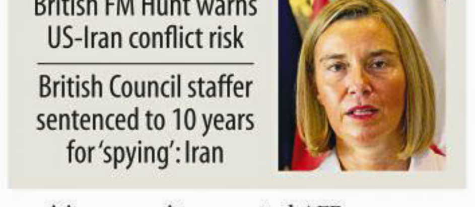
British FM Hunt warns US-Iran conflict risk

Tehran called for an investigation into the "alarming" attacks and warned of "adventurism" by foreign players to disrupt