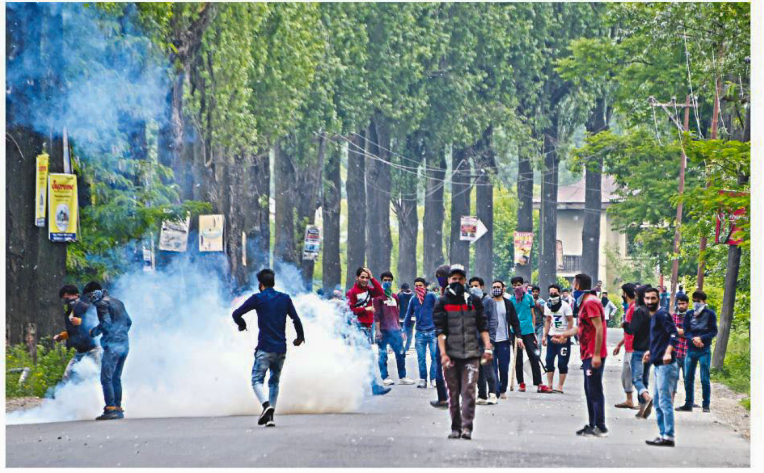
Kashmiri protesters stand on a road amid tear smoke during clashes with Indian government forces at Mirgund Pattan on the outskirts of Srinagar yesterday, as protesters called for justice in the case of the alleged rape of a three-year-old girl.

"There is an atmosphere of panic in the town," said Zongo. "People are holed up in their homes. Nothing is going on. The shops and stores are closed. It's practically a ghost town," he added.