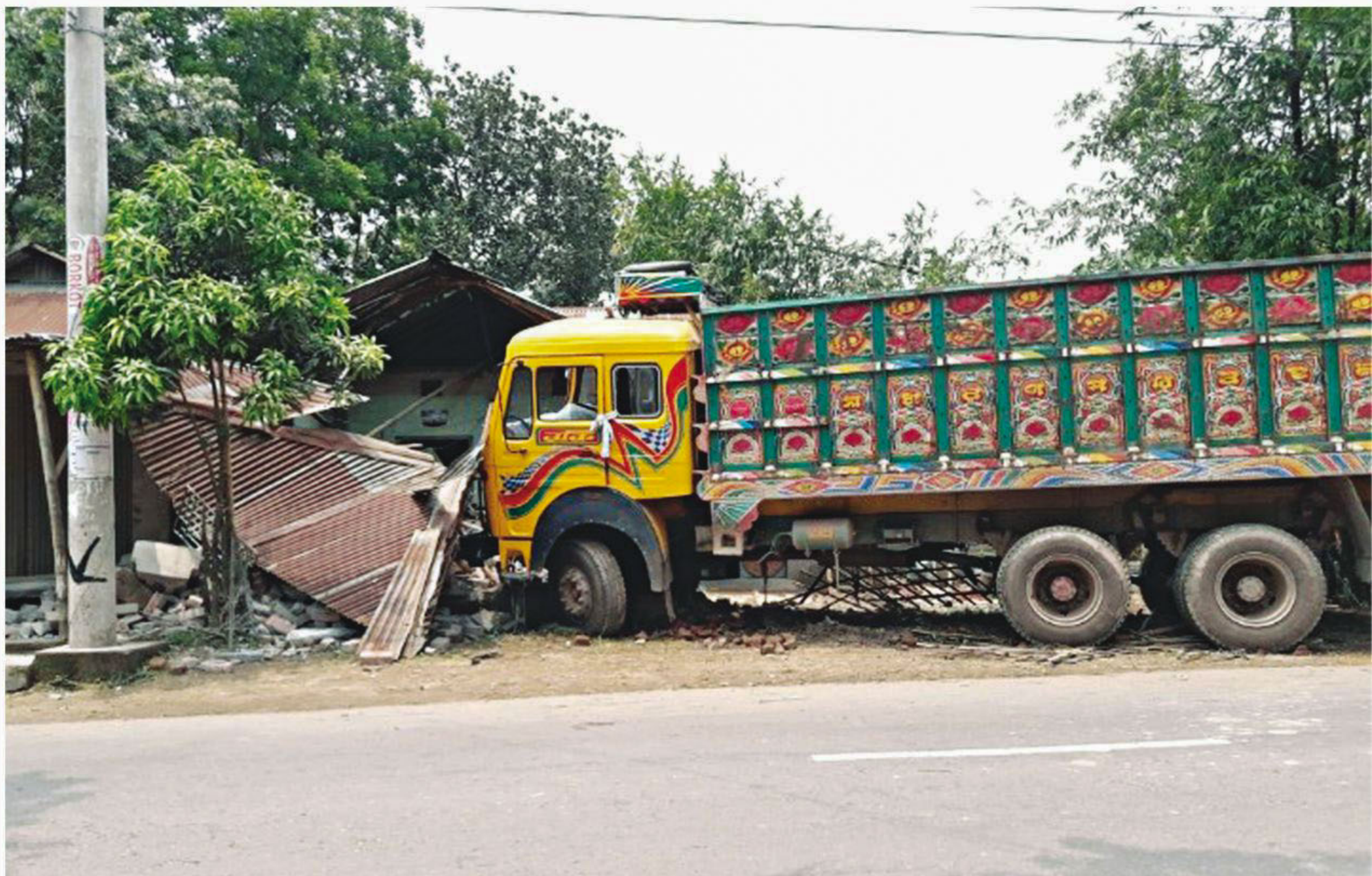
This truck veered off the Lalmonirhat-Burimari highway and ploughed into a house in Tushbhandar area of Lalmonirhat's Kaliganj upazila yesterday morning, leaving a woman dead and her two daughters injured.

If given a choice between unification and the economy, 70.5 percent put a higher priority on the economy, with just 8.3 percent backing unification.