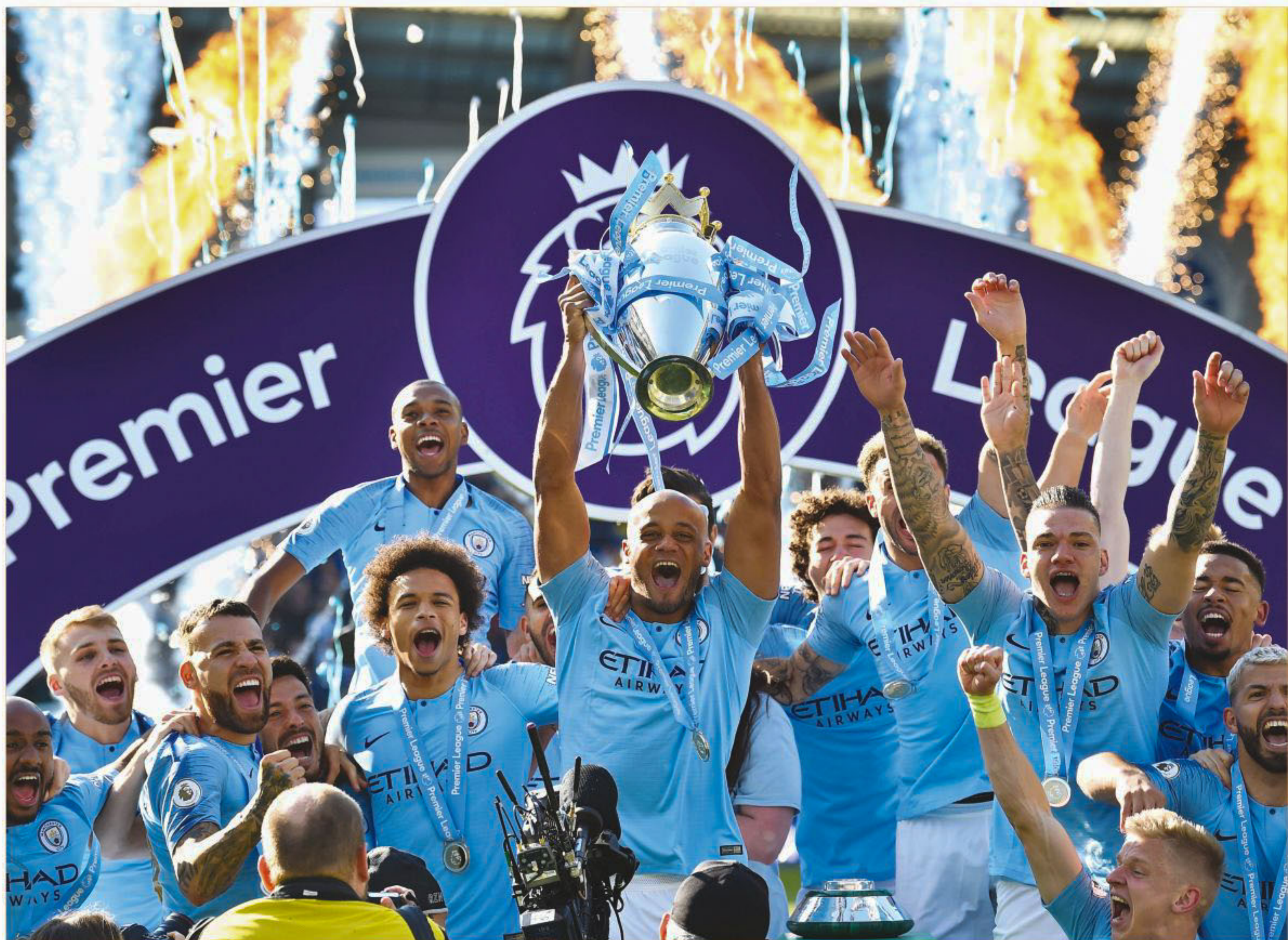
Manchester City captain Vincent Kompany, flanked by his jubilant teammates, hold aloft the English Premier League trophy after their 4-1 win against Brighton and Hove Albion at the American Express Community Stadium Sunday. Pep Guardiola's men fought back from a goal down to defend their league title while Liverpool had to finish a point behind despite a 2-0 win at home against Wolverhampton Wanderers.

Klopp's team will have to put the disappointment behind them as they prepare to face Premier League rivals Spurs in the Champions League final in Madrid on June 1.