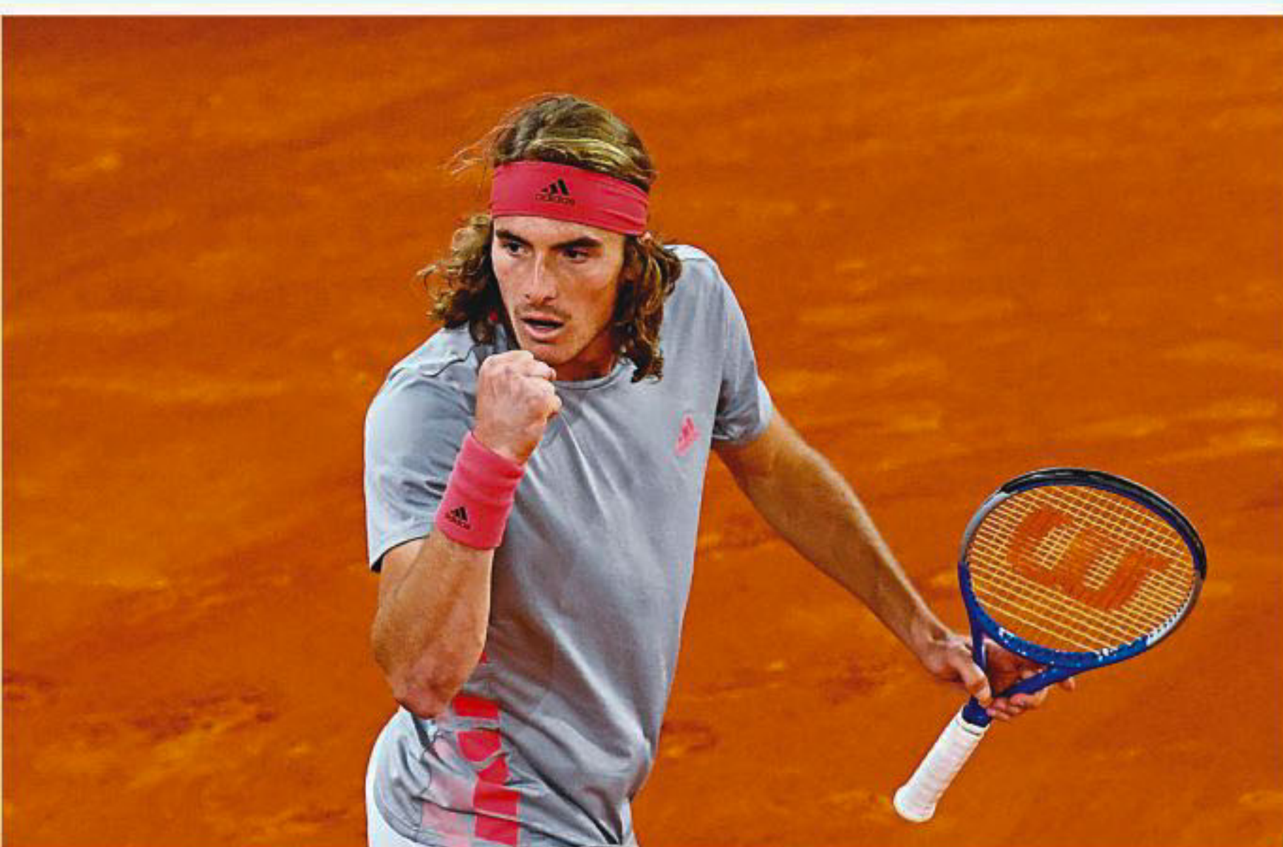
Greece's Stefanos Tsitsipas wildly celebrated his victory over Spain's Rafael Nadal in the Madrid Open semifinal at the Caja Magica in Madrid on Saturday.