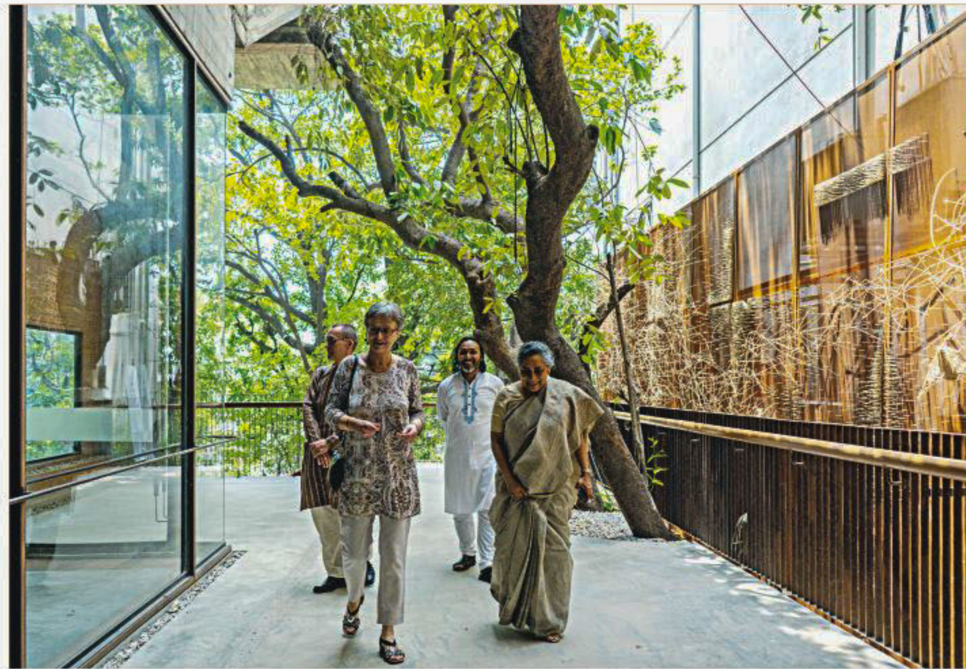
Norwegian ambassador at Bengal Shilpalay.