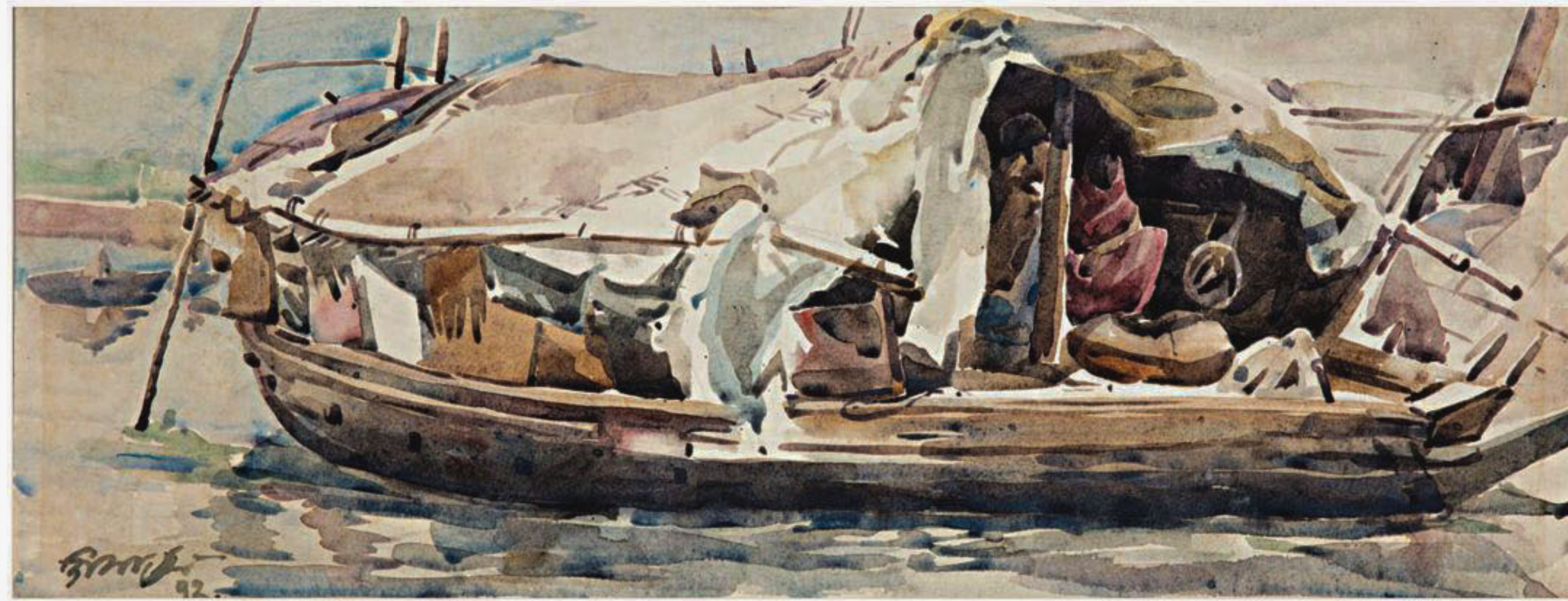
A paintings from the exhibition.

Minister to consider taking him abroad for treatment. "The Honourable Prime Minister is aware of the situation, and of course, whatever she will decide will be for the betterment of all. However, we request her to take him abroad." ATM Shamsuzzaman was first admitted to the hospital on April 26 due to indigestion problems. His last film, Alpha , was released this month.