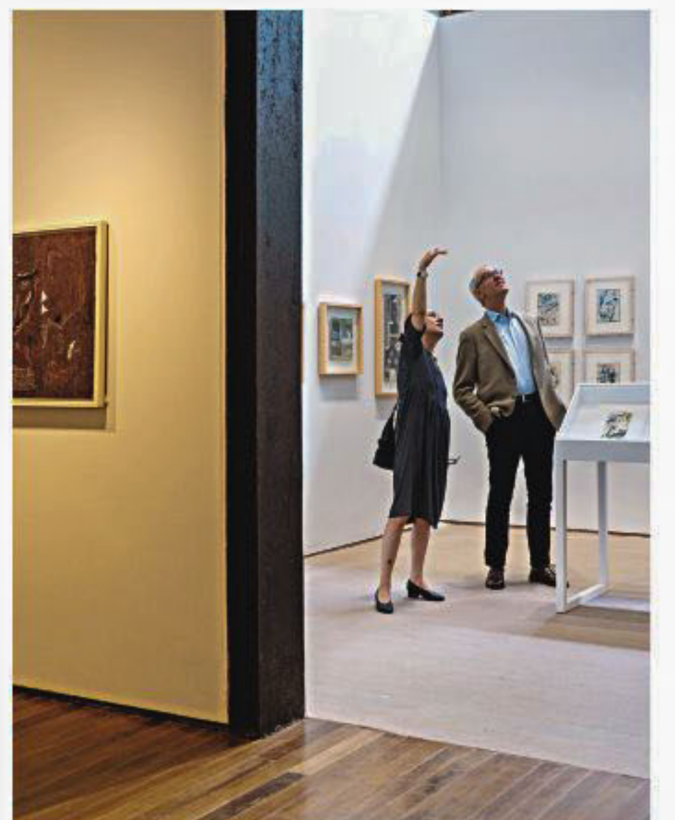
Swiss ambassador at Bengal Shilpalay.