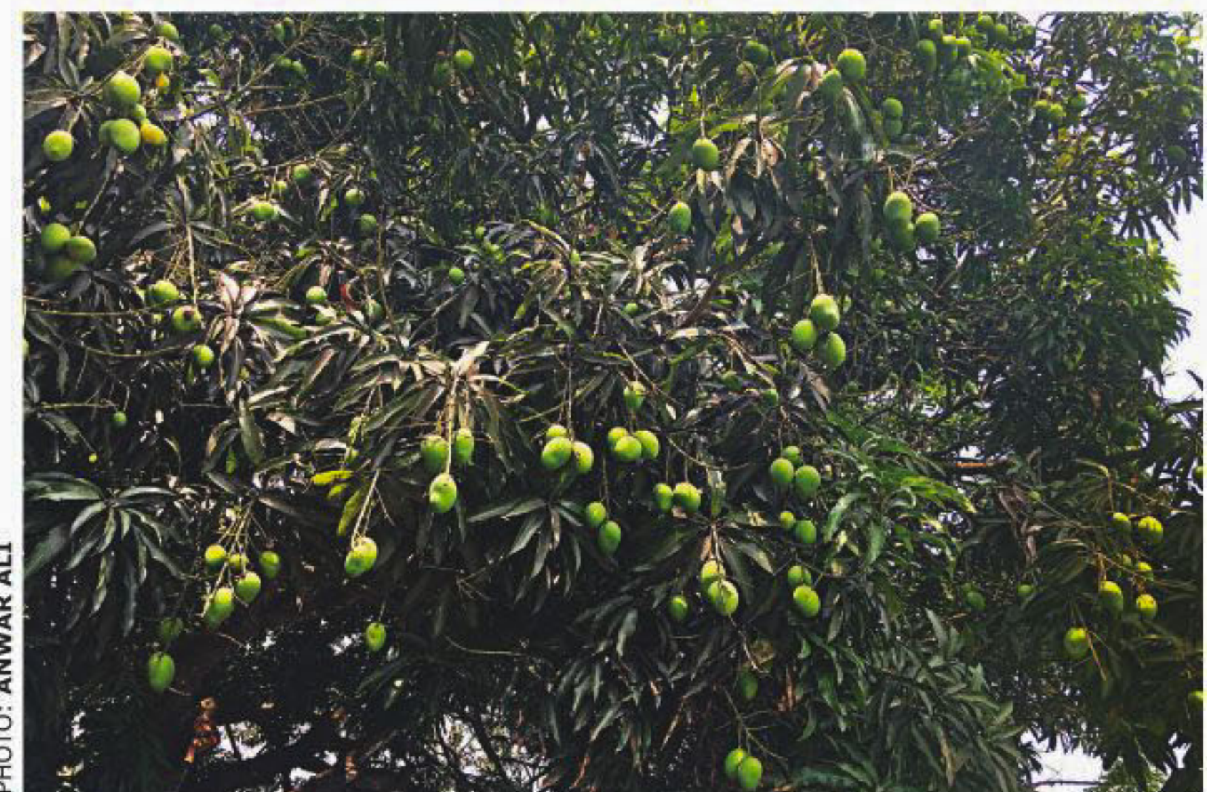
'Guti' variety of mango, far from ripening. The photo was taken on Saturday.