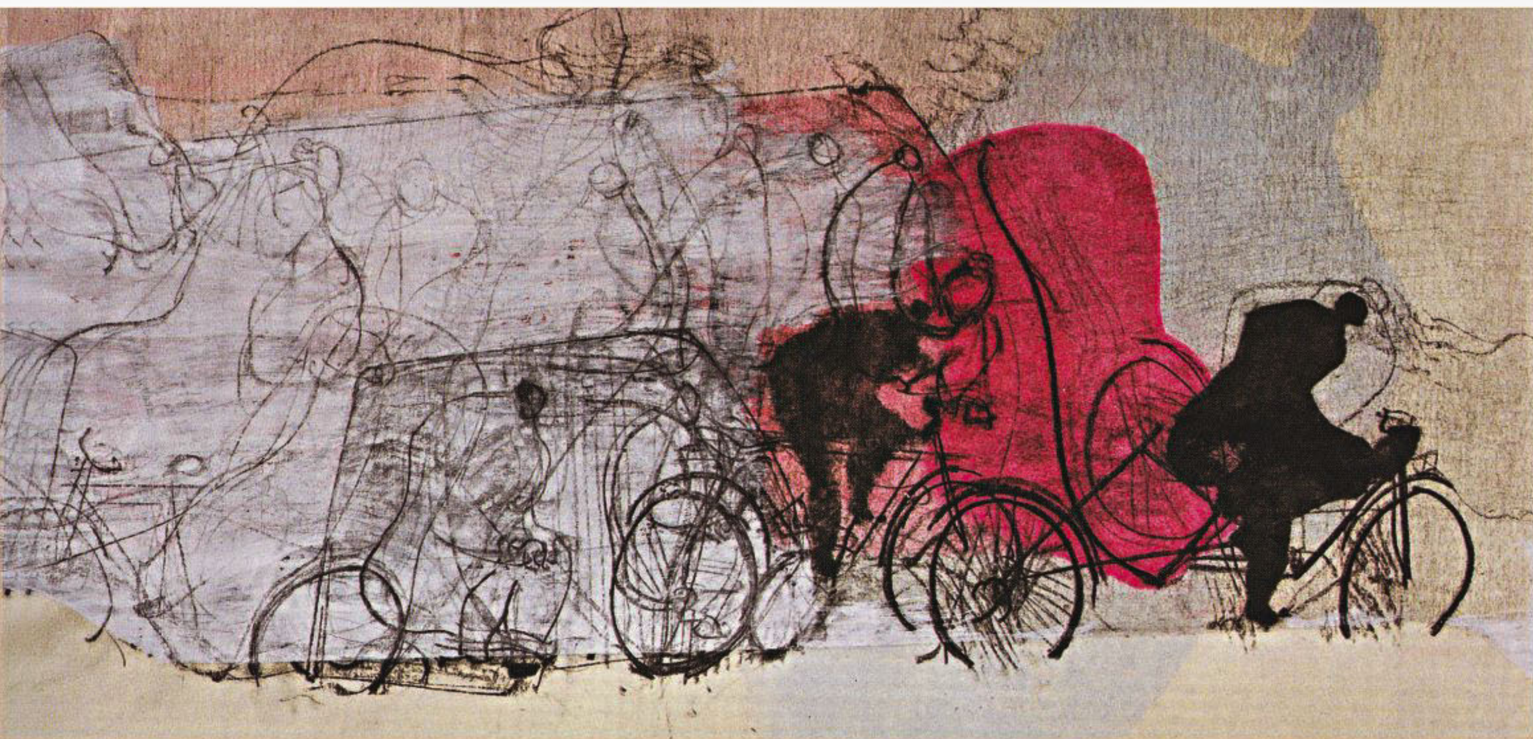
Artworks from the exhibition.