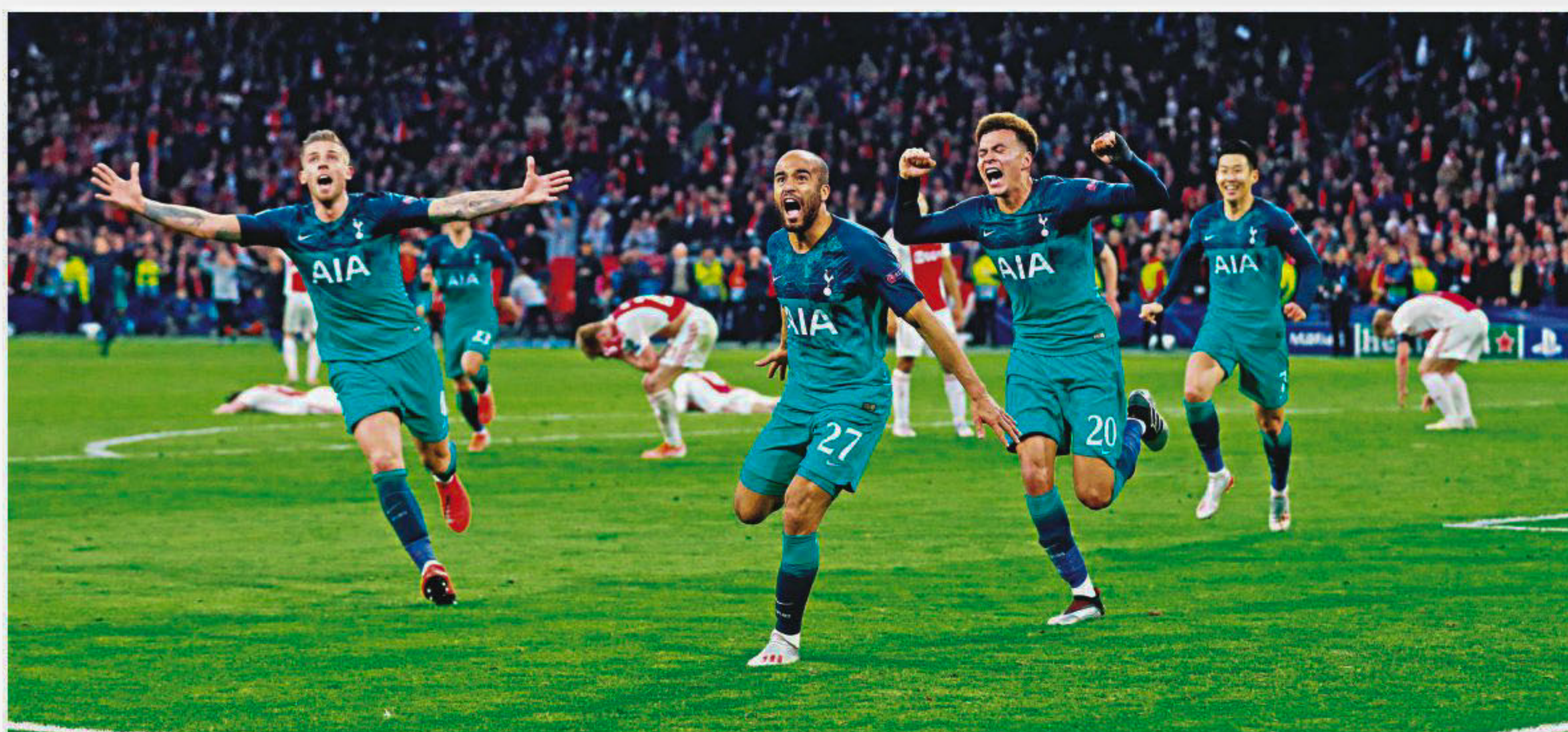
Tottenham Hotspur players burst into celebration after Brazilian forward Lucas (C) completed his hat-trick with a 95th minute winner against Ajax during their pulsating Champions League semifinal second leg encounter at the Johan Cruyff Arena in Amsterdam on Wednesday.