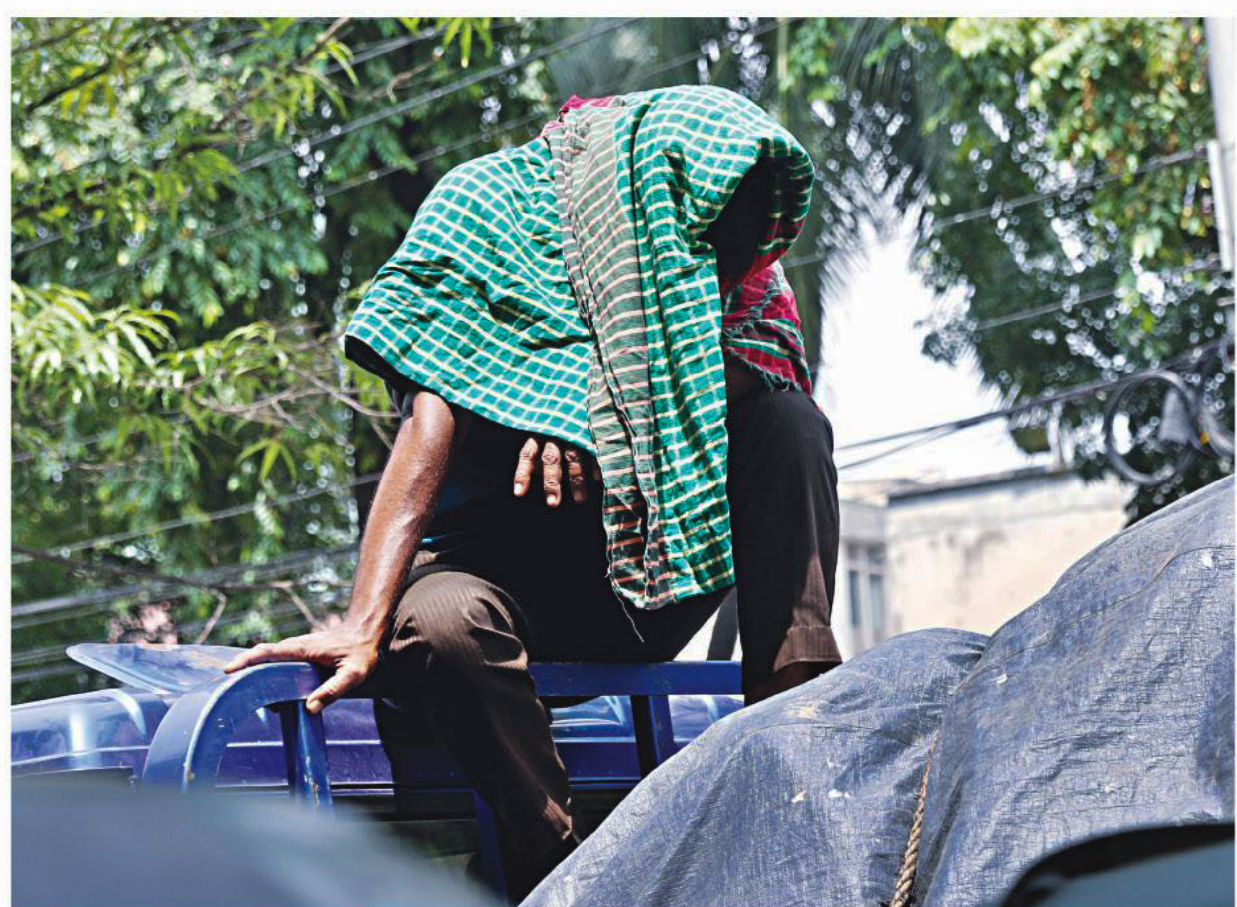
A man atop a pickup truck wraps a gamchha around his head and torso, seeking shelter from the sweltering heat that continued to sweep through the capital yesterday. The photo was taken at Kakrail.

A case was lodged with Kotwali Police Station.