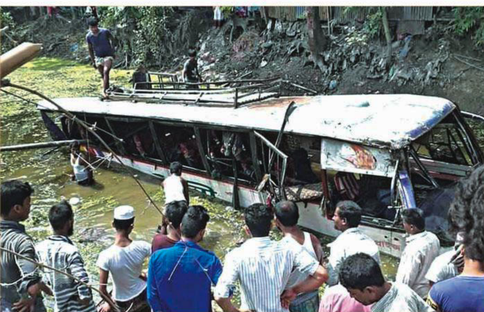
Locals carry out rescue efforts after a bus plunged into a roadside ditch in Parkot of Chatkhil.