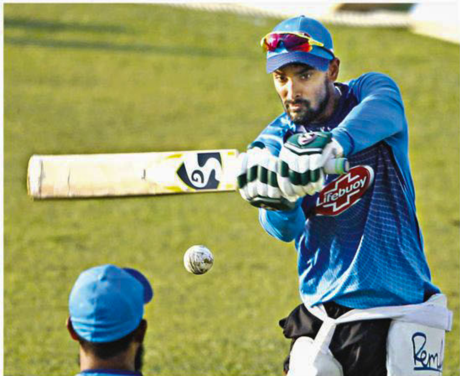
MASHRAFE BIN MORTAZA BANGLADESH ODI CAPTAIN

With the slot for Tamim Iqbal's opening partner still up for grabs, Bangladesh's Liton Das (L) and Soumya Sarkar will be out to prove themselves when the Tigers take on West Indies in their ODI Tri-series opener in Dublin today. However, seeing as Soumya also bowls well, the all-rounder just might have the edge.