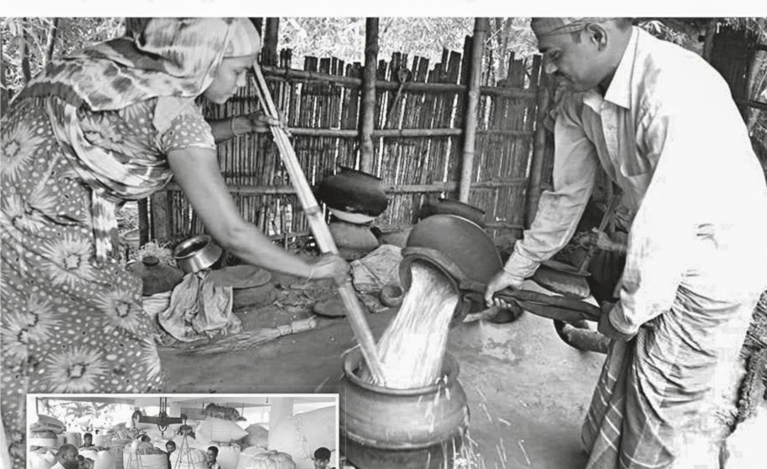
A couple prepare chemical-free organic puffed rice at their house of Goadighi Krishnapur village in Natore Sadar upazila. Inset, traders sell puffed rice at Krishnapur Halsarak market in the upazila.