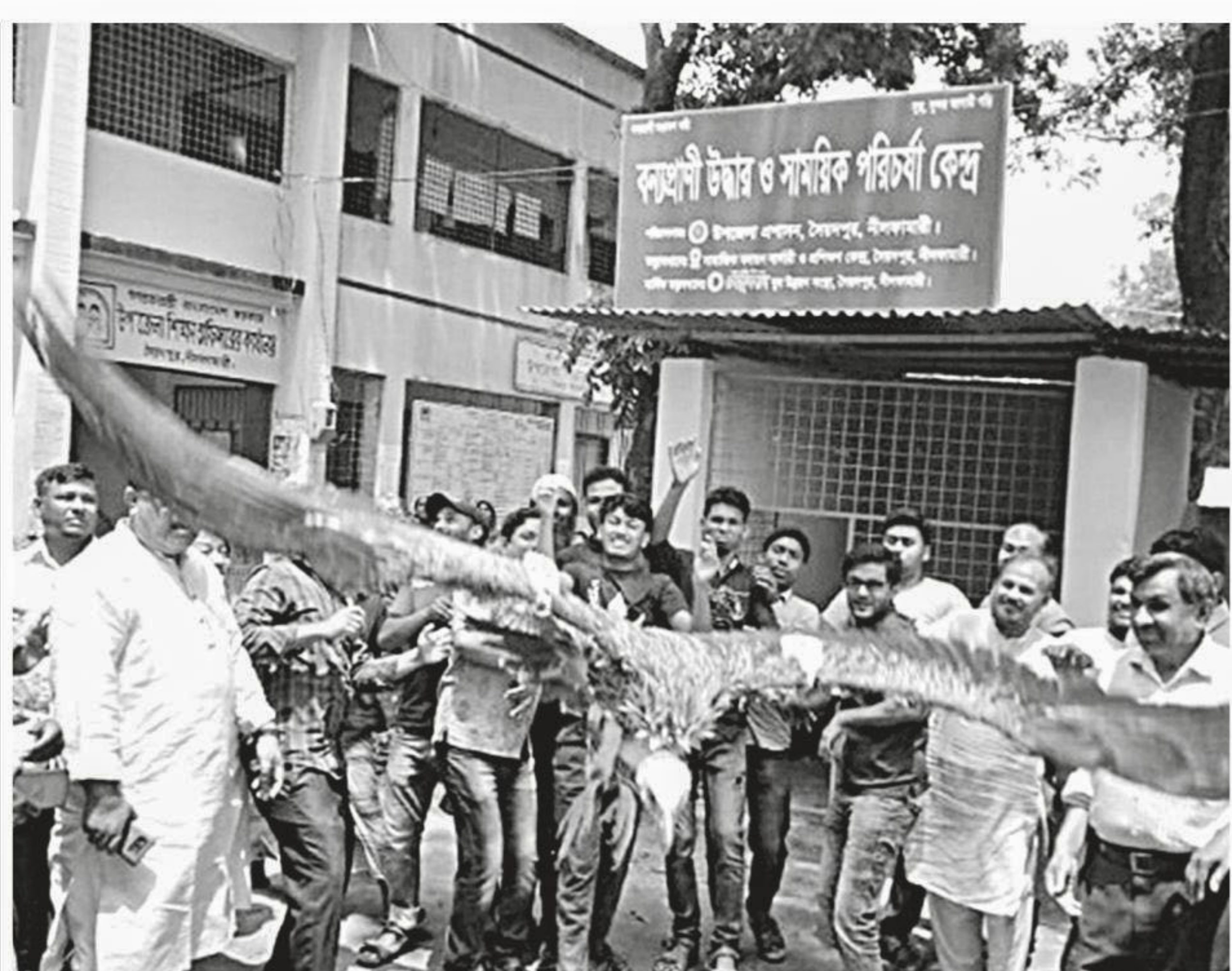
This vulture, rescued in an injured state from Boraibari village in Nilphamari Sadar upazila on Thursday, was released to the nature after treatment at 'wildlife rescue and temporary nursing centre' in Saidpur upazila yesterday.