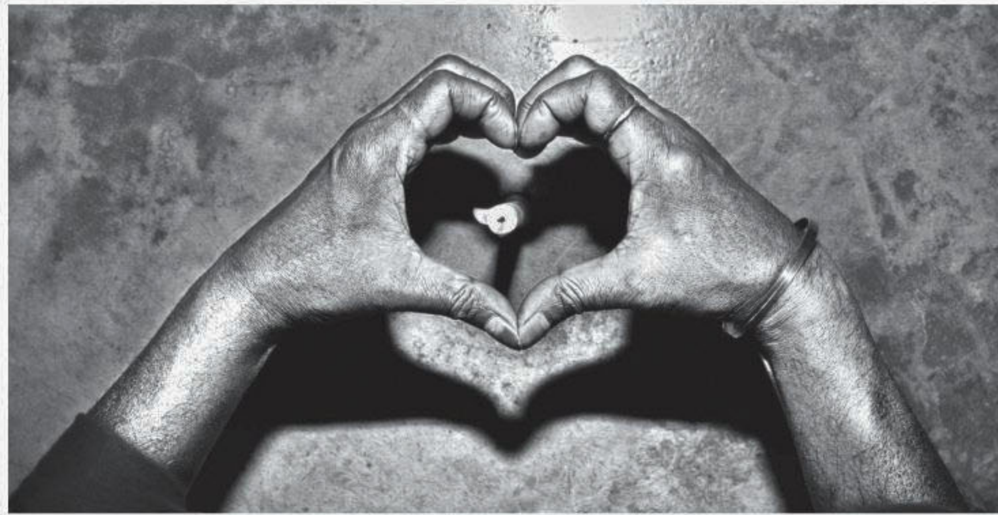
A photograph from 'Inner Face.'