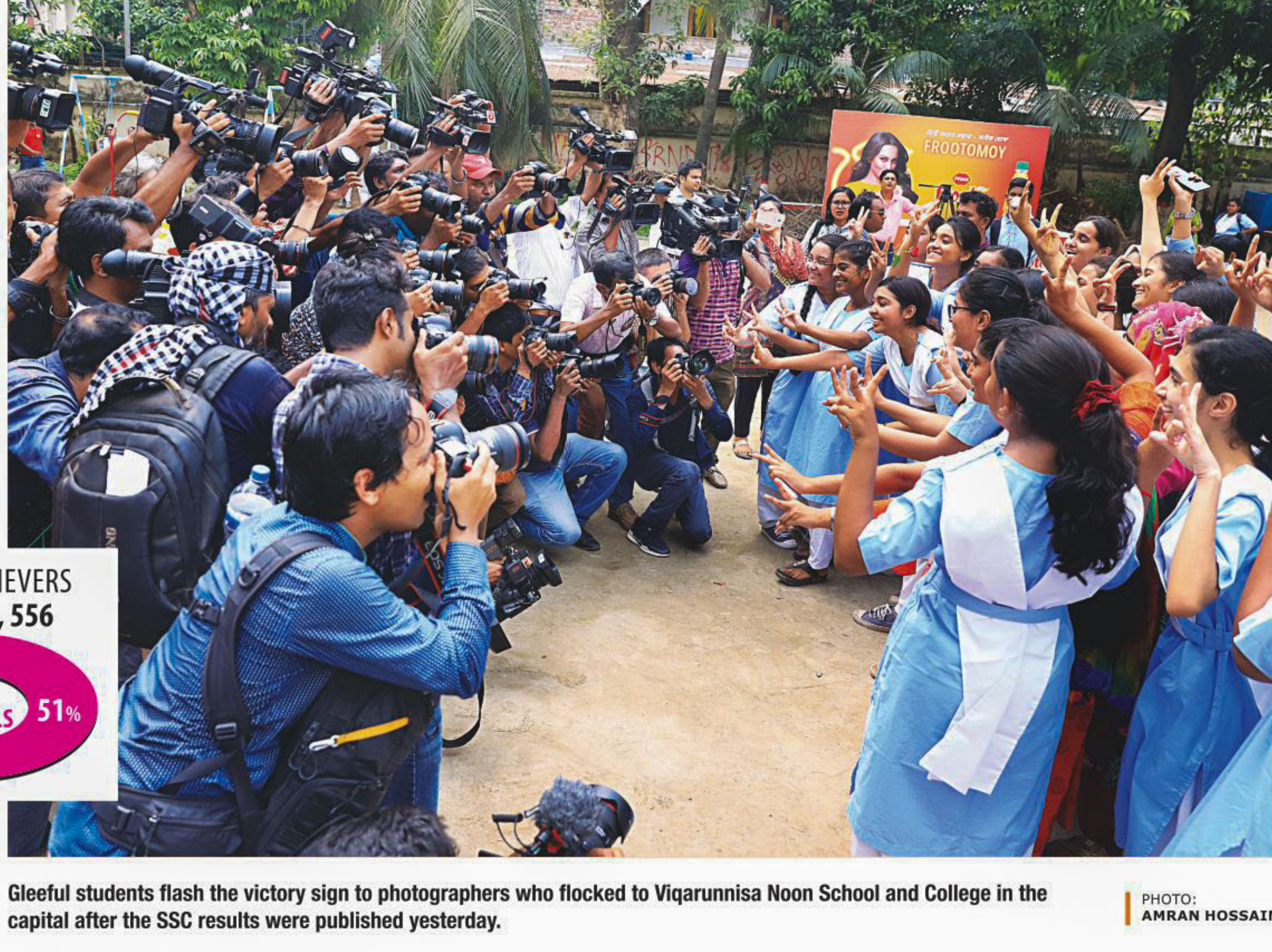
Gleeful students flash the victory sign to photographers who flocked to Viqarunnisa Noon School and College in the capital after the SSC results were published yesterday.