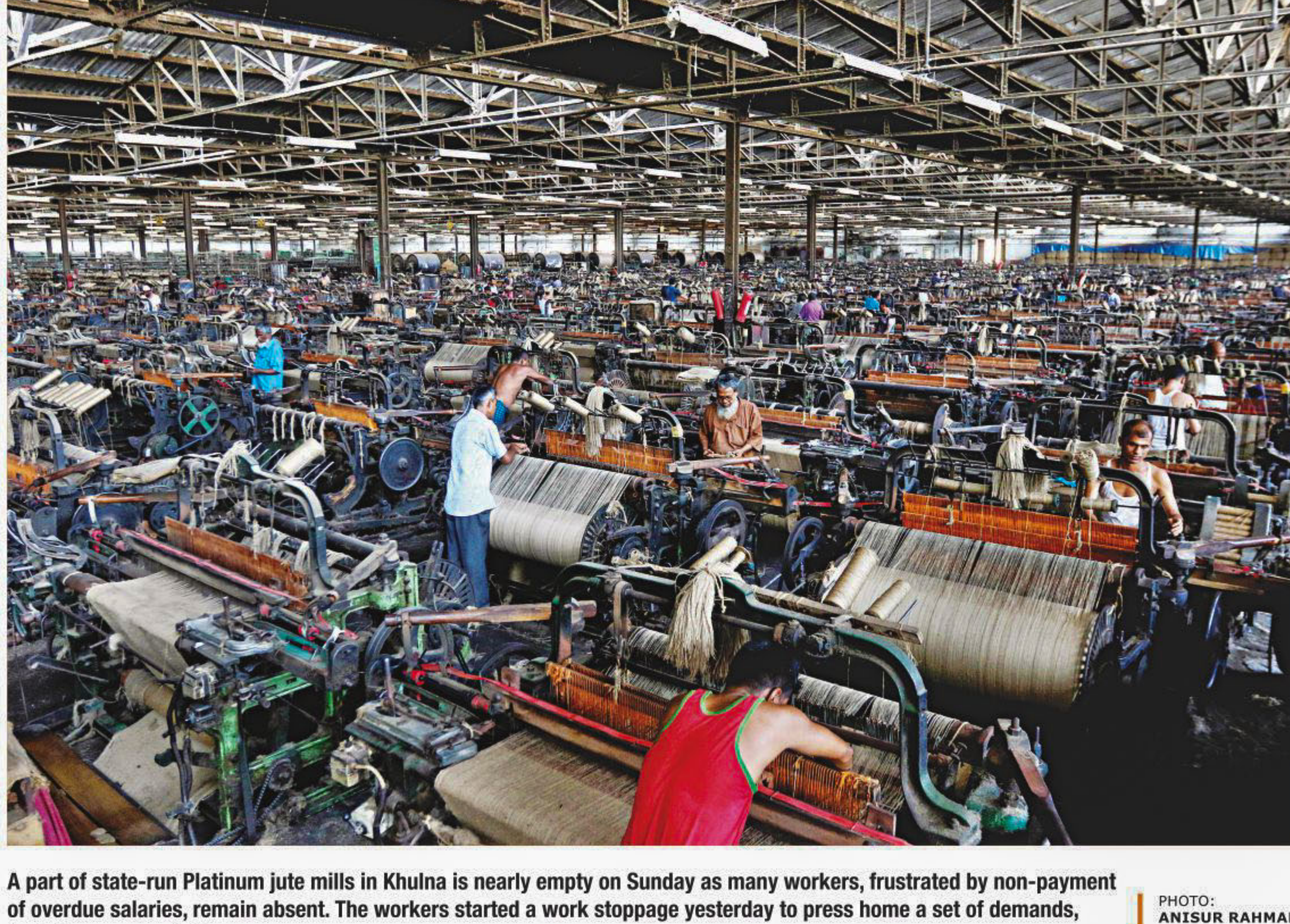
A part of state-run Platinum jute mills in Khulna is nearly empty on Sunday as many workers, frustrated by non-payment of overdue salaries, remain absent. The workers started a work stoppage yesterday to press home a set of demands, including payment of arrears.