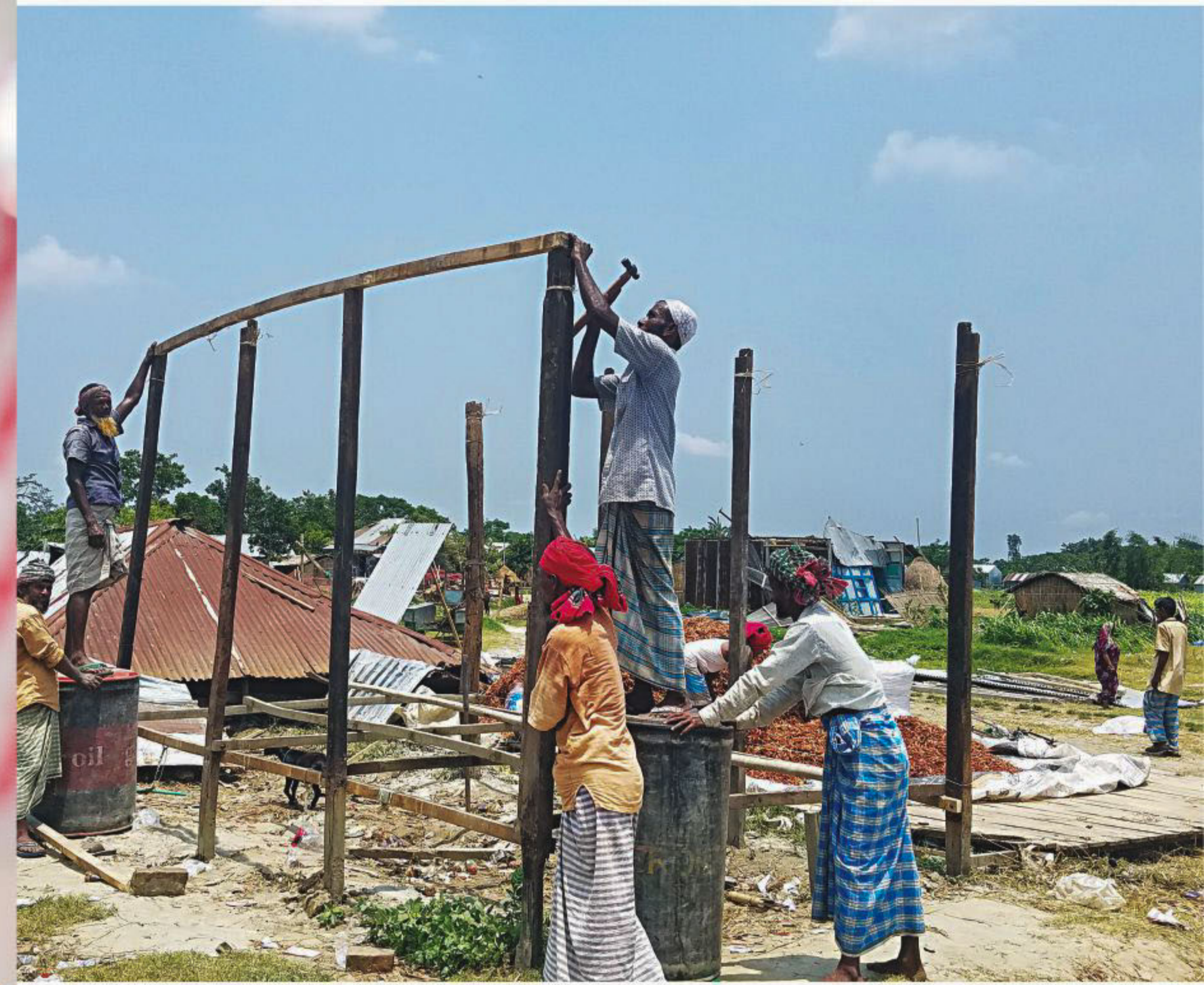
... in Chandpur's Rajrajeshwar union in the sadar upazila yesterday. When Cyclone Fani generated over 100 houses in the area and damaged many more. Around 14 people also died in the country during the cyclonic storm.

"Let's listen to what the voters said in the elections and put our differences aside for a moment. Let's do a deal." THERESA MAY URGES JEREMY CORBYN ON BREXIT