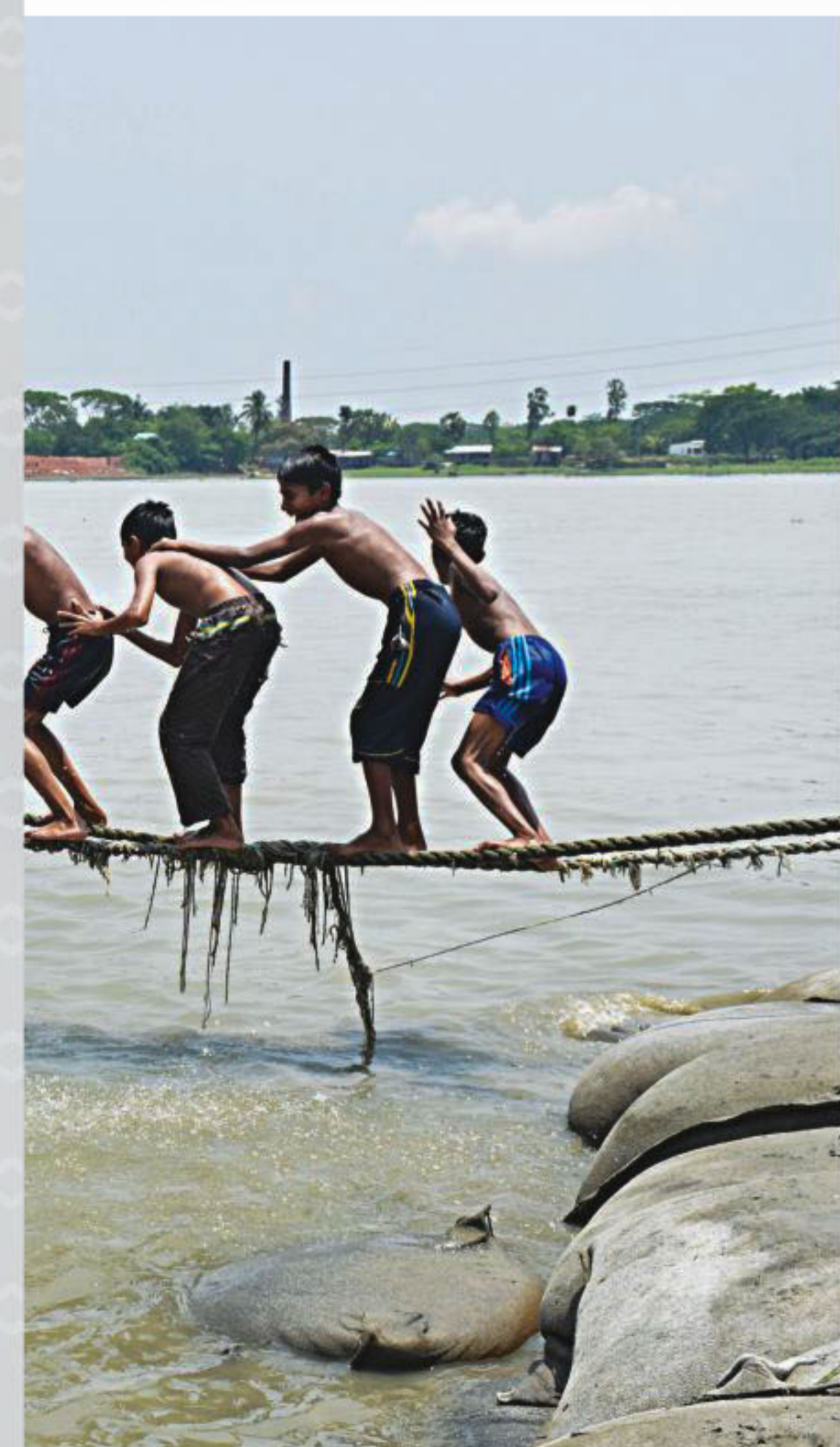
...ng waters provide the children with ...pur area.