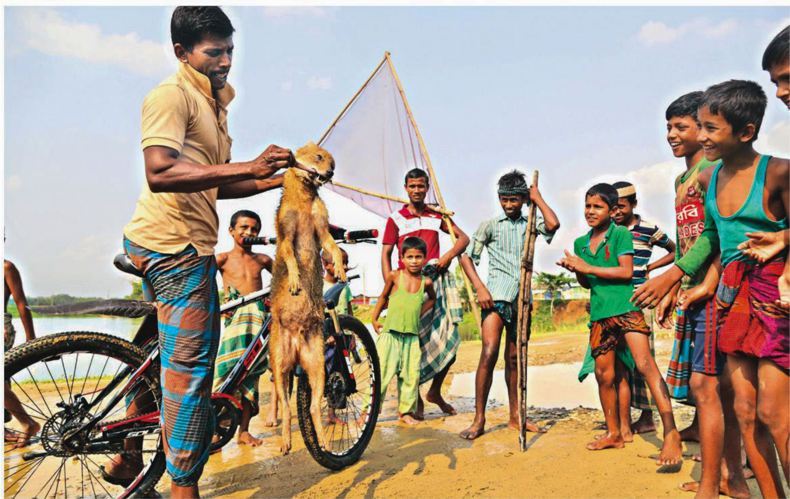
Due to raised water level because of cyclone Fani, many wild animals came out of their natural habitats. Taking this opportunity, children in Sylhet Sadar upazila's Baish Tila area hunted foxes. Considering that cases such as this are frequent in Bangladesh, awareness against animal cruelty is much needed.