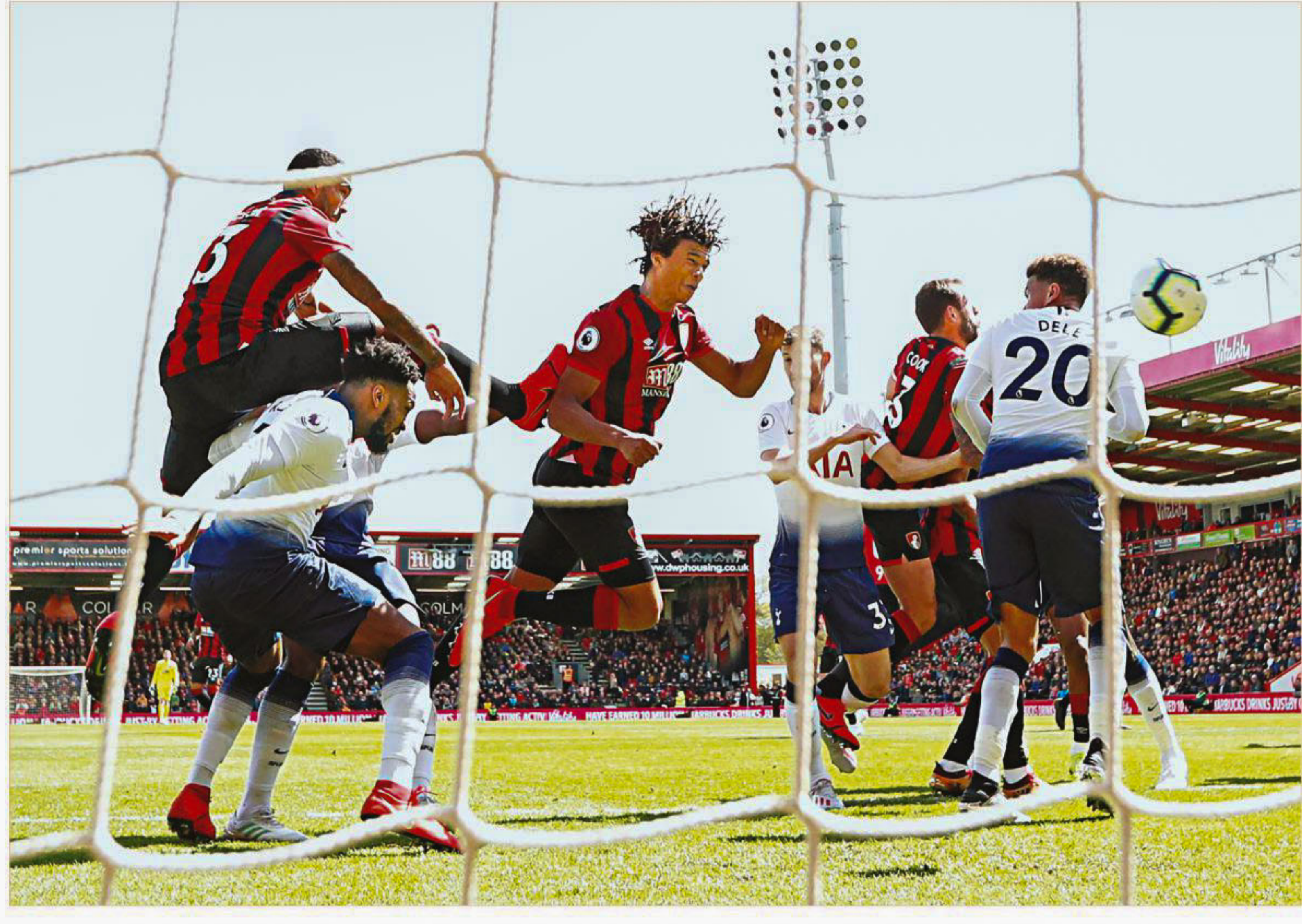
Bournemouth defender Nathan Ake (C) heads in the all-important goal against Tottenham Hotspur during their Premier League encounter at the Vitality Stadium yesterday.