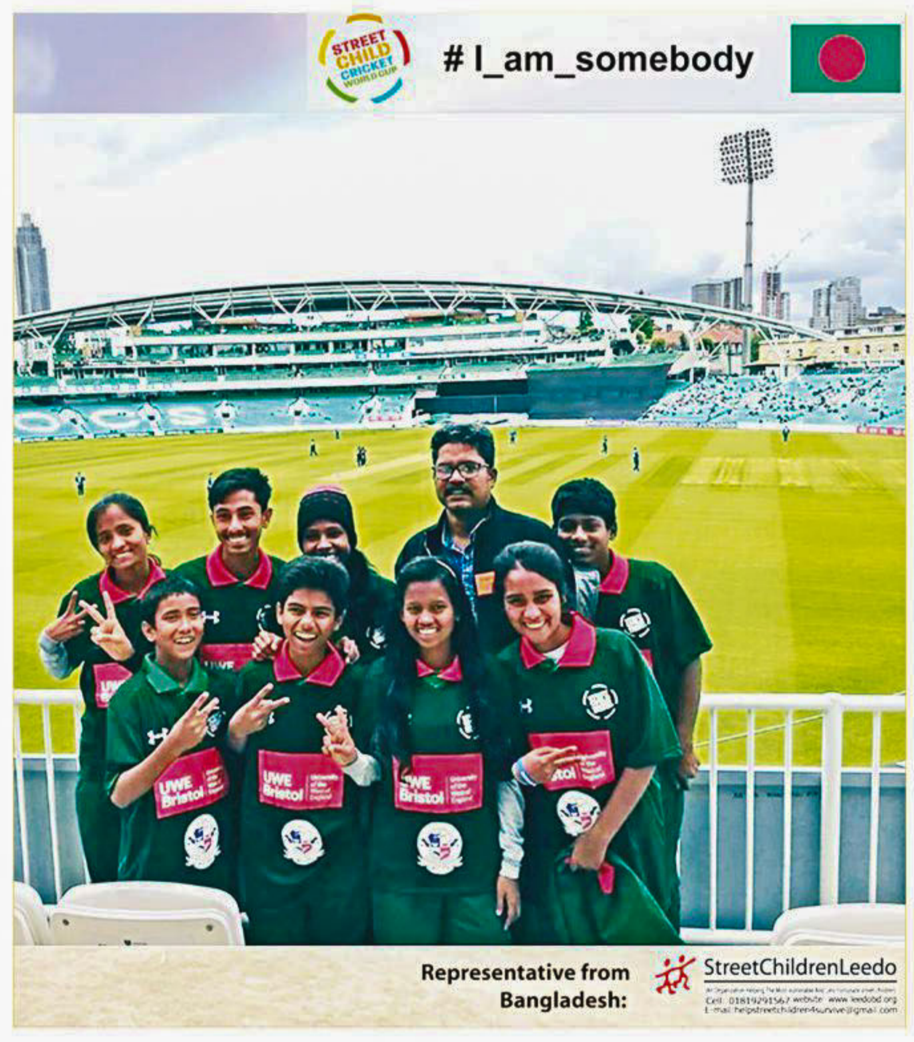
Bangladesh celebrate after winning against the West Indies and Mauritius in the first Street Child Cricket World Cup in Lord's yesterday. Teams consist of three girls and three boys. Each innings is 20 balls. Five players bowl a four-ball over. All teams play in Finals Day at Lord's on Tuesday.