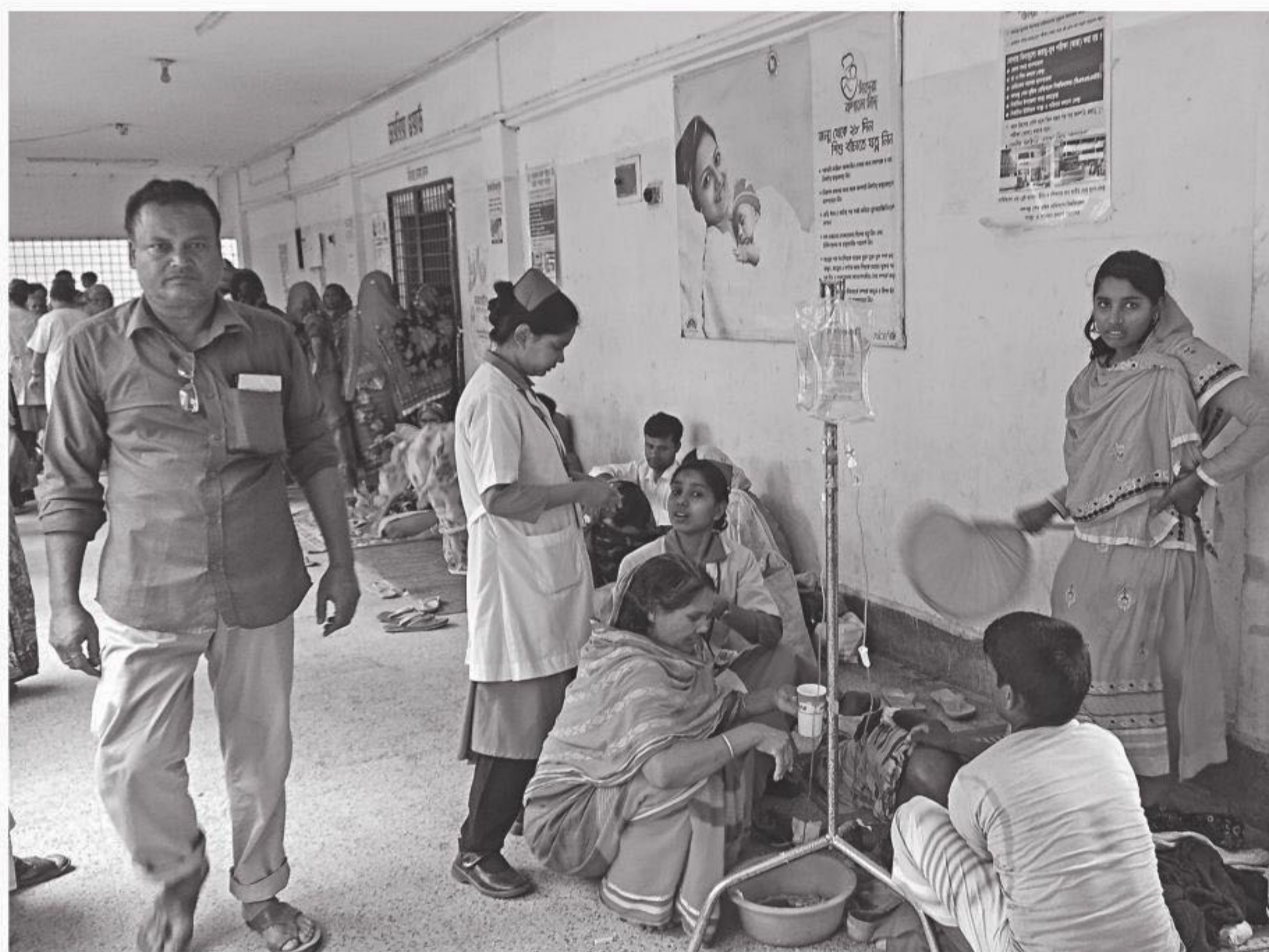
Treatment seekers lie on floor of Adhunik Sadar Hospital in Chapainawabganj as the 12-bed diarrhoea ward of the hospital fails to accommodate the rising number of patients attacked with the waterborne disease in the town.