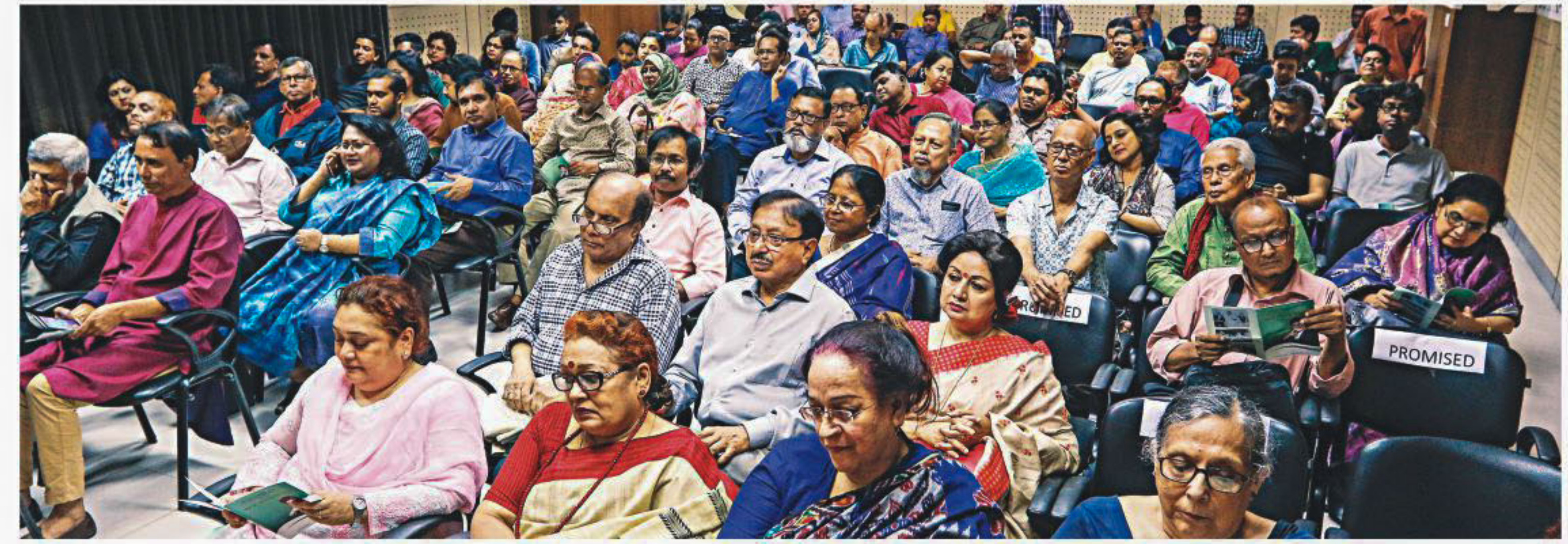
The houseful audience enjoying the show.