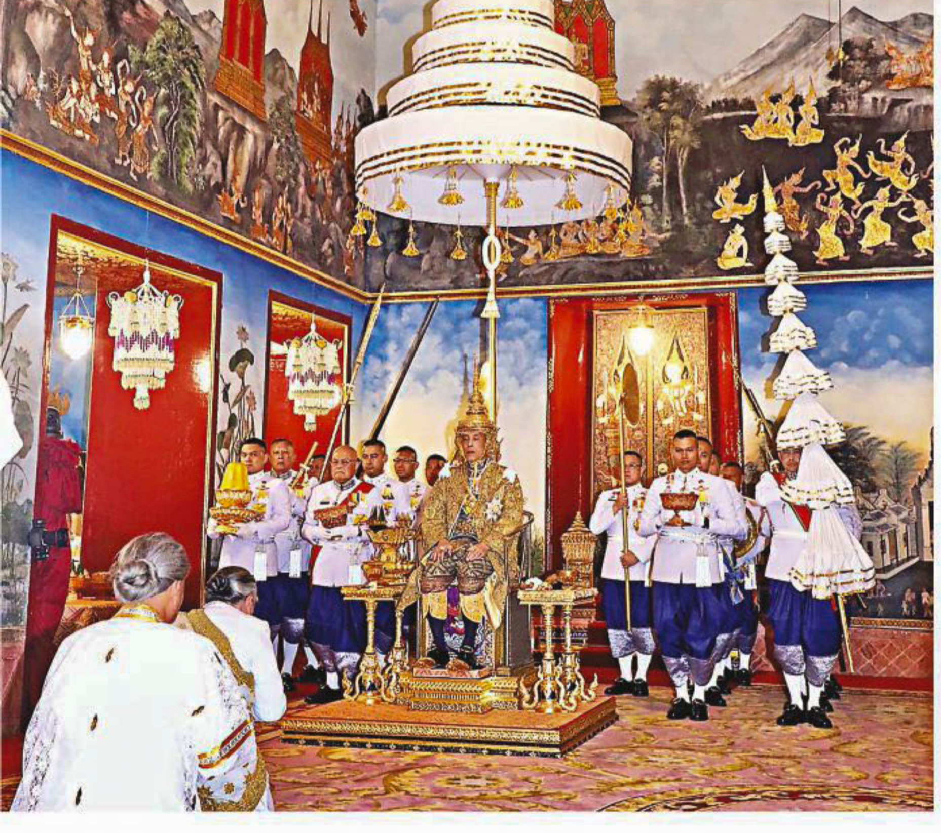
Thailand's King Maha Vajiralongkorn (C) sits on throne during his coronation inside the Grand Palace in Bangkok; Thailand's king appoints his Queen Suthida during the coronation; Thailand's Prime Minister Prayut Chan-O-Cha performs a ritual during the ceremony.

Sri Lankan authorities had advance warnings from Indian intelligence of the impending Easter attacks but police and security forces failed to act, leading to Sri Lanka's worst single suicide attack against civilians.