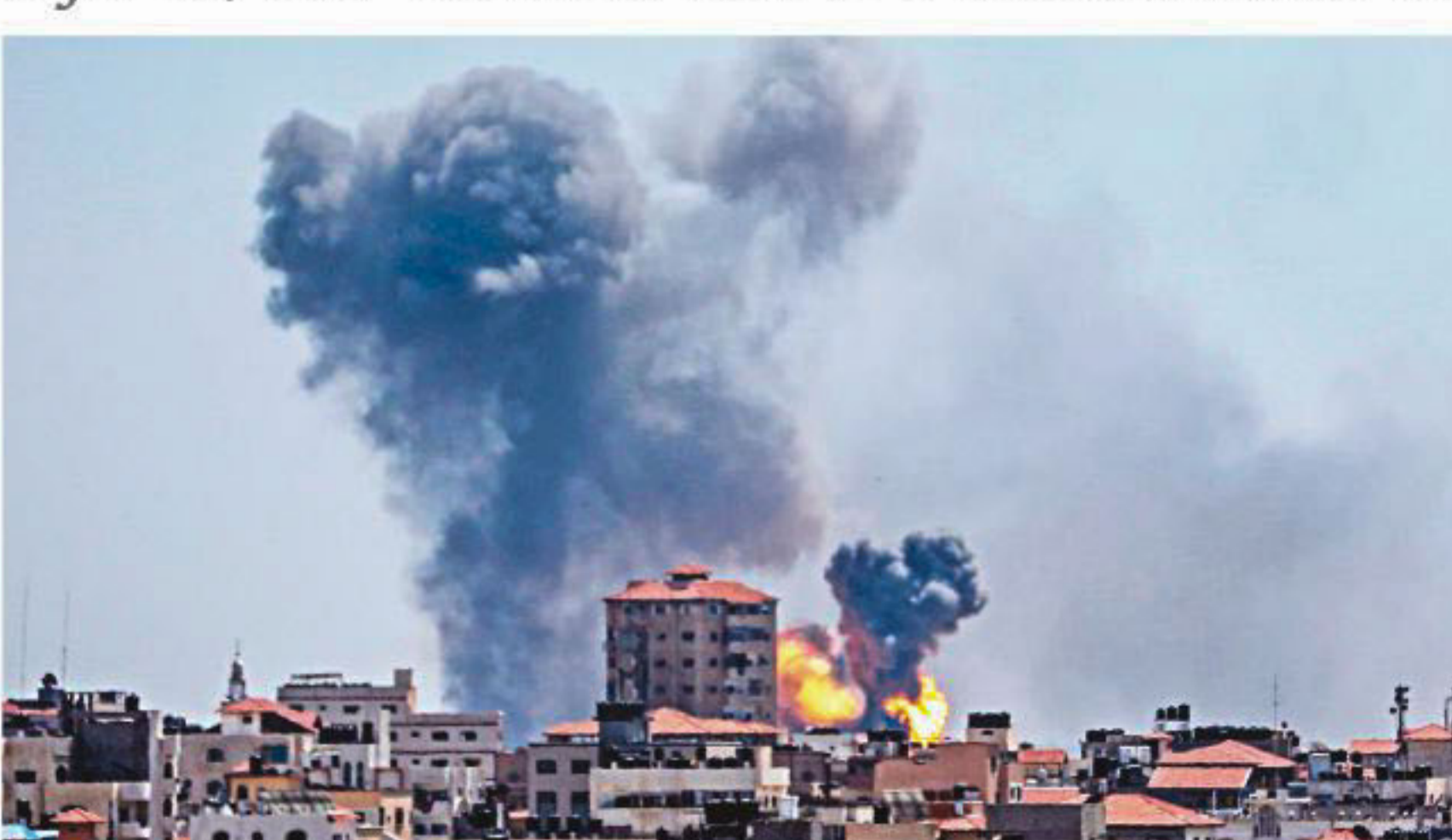
Smoke billows from buildings in Gaza following an airstrike by Israel in response to rockets fired by Palestinian militants.

The escalation follows the most violent clashes along the Gaza border