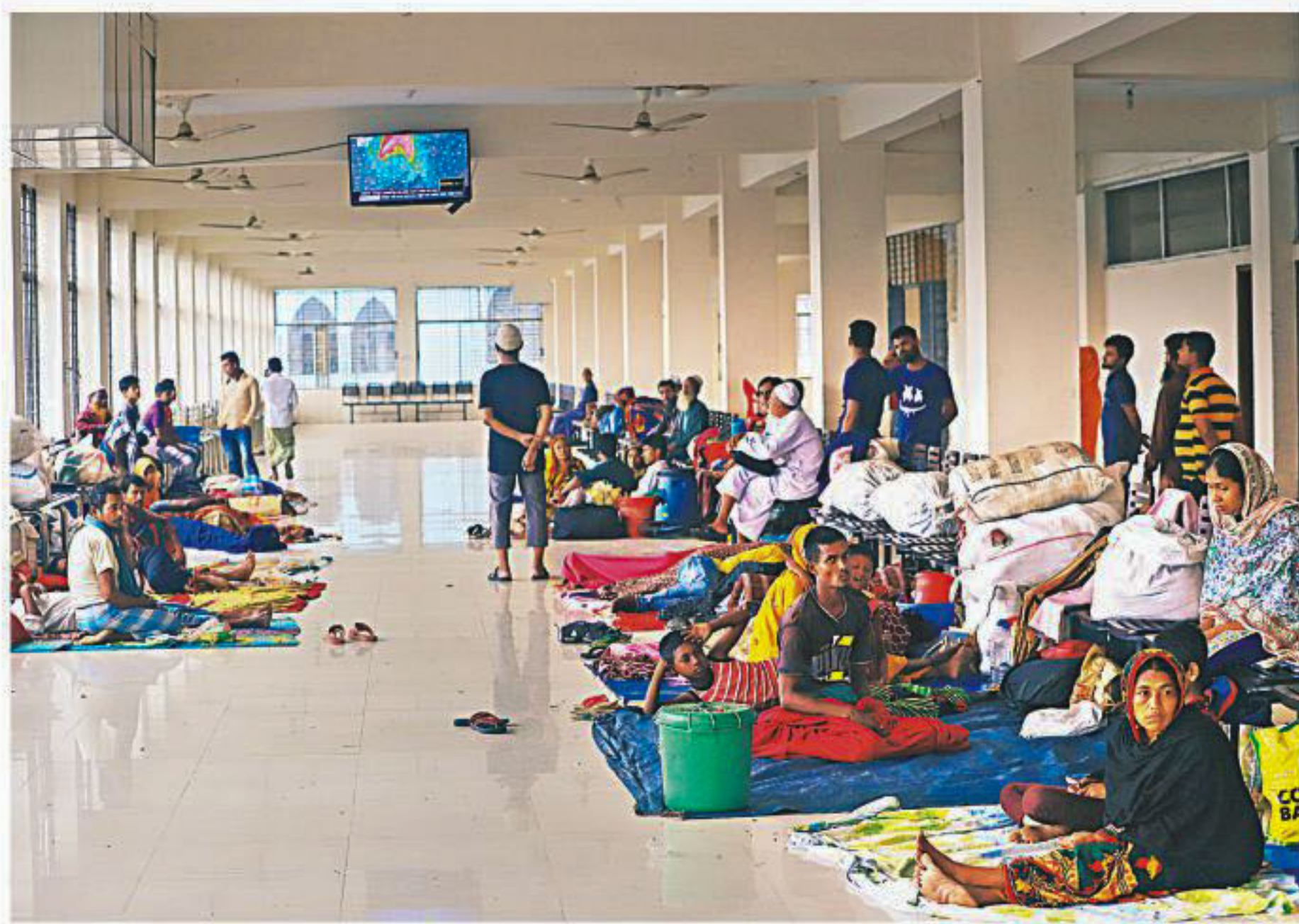
Homebound people, mostly from southern region, wait at Sadarghat launch terminal. No vessels left the terminal for three days due to rough weather triggered by the cyclone Fani. The photo was taken yesterday.