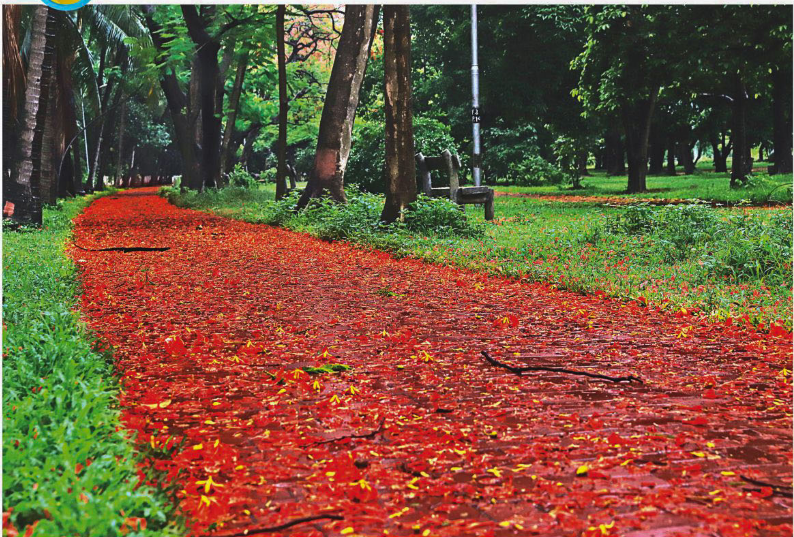
While the last couple of days have been full of anxiety due to cyclone Fani, nature sure has a way of blessing us with beautiful surprises. Yesterday's rain accompanied by gusty wind not only brought the temperature down, but also set this walkway in Ramna Park ablaze with crimson petals of Krishnachura. It seems that nature decided to paint the country's national flag with red petals against the rejuvenated greens.