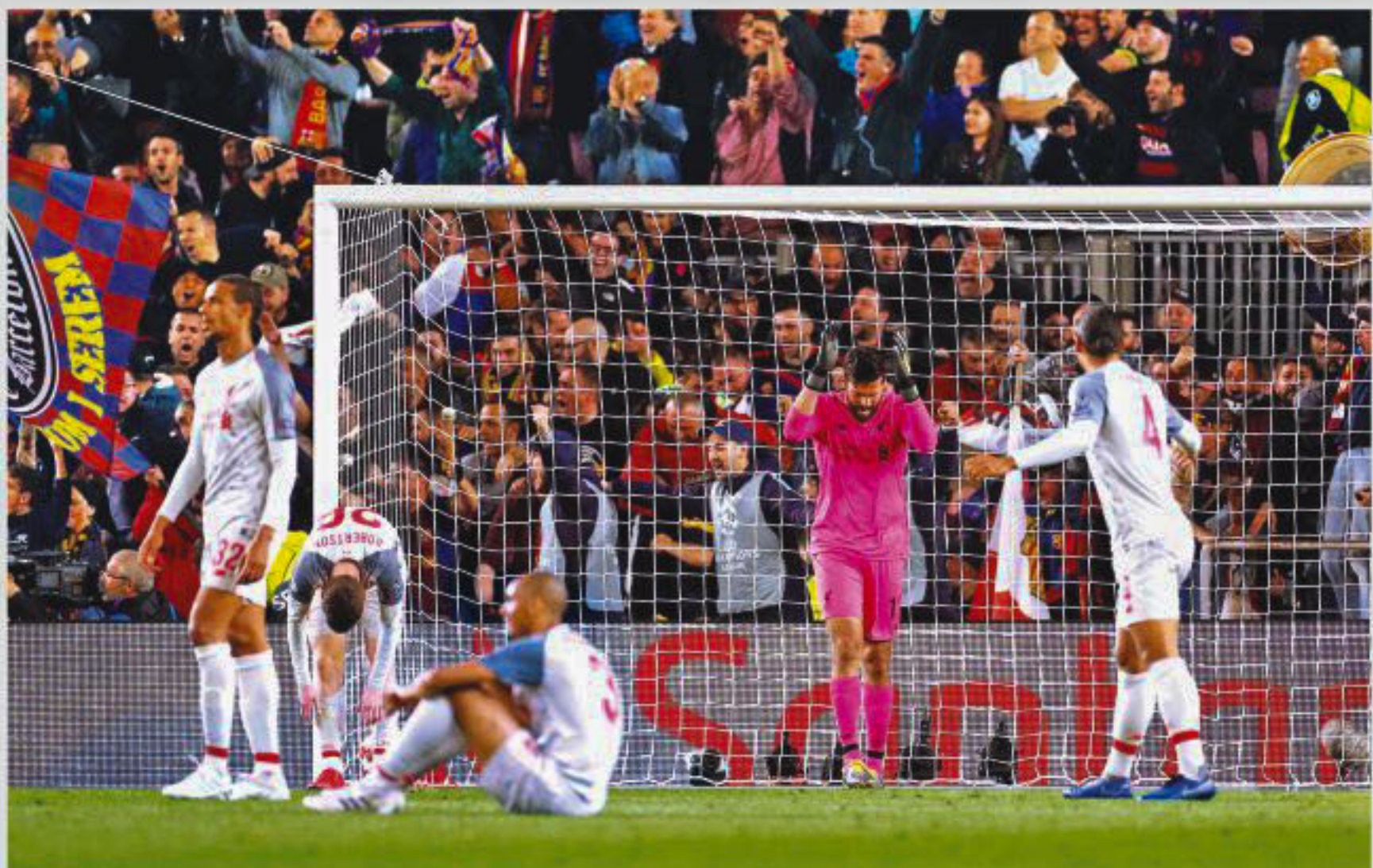
Liverpool players are dejected after their 3-0 defeat against a Messi-inspired Barcelona in the Champions League semifinal first leg tie at the Nou Camp on Wednesday.

Barcelona threw away a three-goal lead in the Champions League last year and Liverpool, with Anfield behind them, will certainly be hopeful of a 'remontada' against the Spaniards.