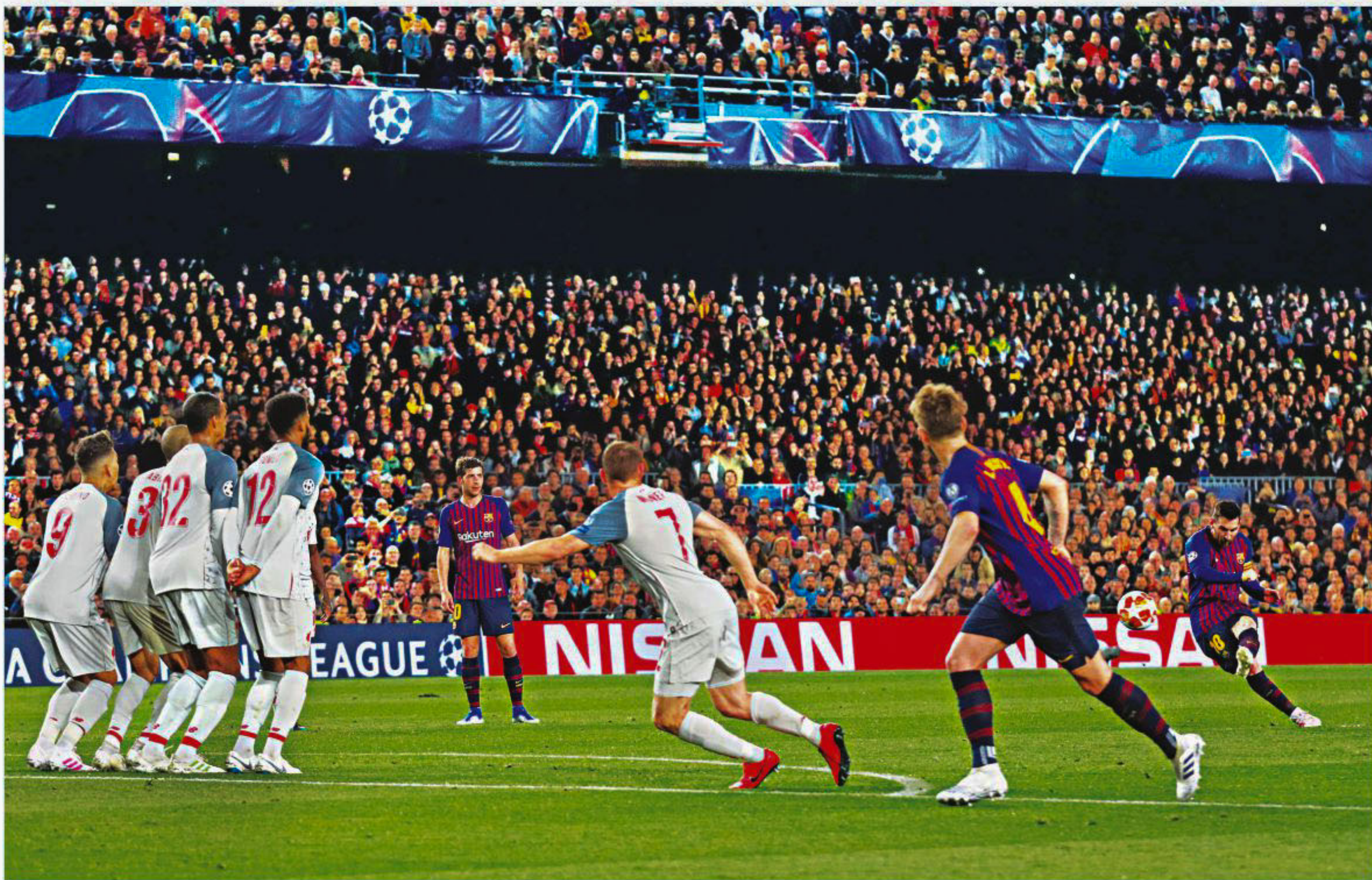
Barcelona superstar Lionel Messi (R) scores his second and the team's third goal from a sublime freekick to condemn Liverpool to a 3-0 defeat in their Champions League semifinal first leg encounter at the Nou Camp on Wednesday.

Even the heartbreak posed by the outlook of Liverpool not winning anything again this year can be offset by the strides that the club has made on the pitch, coupled with the exciting brand of football they play week in and week out -- meaning things are likely to change sooner rather than later.