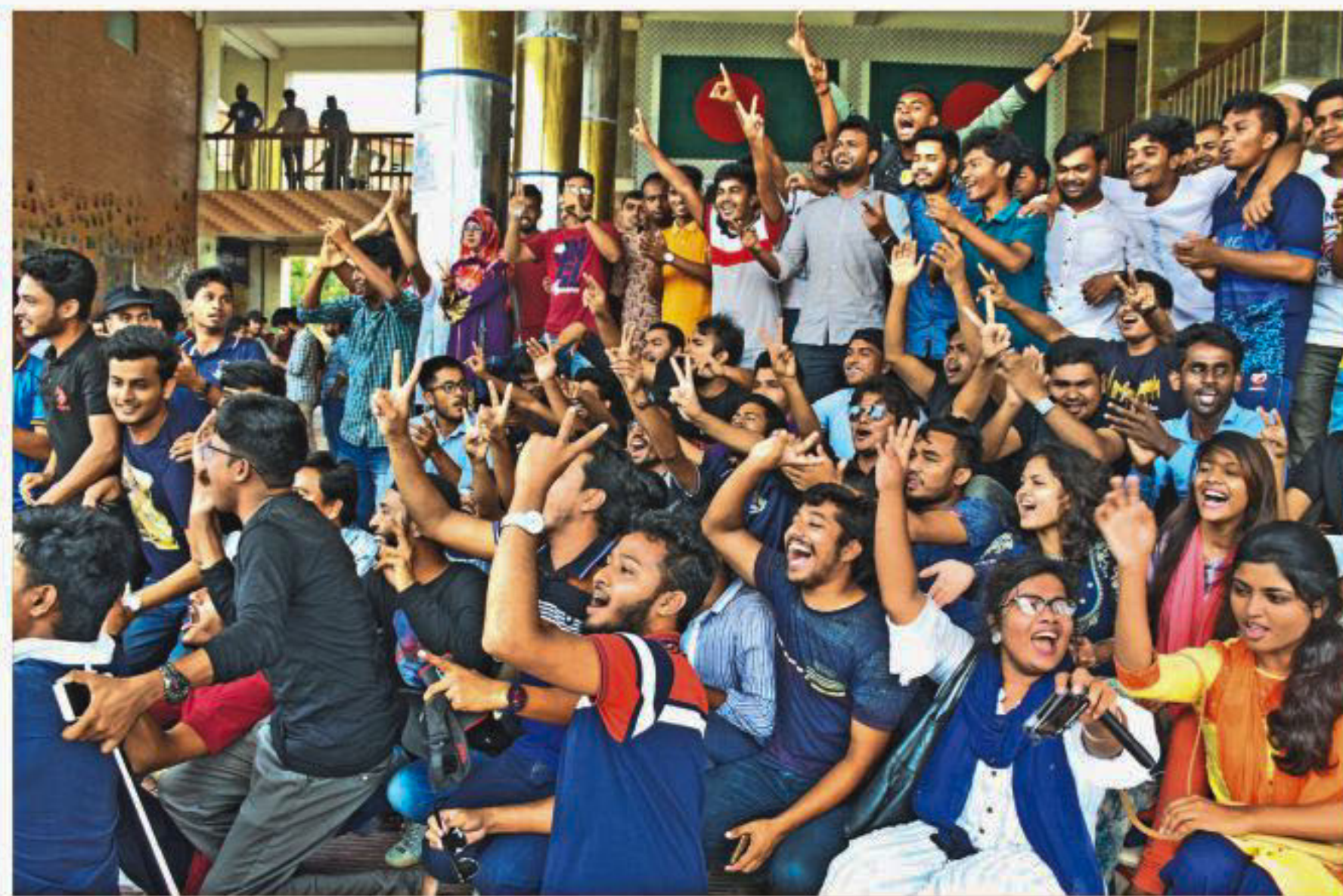
Barishal University students flash victory signs after receiving news of the VC's leave. Their demand was met after 35 days of protesting.