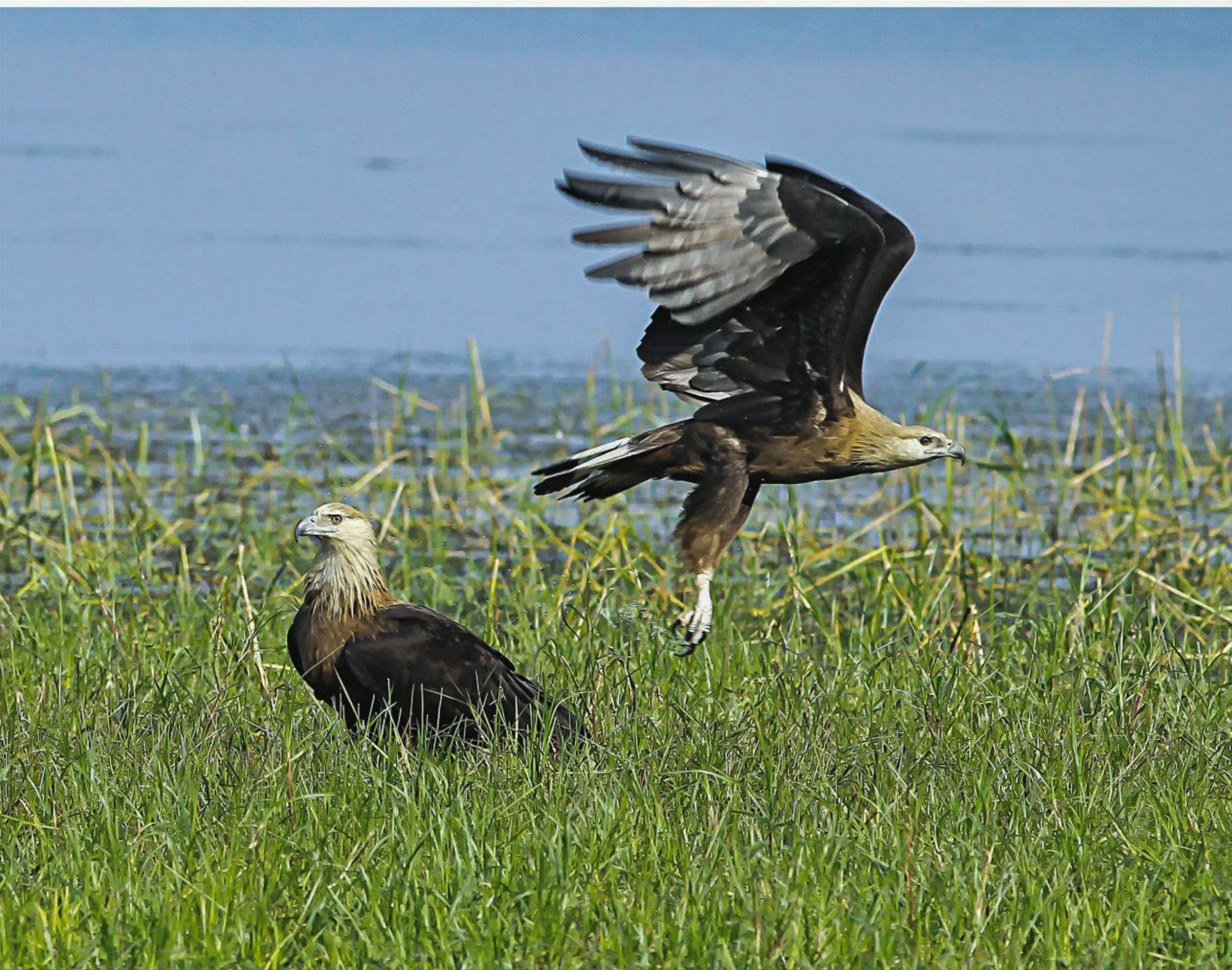
Pallas's Fish Eagle comes to the Haor basins of Bangladesh to breed in winter. This raptor is largely dependent on healthy freshwater wetland ecosystems.