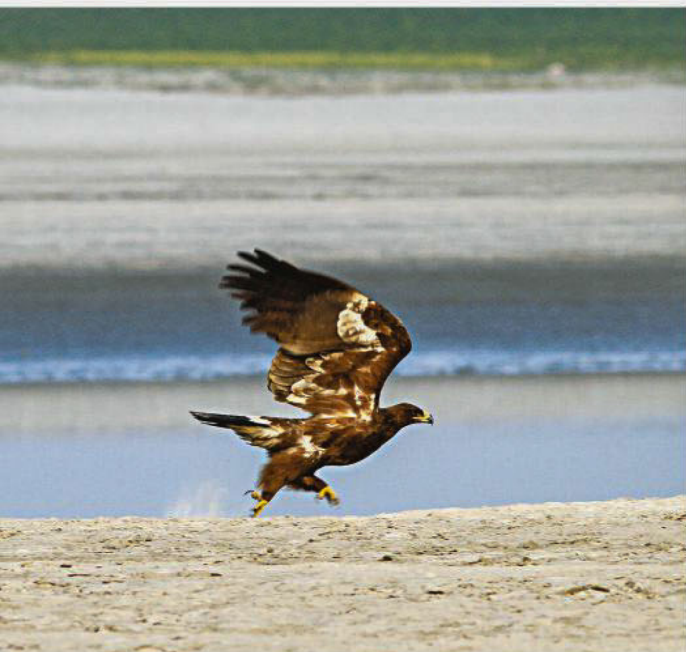
The endangered Steppe Eagle mainly occurs in riverine habitats along Padma and Jamuna rivers in winter.