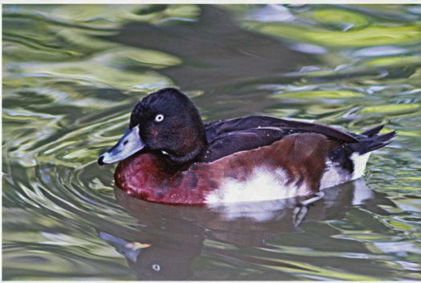
Only a few hundred of the critically endangered Baer's Pochard is left in the world. This migratory duck visits our freshwater wetlands of northeast Bangladesh, especially Tanguar and Hakaluki Haor.