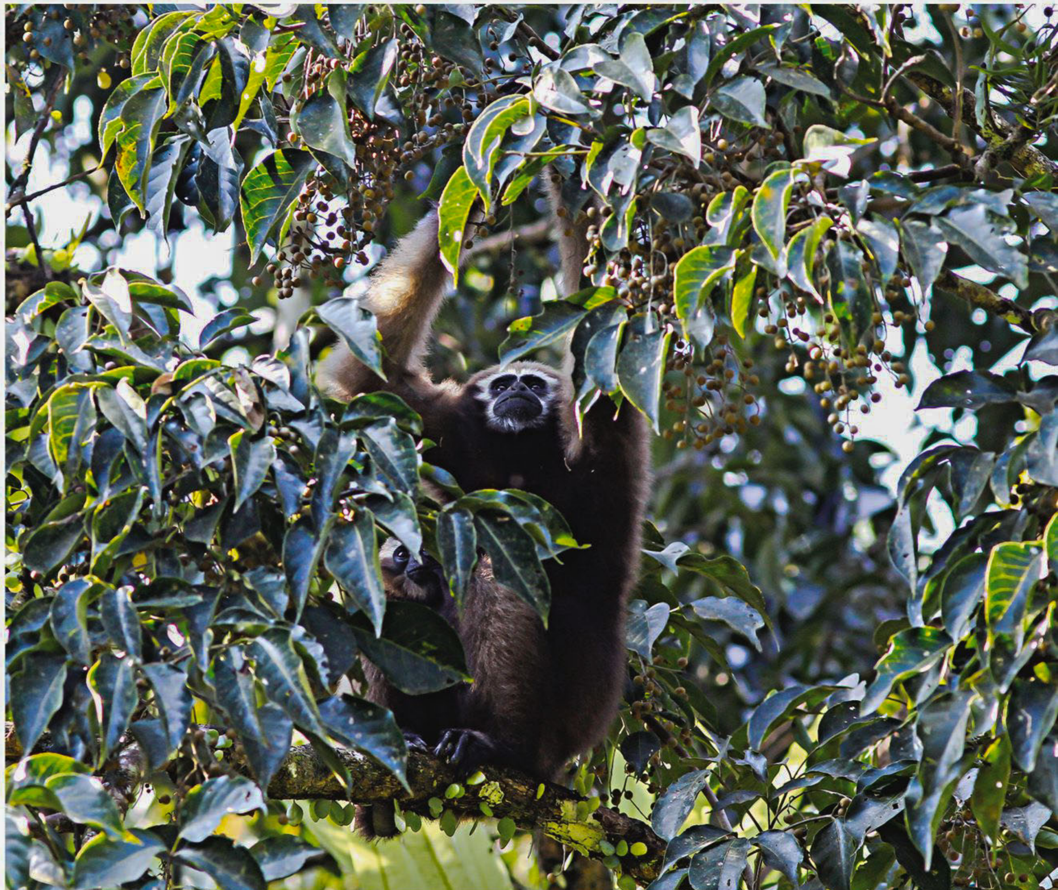
Hill forests of Sylhet and Chittagong divisions still echo with Western Hoolock Gibbon's fascinating calls. It is also listed as globally endangered.