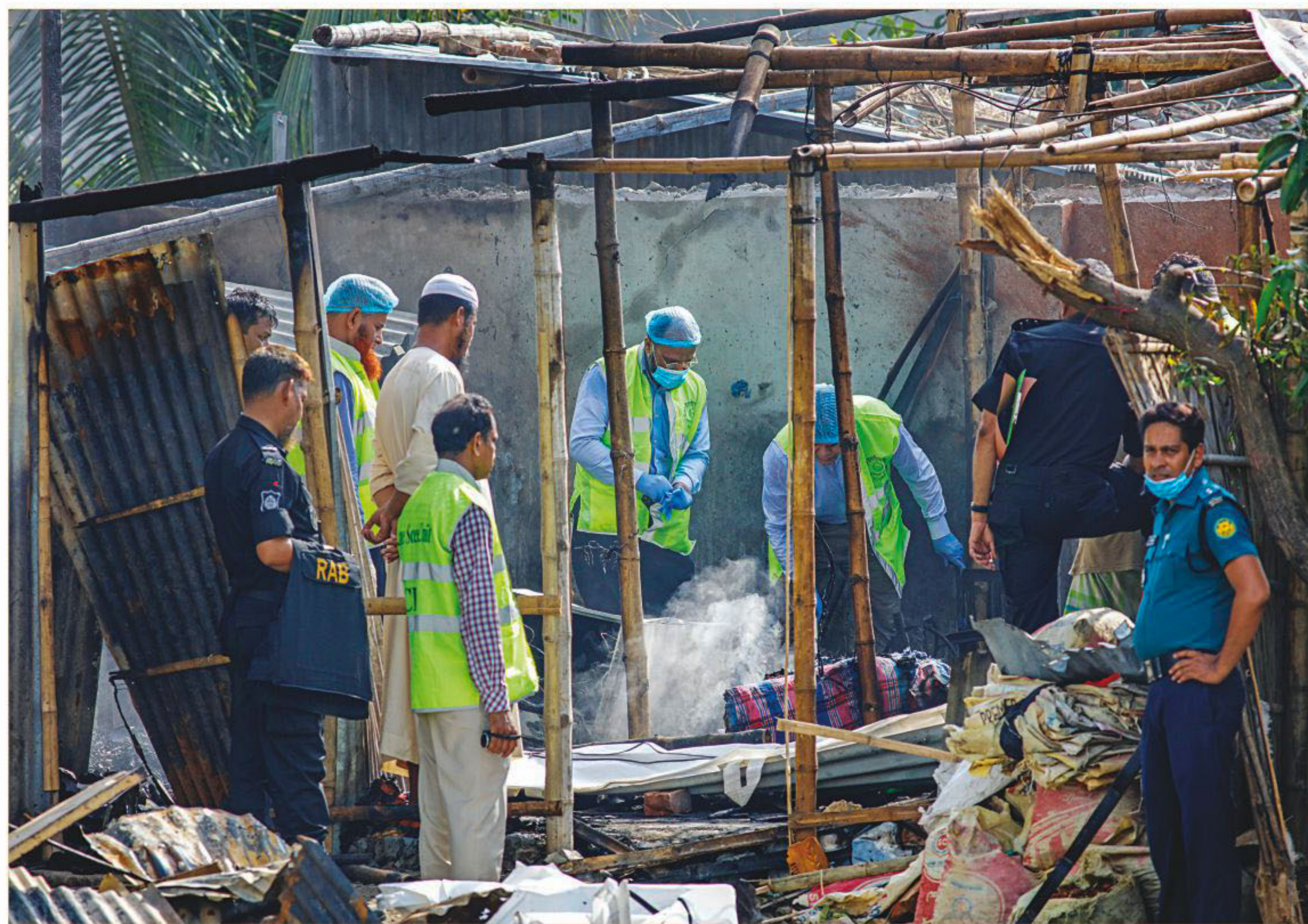
Crime Scene Unit officials inspect the charred remains of two suspected militants who allegedly detonated an improvised explosive device during an anti-militancy drive by Rab in the capital's Bosila yesterday.