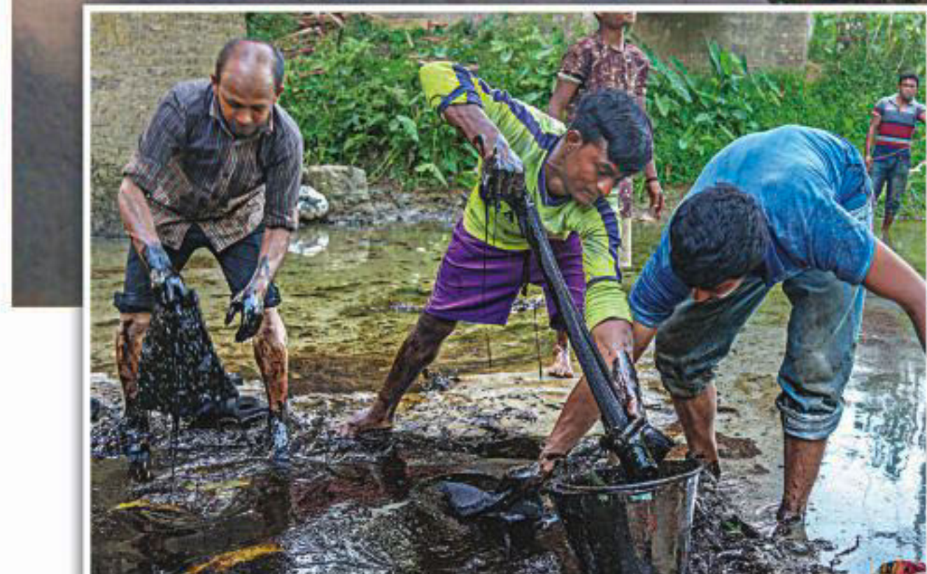
Overturned tank wagons of a furnace oil-carrying train that derailed over a canal, connected to the Halda river, in Chattogram's Hathazari upazila yesterday. Inset, labourers collect spilled oil from the spot.