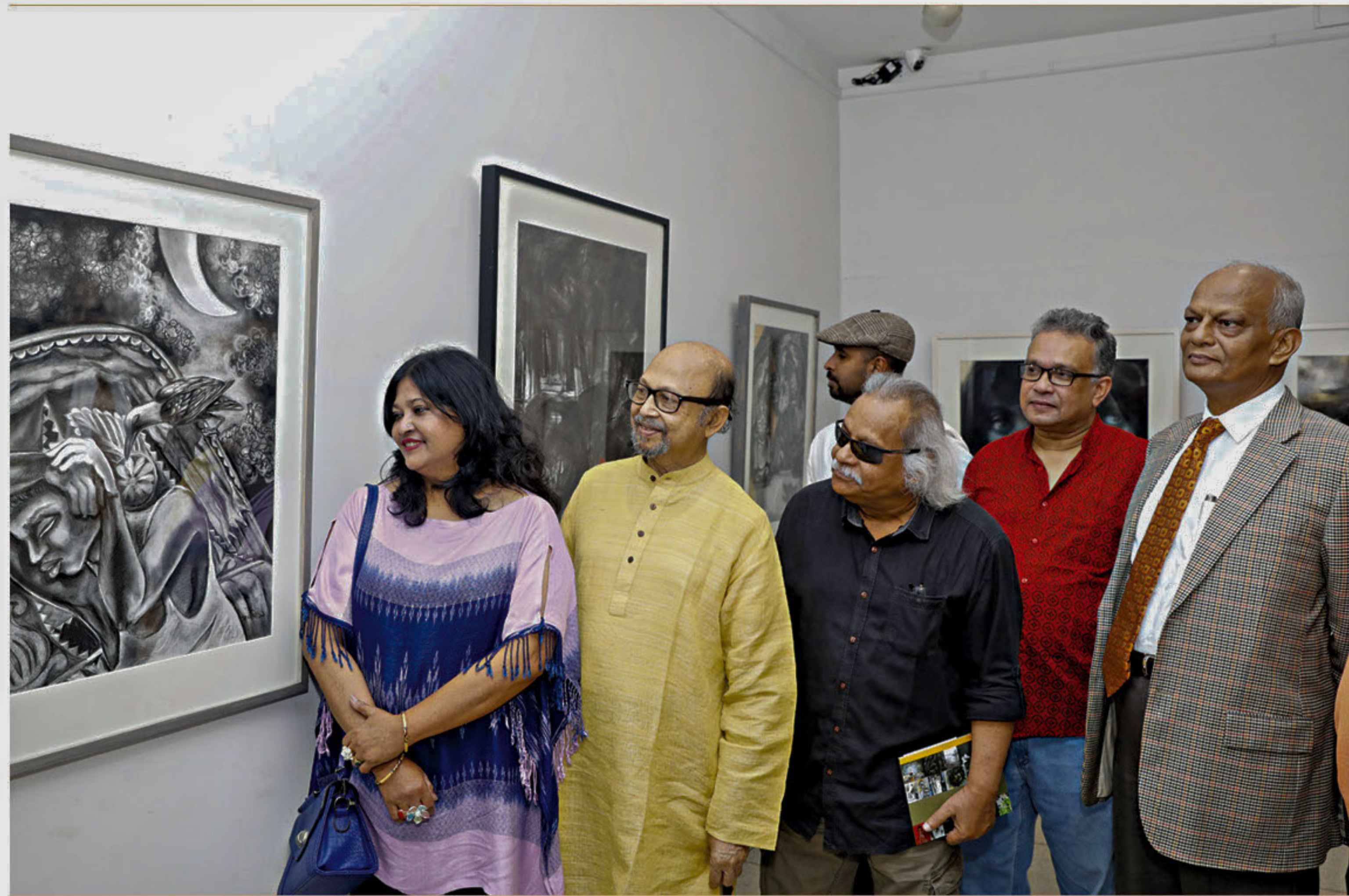
Guests, participating artists and art lovers attended a group art exhibition that is being hosted by Galleri Kaya at its premises in Uttara. The display of 54 artworks by 24 prominent and promising artists will conclude on May 11.