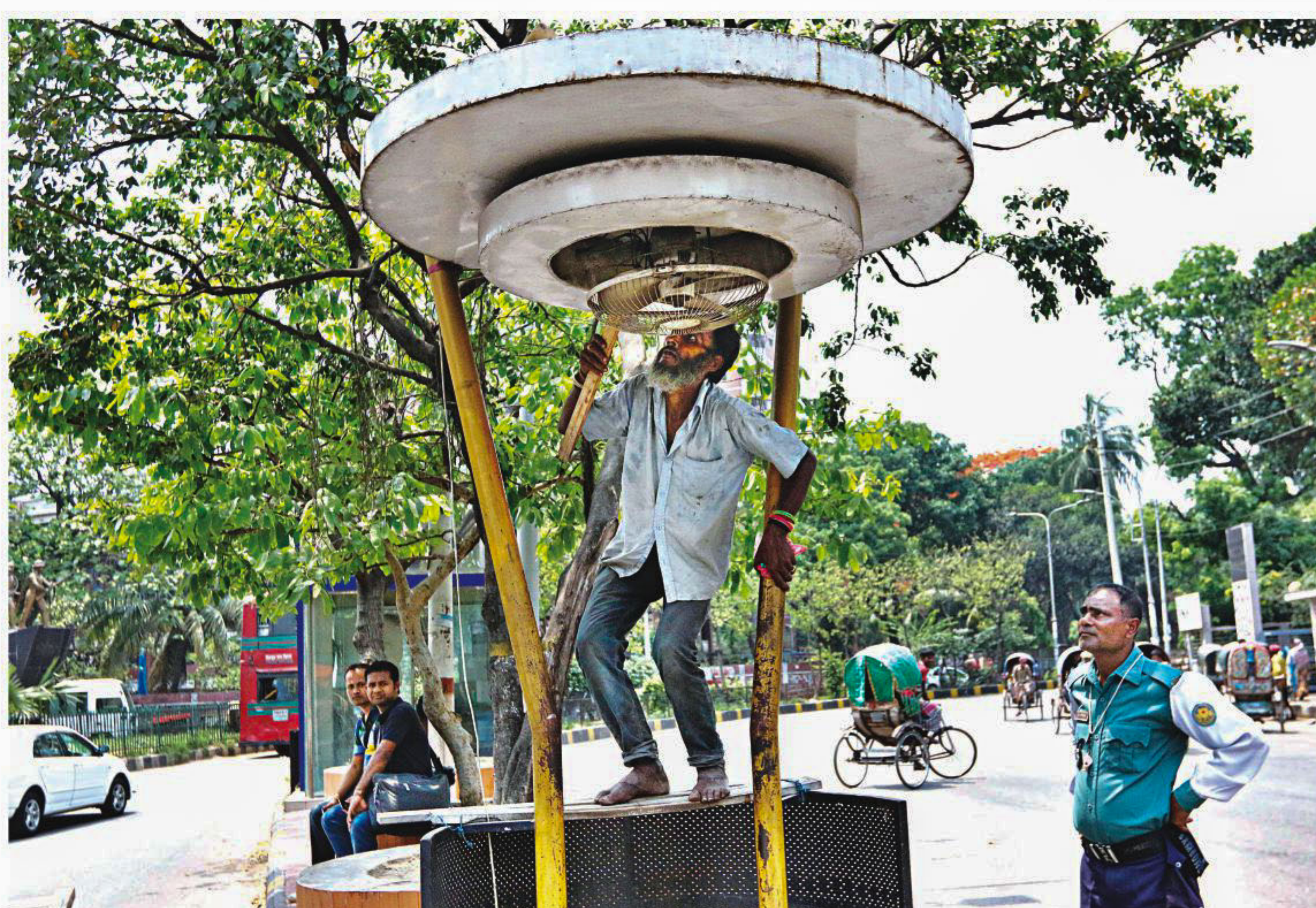
A man tries to help out a traffic policeman by attempting to fix a broken fan in the traffic island near Bangabazar intersection in the capital. With temperatures soaring to the mid-30s for days, city dwellers continued to suffer in the heatwave yesterday.