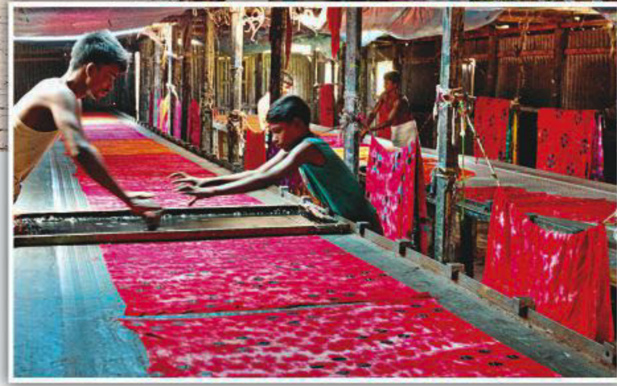
A man carries wax print fabrics he produced to a local market in Narayanganj's Arahazar upazila yesterday. The area is home to thousands of families that make such fabrics, and with the Eid just over a month away, they are making the clothes at a fast pace, inset.