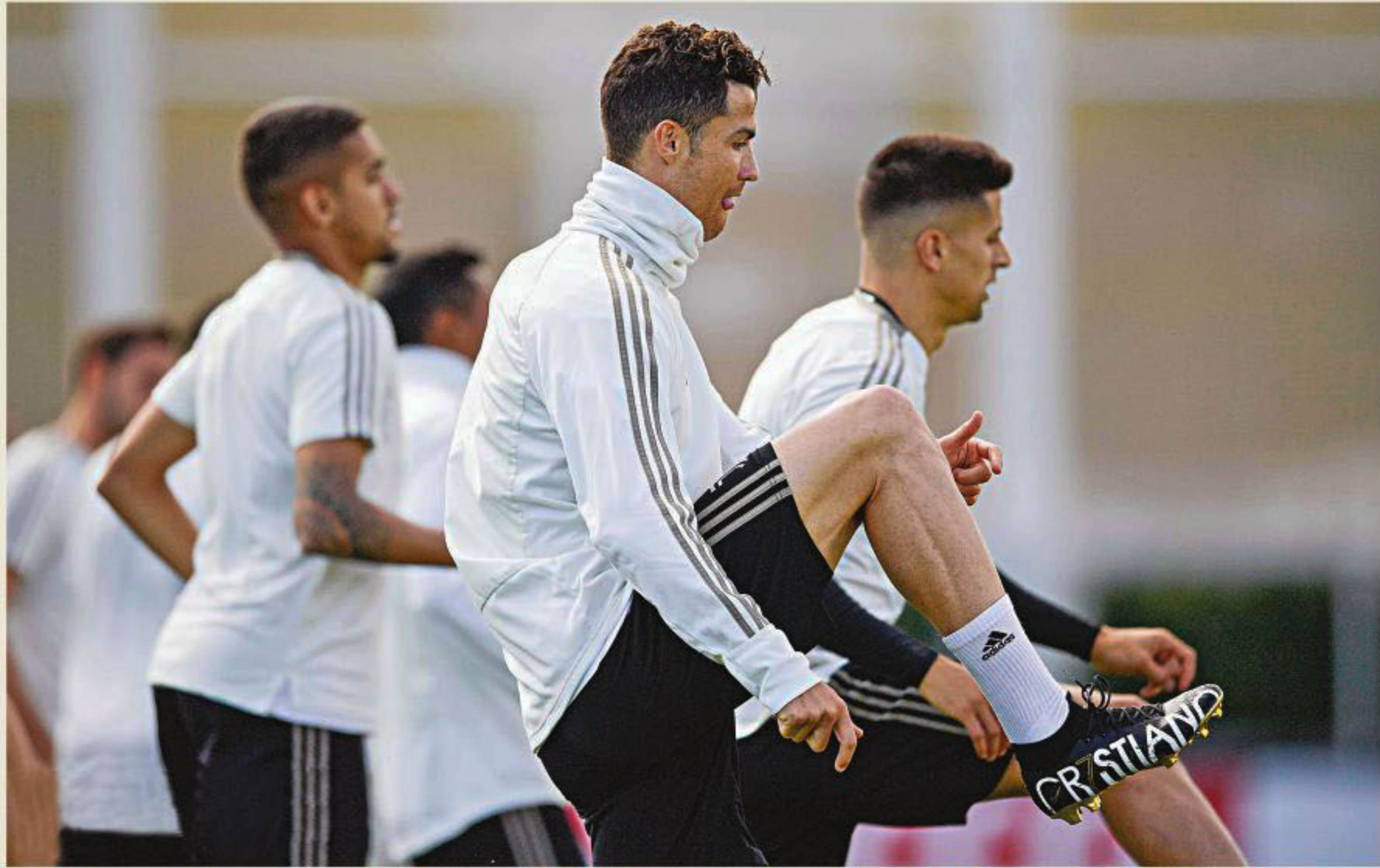
Juventus superstar Cristiano Ronaldo showed up to training showing off his new pair of boots, which feature the icon's name on the side.

Spurs can widen that lead over their north London rivals even further when West Ham travel to the new Tottenham Hotspur Stadium on Saturday hoping to become the first visiting team to score at the fifth time of asking in the club's new home.