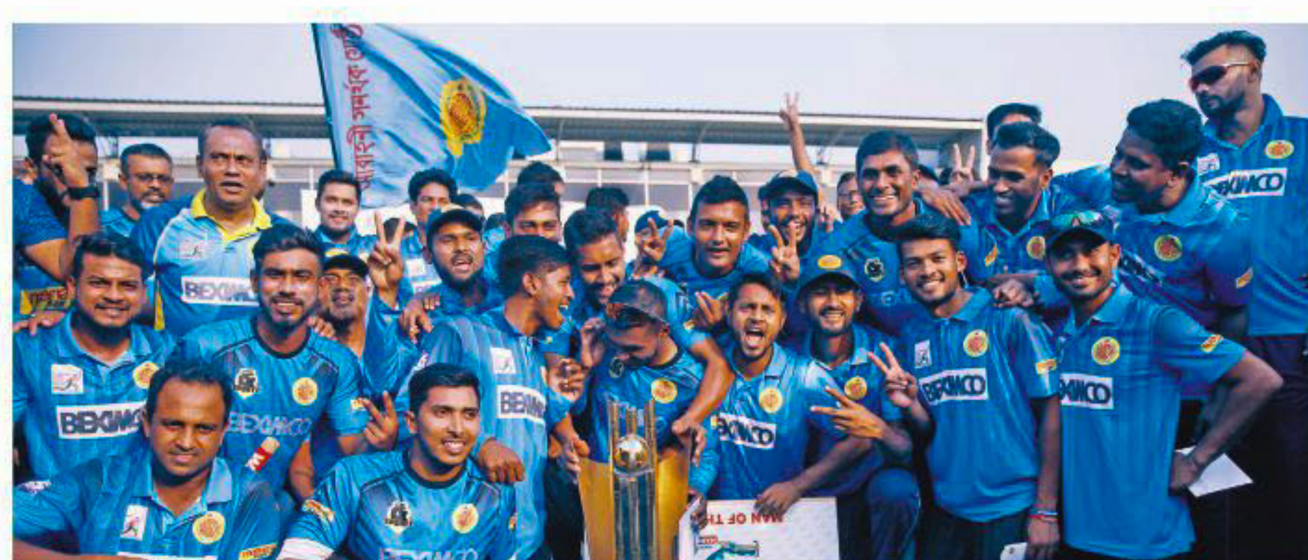
Due to a better net run rate, Abahani beat Legends of Rugganj to the DPL title following a nine-wicket win over Sheikh Jamal in Savar yesterday.