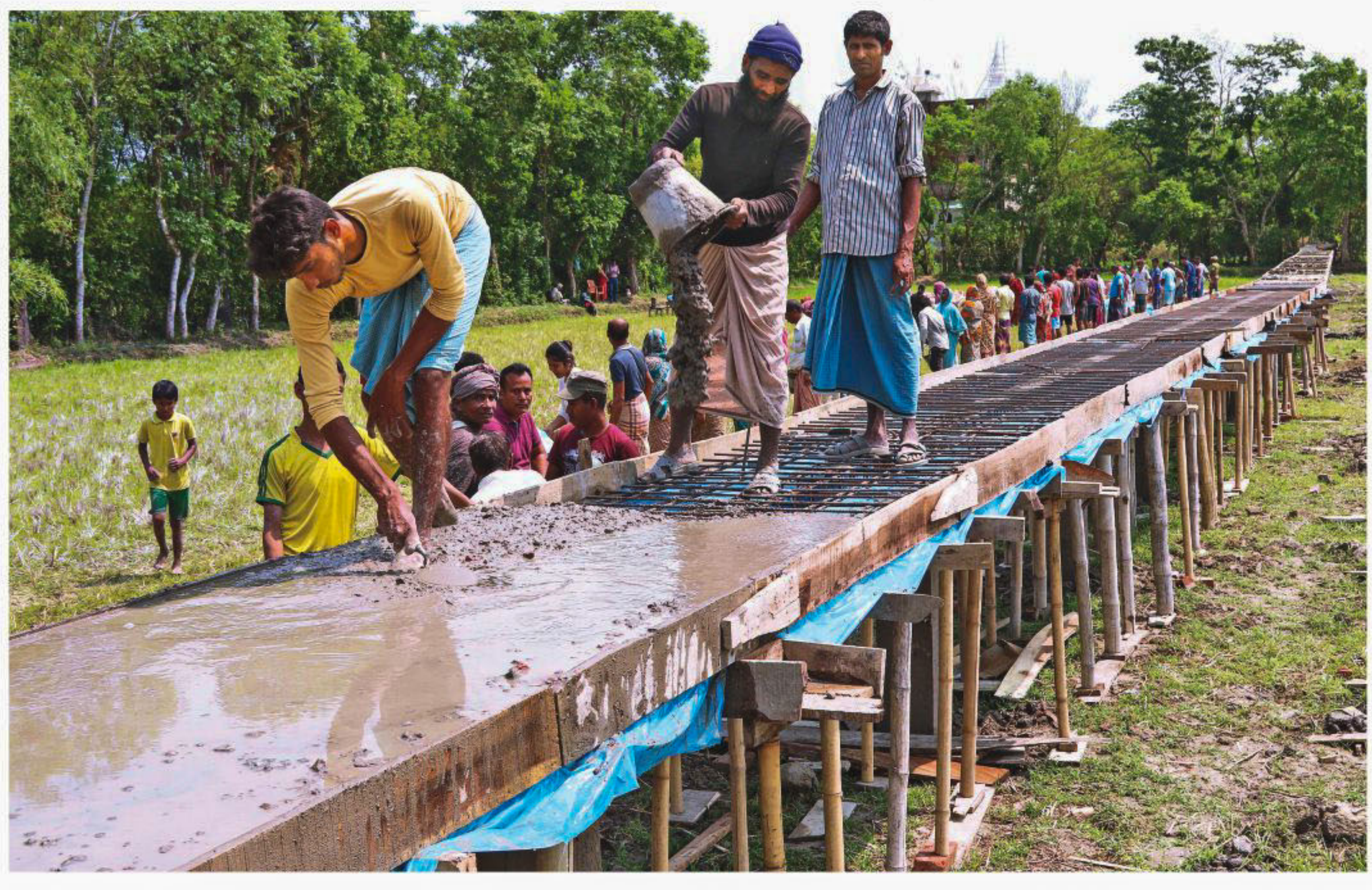
Local volunteers pour and smooth out concrete on the under-construction bridge, while others form a supply chain of the material. The photo was taken recently.