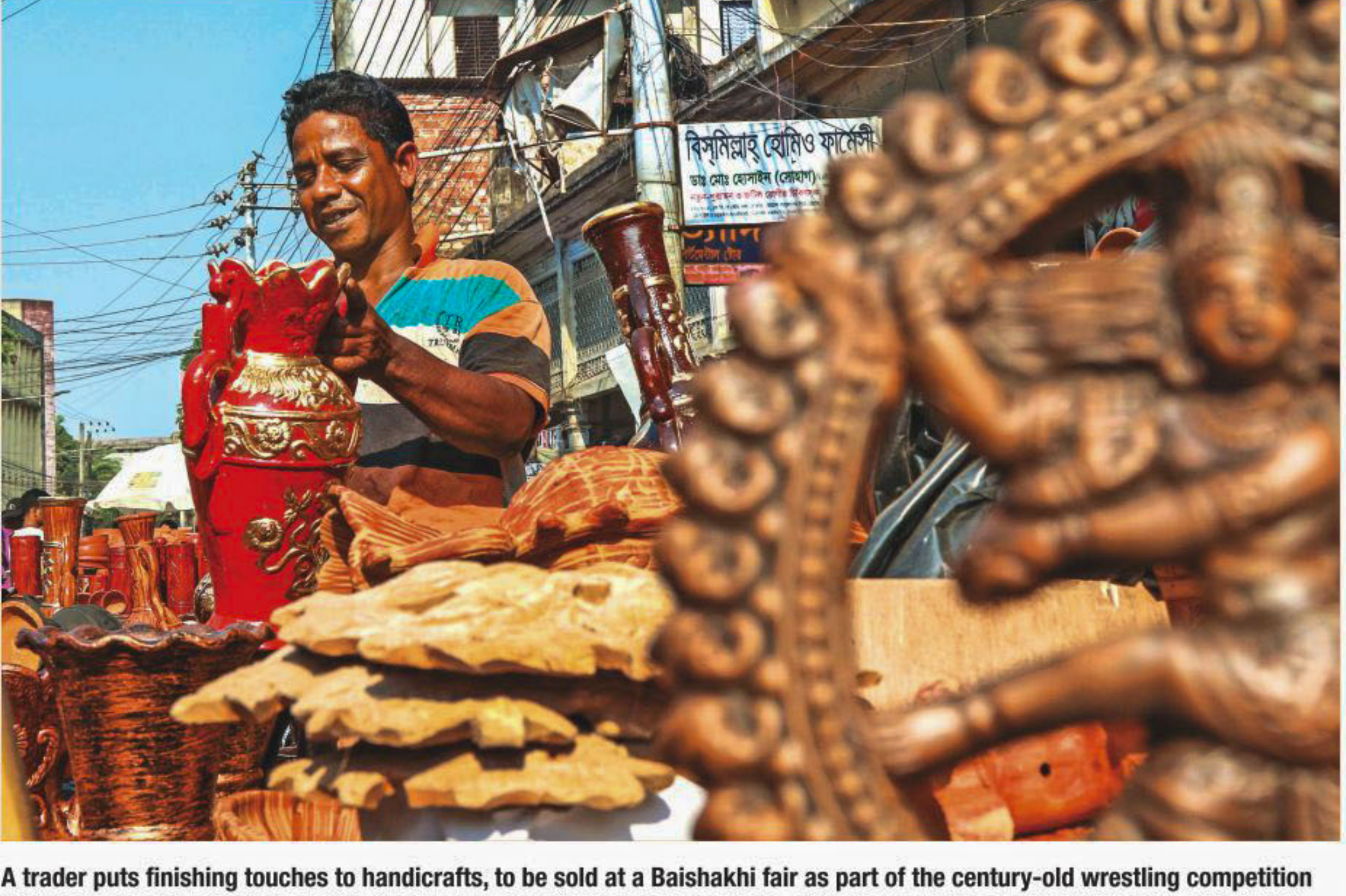
A trader puts finishing touches to handicrafts, to be sold at a Baishakhi fair as part of the century-old wrestling competition "Jabbar-er Boli Khela" in port city. Considered one of the oldest traditions of Chattogram, the event will be held at Lalidighi Maidan tomorrow.