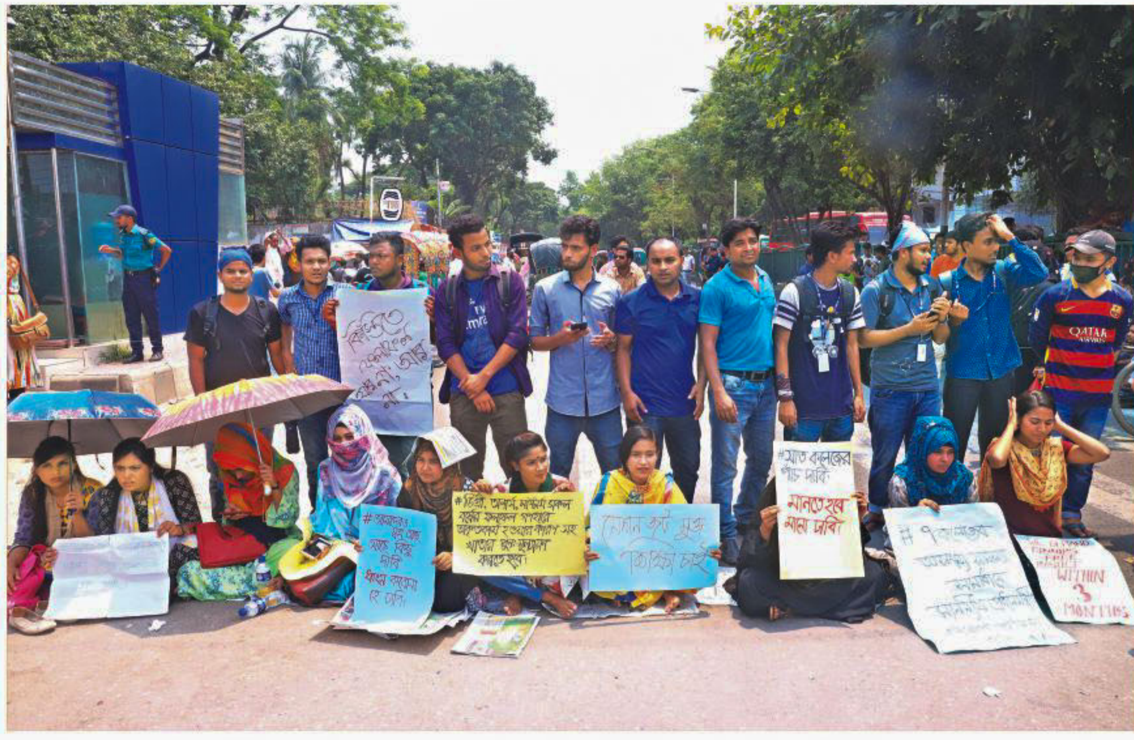
Students of seven DU-affiliated colleges demonstrate blocking Nilkhet intersection yesterday.

They later blocked the intersection till 2:30pm, halting traffic movement and causing severe traffic congestion in the area.