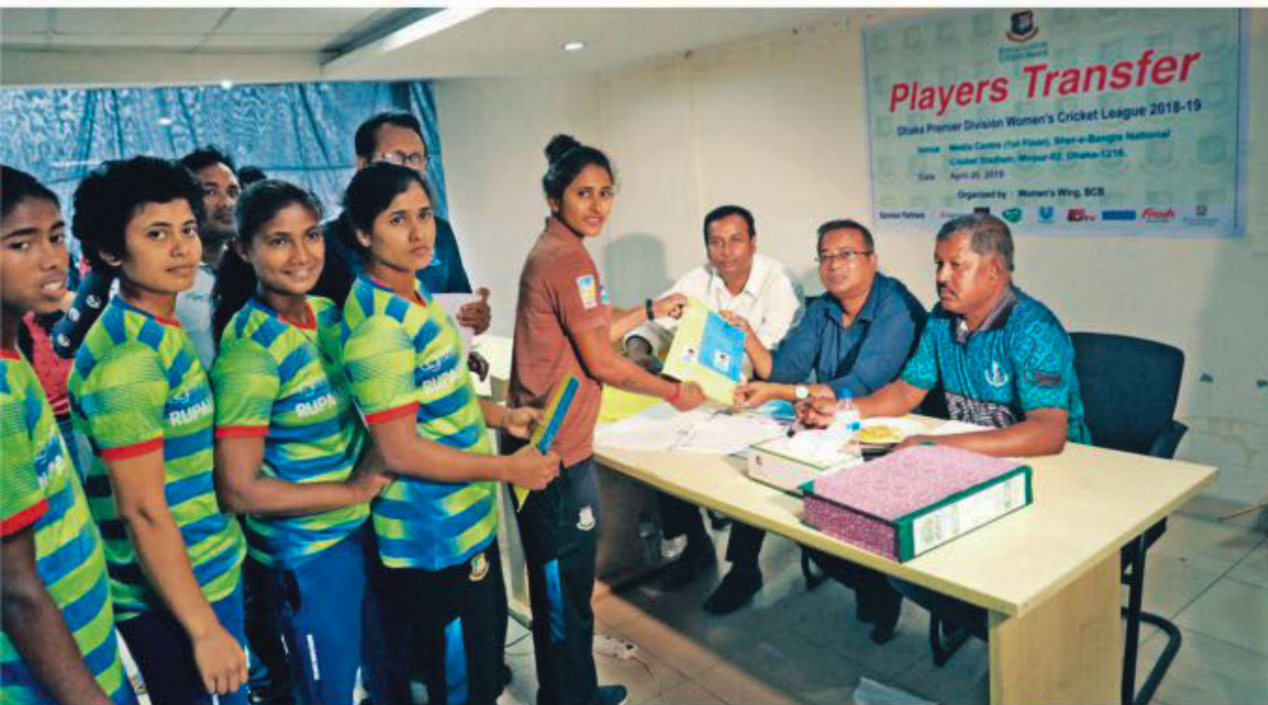
The players' transfer event for the Dhaka Premier Division Women's Cricket League, scheduled to begin from April 25, was held yesterday in Mirpur. Ten teams will participate in single league format before the top five teams battle it out in the Super League stage for ultimate glory.