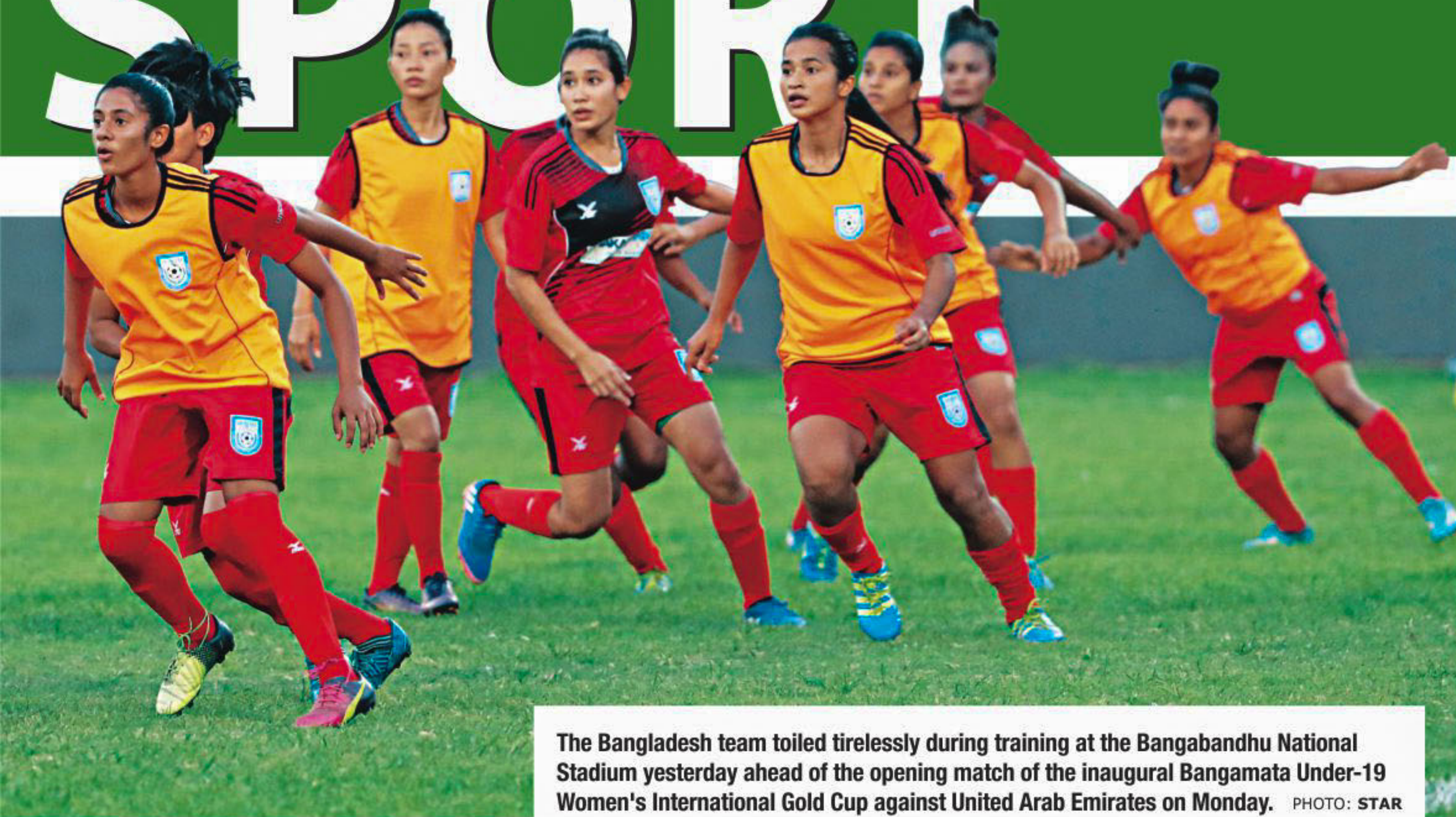
The Bangladesh team toiled tirelessly during training at the Bangabandhu National Stadium yesterday ahead of the opening match of the inaugural Bangamata Under-19 Women's International Gold Cup against United Arab Emirates on Monday.