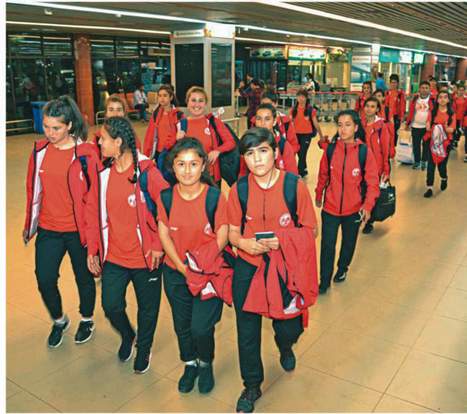
The Tajikistan team arrived in Dhaka on Friday night to participate in the Bangamata Under-19 Women's International Gold Cup, which begins on Monday at the Bangabandhu National Stadium.

All the matches of the tournament will kick off at 6:00pm and will be telecast live on RTV and NagorikTV.