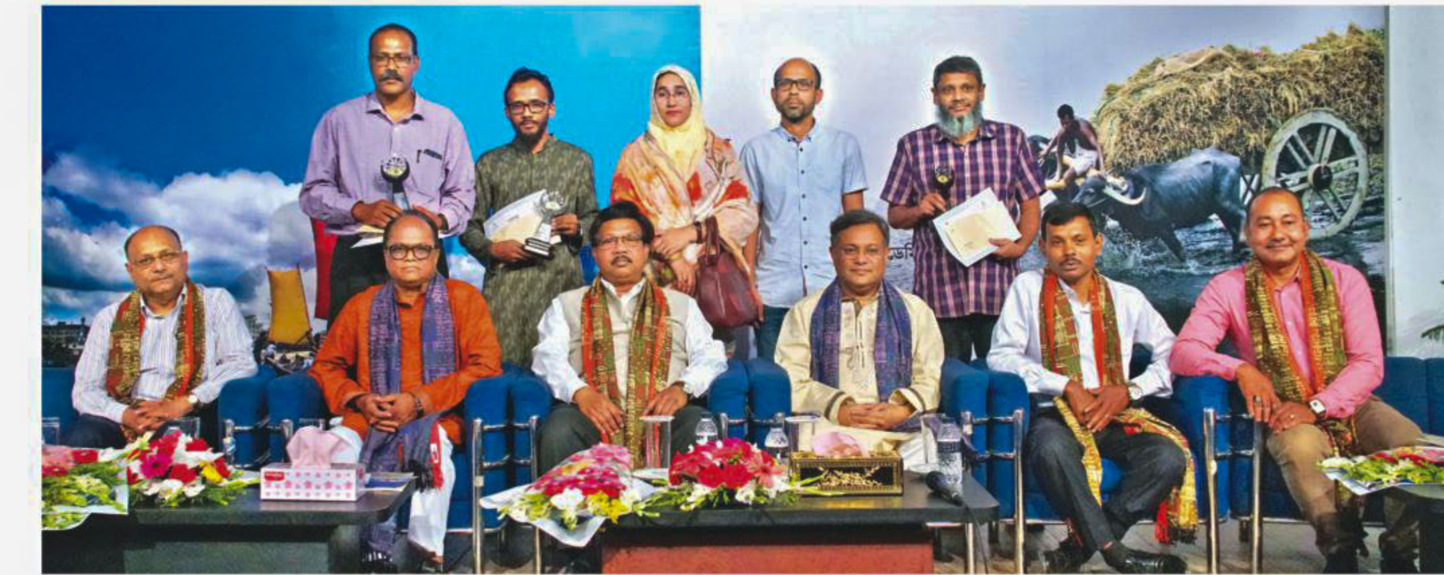
The award winners (back row) along with the guests (seated) at the opening ceremony of the National Photography Exhibition and Competition held at the National Art Gallery Auditorium of Bangladesh Shilpakala Academy (BSA). Bangladesh Photojournalist Association and BSA jointly organised the event.

Participants called for collective initiatives to popularise Nazrul songs and conduct intensive research on the life and works of the great bard.