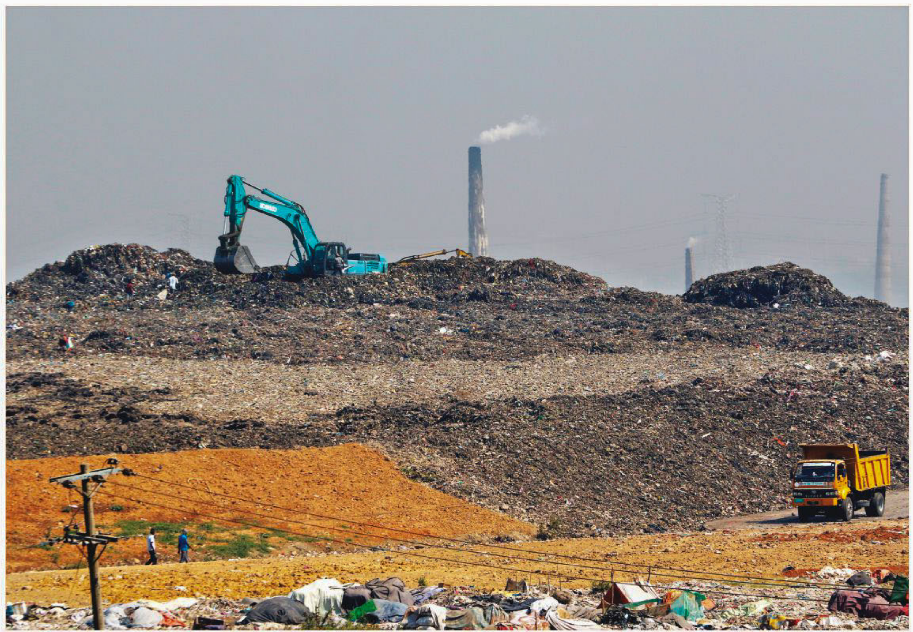
Heaps of garbage tower over everything else at Aminbazar Landfill -- used by the Dhaka North City Corporation. Without a sustainable waste management system in place, mountains of rubbish have been formed in the two city landfills at Aminbazar and Matuail, both of which have reached almost full-capacity. The photo was taken recently.