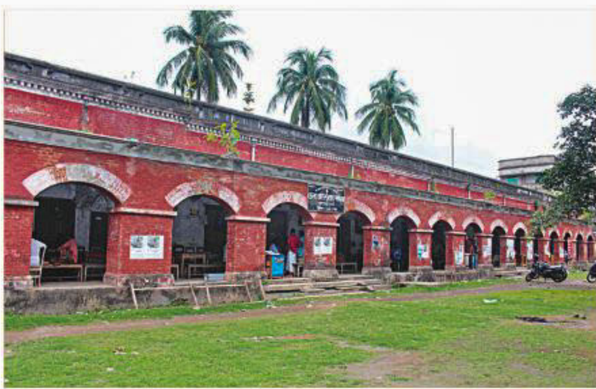
Employees and service seekers in the corridor of the dilapidated building of Bagerhat sub-registrar and land record offices recently. Bottom right, plastic sheets hang from the ceiling to prevent rainwater from coming in.