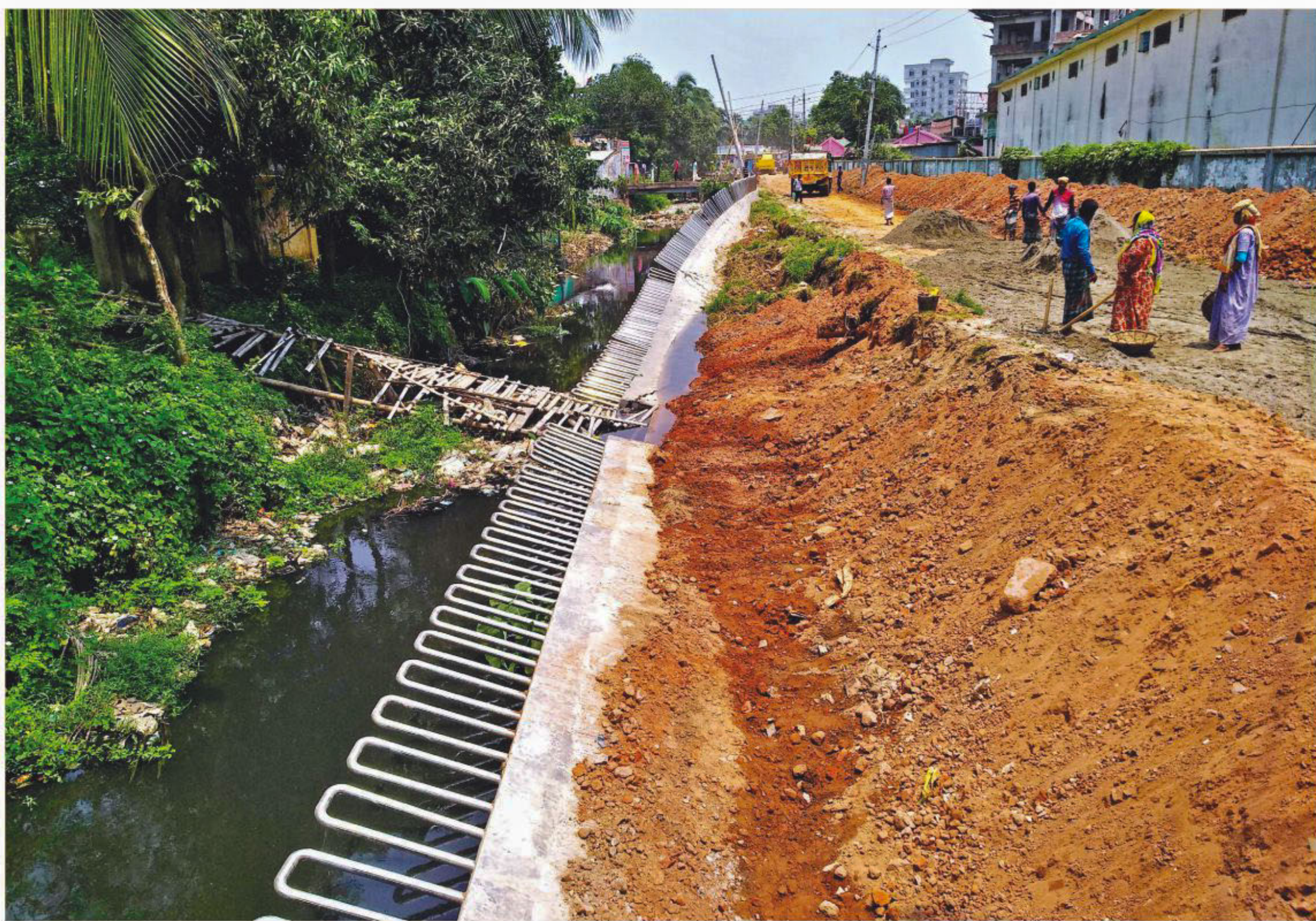
A portion of a retaining wall beside a canal has collapsed in Cumilla city’s Noagaon Rail Crossing area on Thursday. Locals said the Cumilla City Corporation had constructed the wall just two months ago. The photo was taken yesterday.