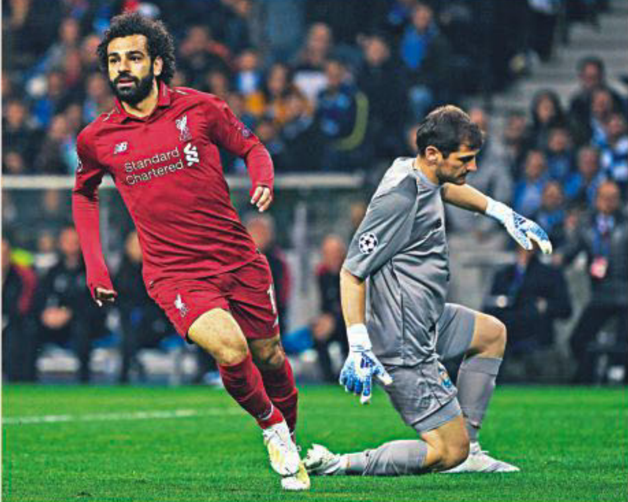
Liverpool star Mohamed Salah (L) celebrates after scoring his team's second goal during their Champions League quarterfinal second leg match against Porto at the Dragao Stadium on Wednesday.

Jürgen Klopp admitted he cannot wait to lead Liverpool into a Champions League semifinal against Barcelona after watching his side crush Porto 4-1 in Portugal on Wednesday to complete a 6-1 aggregate victory in their last-eight tie. On a wet night at the Estadio do Dragão, Liverpool weathered an early storm against Porto before scoring from their first attempt just before the half-hour, Sadio Mané prodding home for a goal given after a lengthy VAR review. Already in control of this tie after a 2-0 win at Anfield in the first leg, Liverpool had effectively killed off Porto there and then, but Mohamed Salah, substitute Roberto Firmino and Virgil van Dijk added further goals after the break. Eder Militao scored a consolation for the hosts 21 minutes from time. Liverpool now march on to a clash with Lionel Messi's Barca, the first meeting of the clubs since a last-16 encounter in 2006/07 that the Reds won on away goals. "I'm looking forward to it. The news that there is a proper football game between Barcelona and Liverpool is great," said Klopp as his side move a step closer to matching their run to the final a year ago. "To be in the semifinals for the second year running is a big statement. I am really proud of the boys for what they did." On the night when Manchester City's quadruple bid died, the dream of a Champions League and Premier League double remains alive for Liverpool and their supporters.