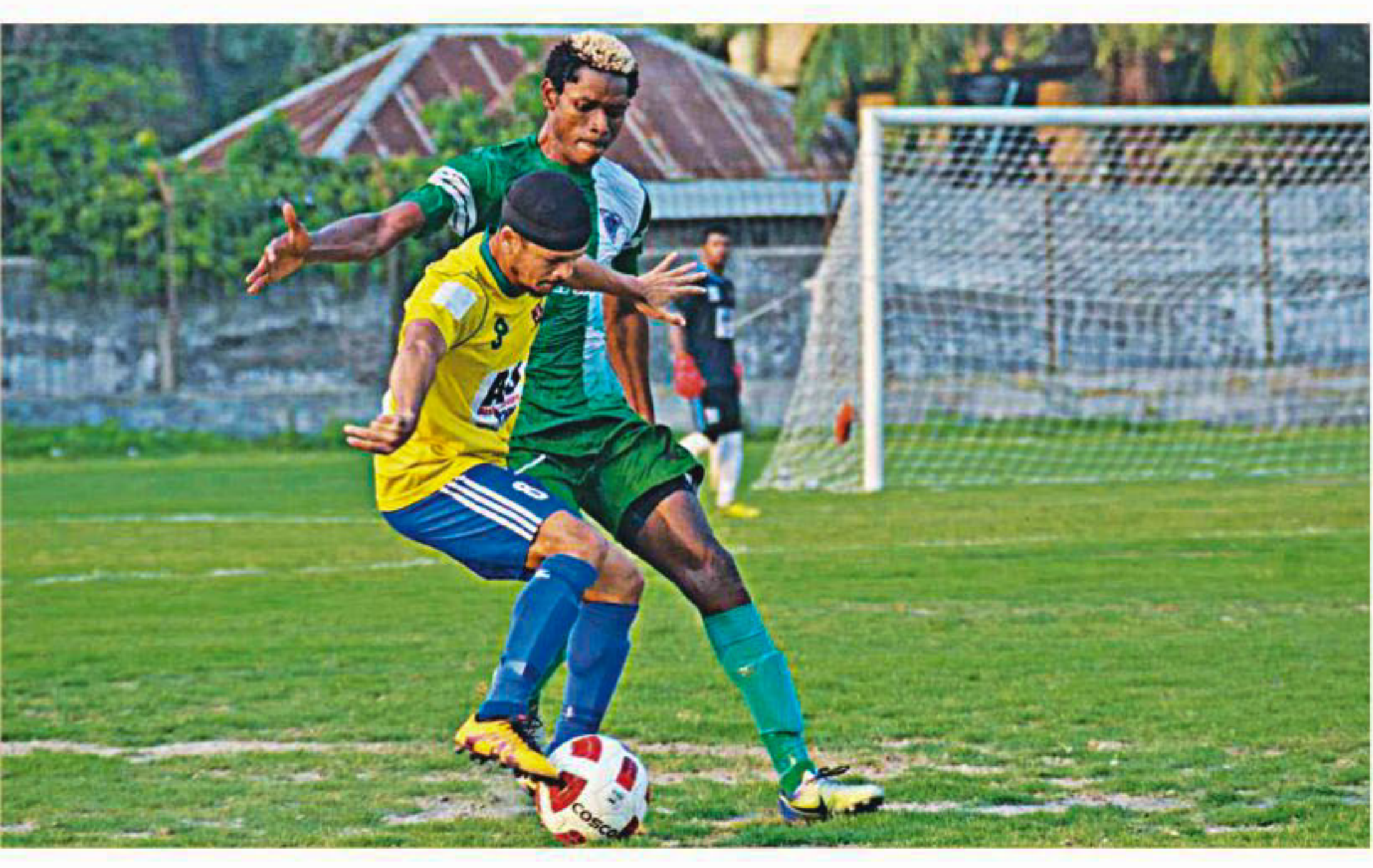
NoFel SC's home turf, the Shaheed Bulu Stadium in Noakhali, seems to be an insurmountable fortress for the big wigs in Bangladesh football. Having defeated Brothers Union 2-0 and Mohammedan SC 1-0 at the ground, NoFel continued their dominance at home with a goalless draw against Sheikh Jamal DC in a Bangladesh Premier League match yesterday.