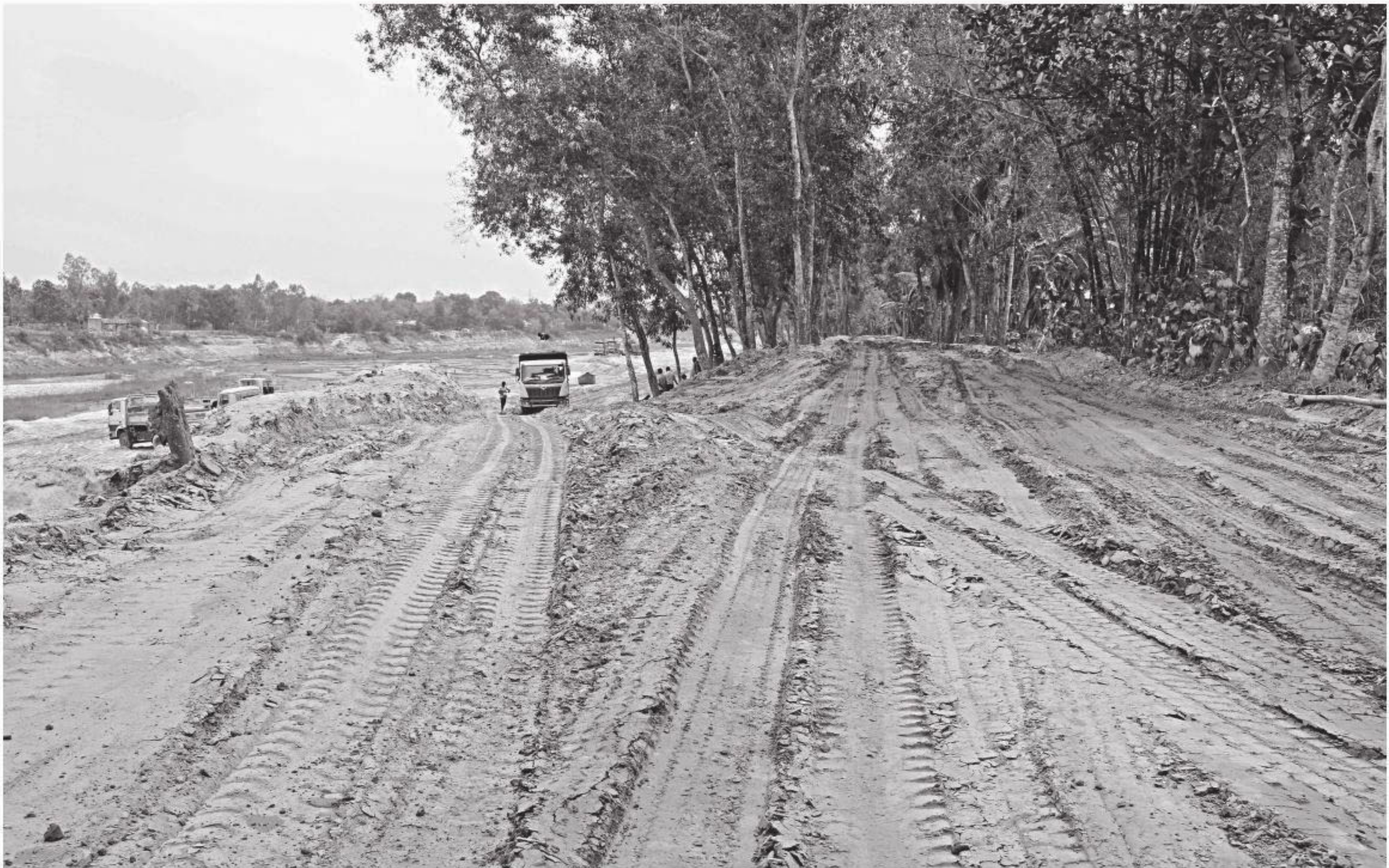
Influential sand traders using Tangail town protection embankment in Kalihati as a road to transport sand on a large fleet of trucks causing damage to the levy.