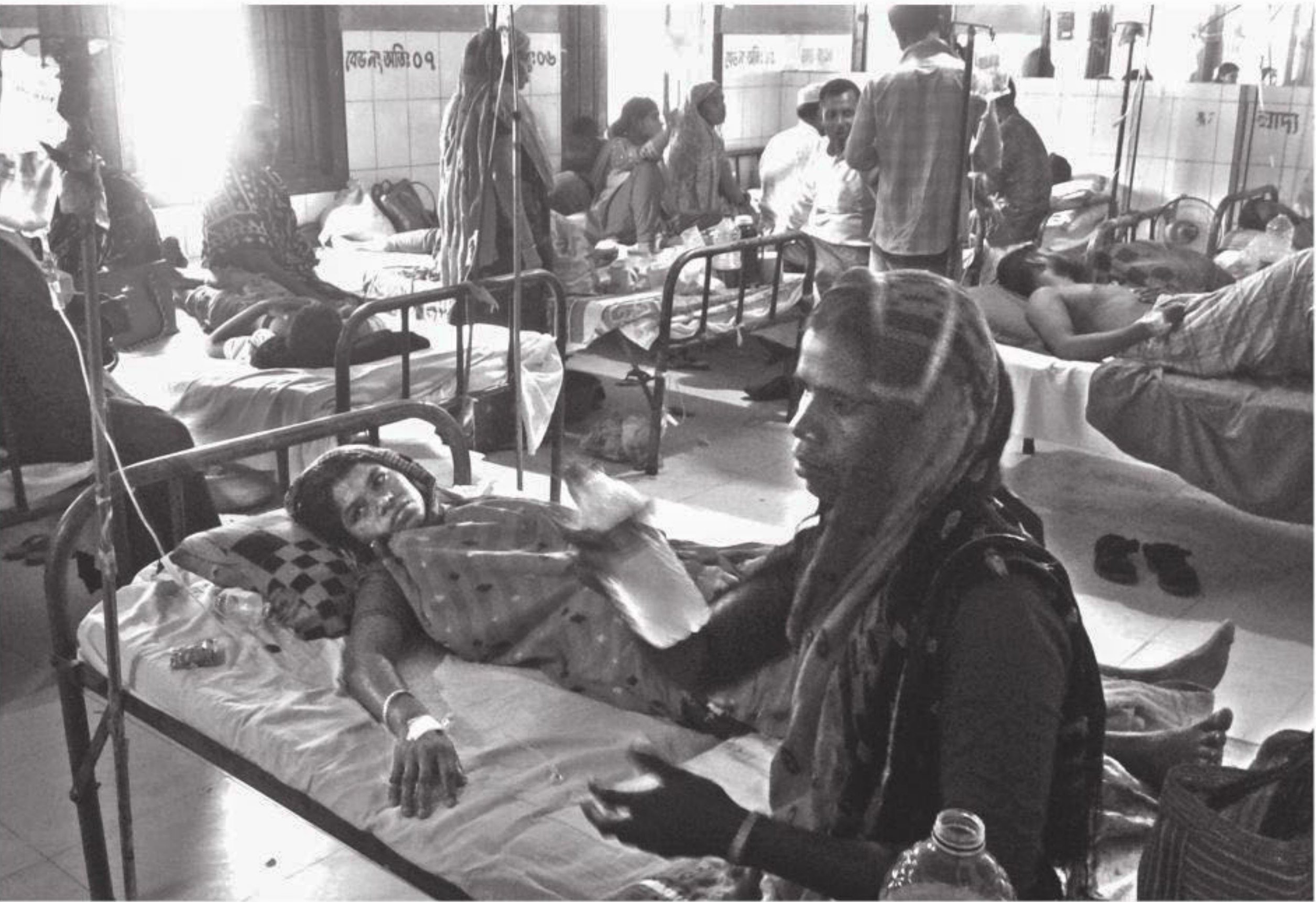
One of the diarrhoea patients getting treatment at Faridpur General Hospital yesterday.