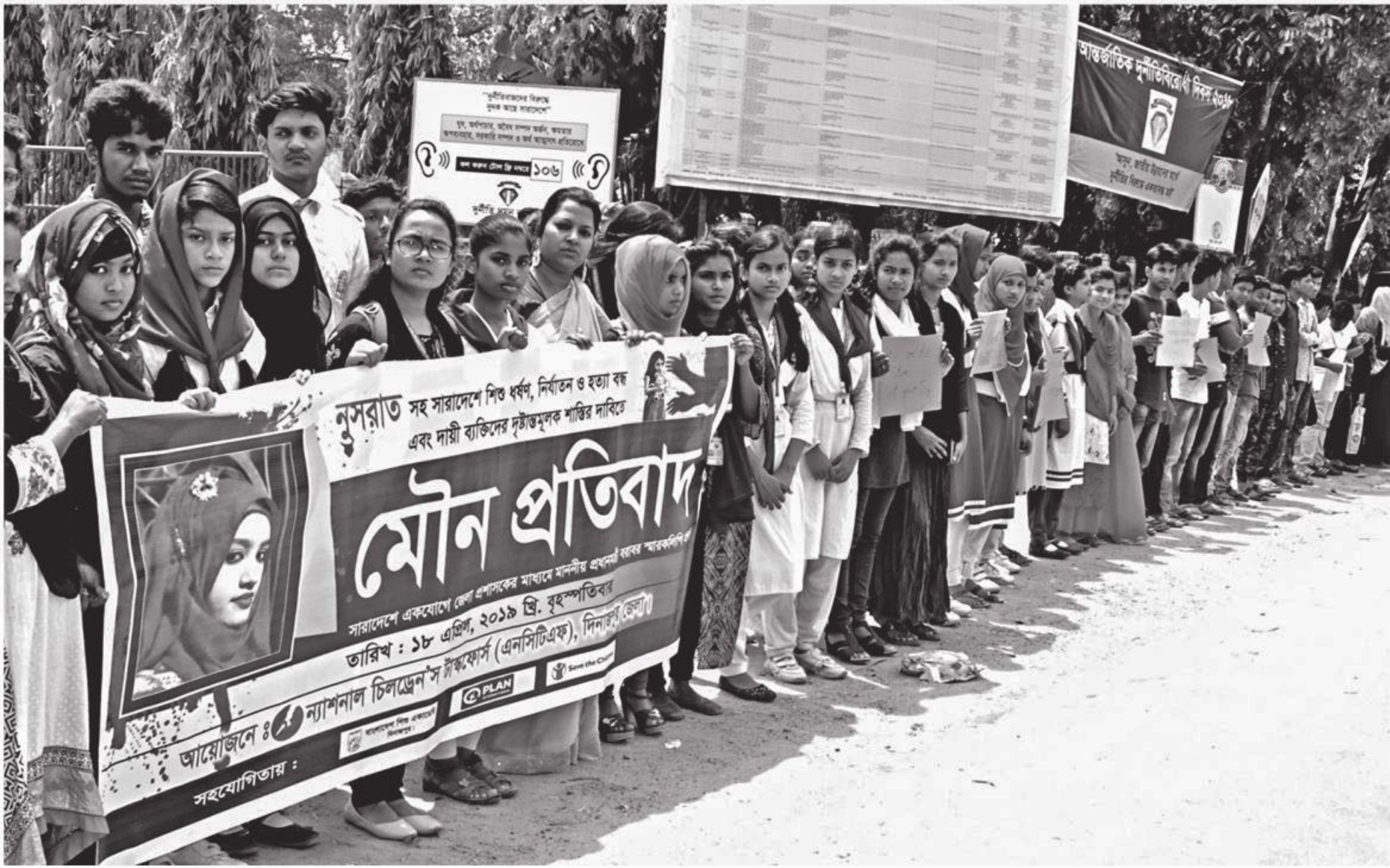
Students of different institutions attend a silent protest, organised by National Children's Taskforce, Dinajpur unit, in front of the deputy commissioner's office in Dinajpur town yesterday, demanding punishment of the culprits responsible for child abuse, torture and murder across the country.