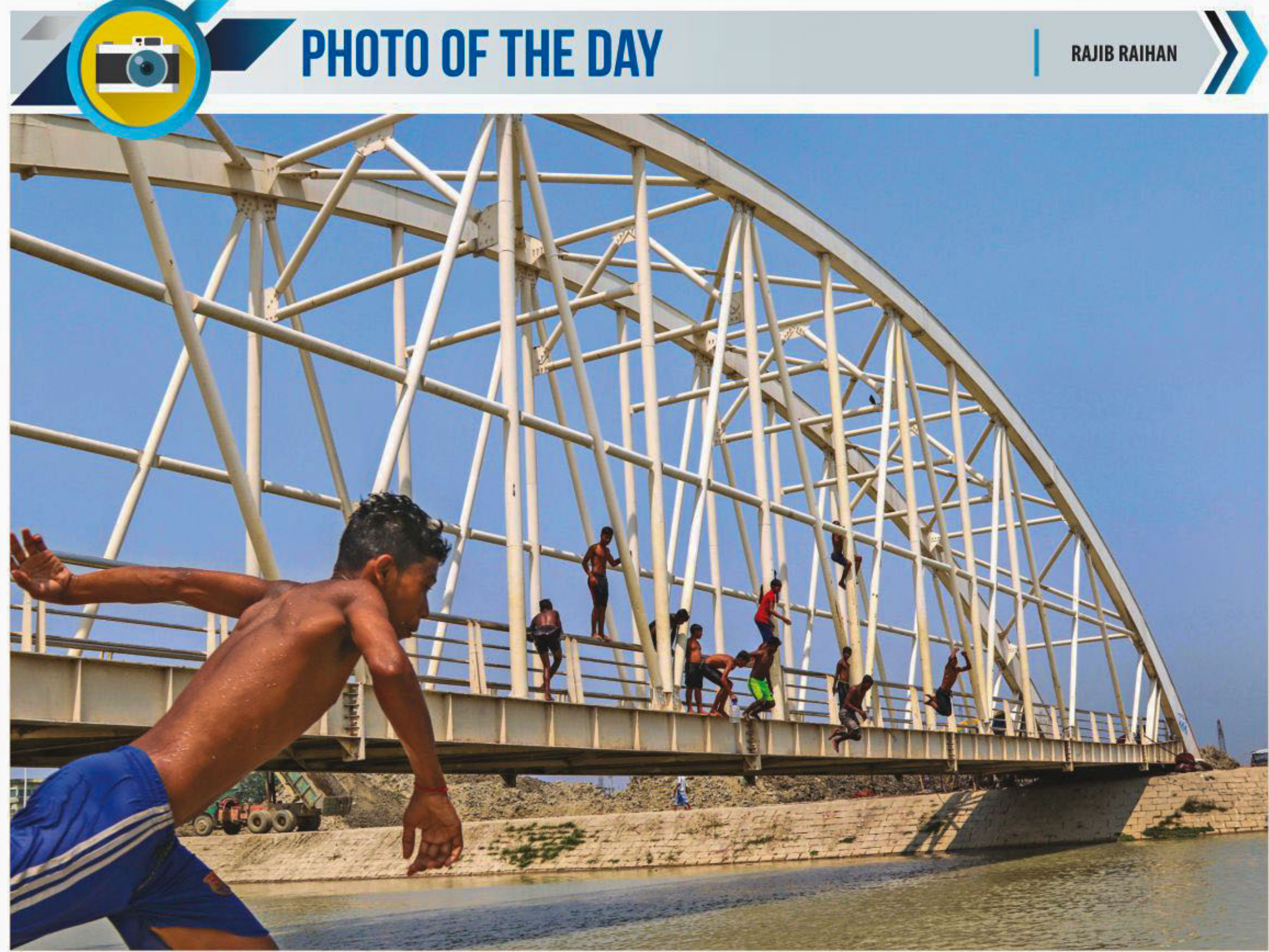
Children in Chattogram have resorted to the best way to beat the heat -- diving into the Karnaphuli. The photo was taken yesterday from the city's Fishery Ghat area.