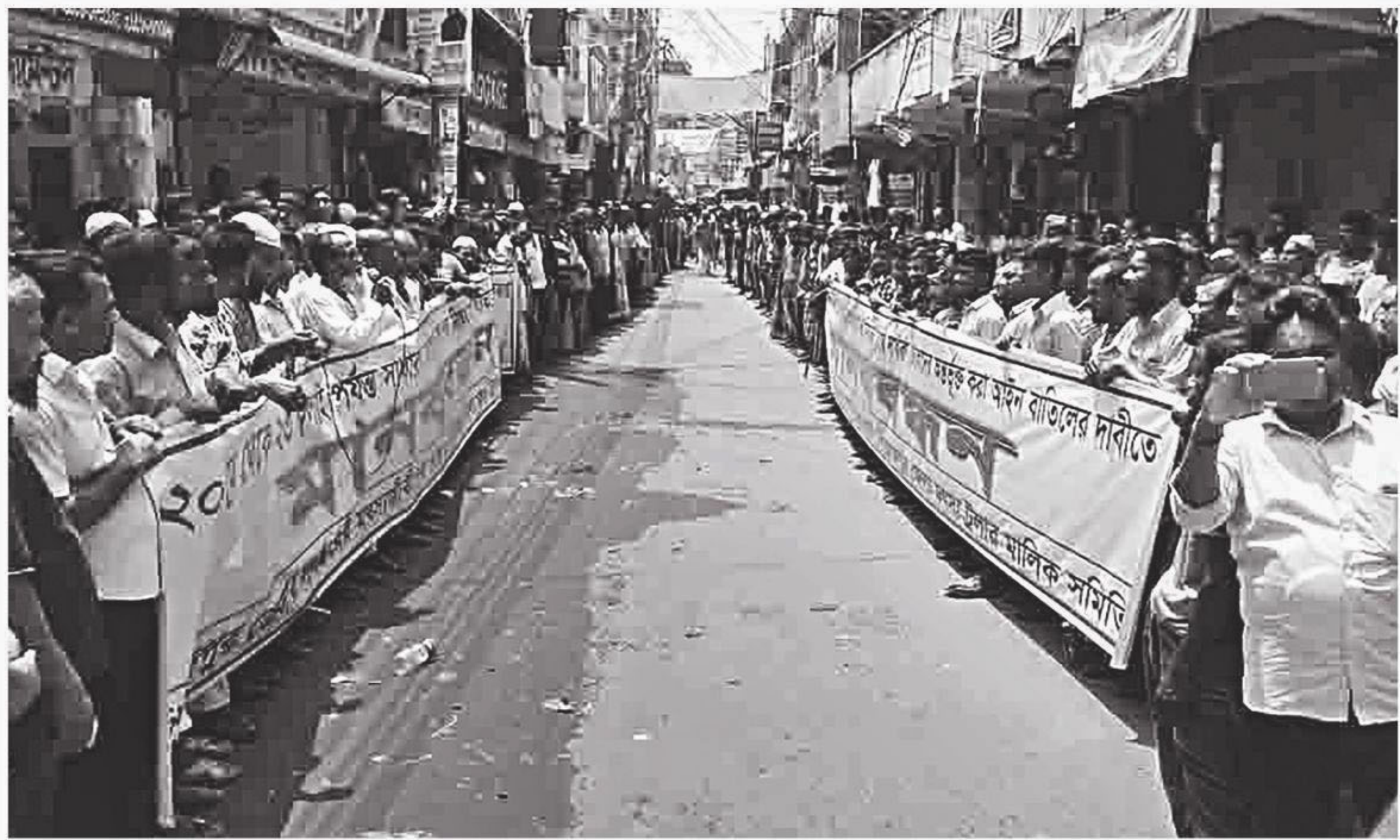
Around one thousand fishers and owners of fishing vessels form a human chain on Club Road in Pirojpur town yesterday demanding withdrawal of the 65-day ban on fishing in exclusive economic zone (EEZ) of the Bay of Bengal. Like every year, the government imposes the ban in EEZ from May 20 till July 23.

Later, a case was filed in this connection.