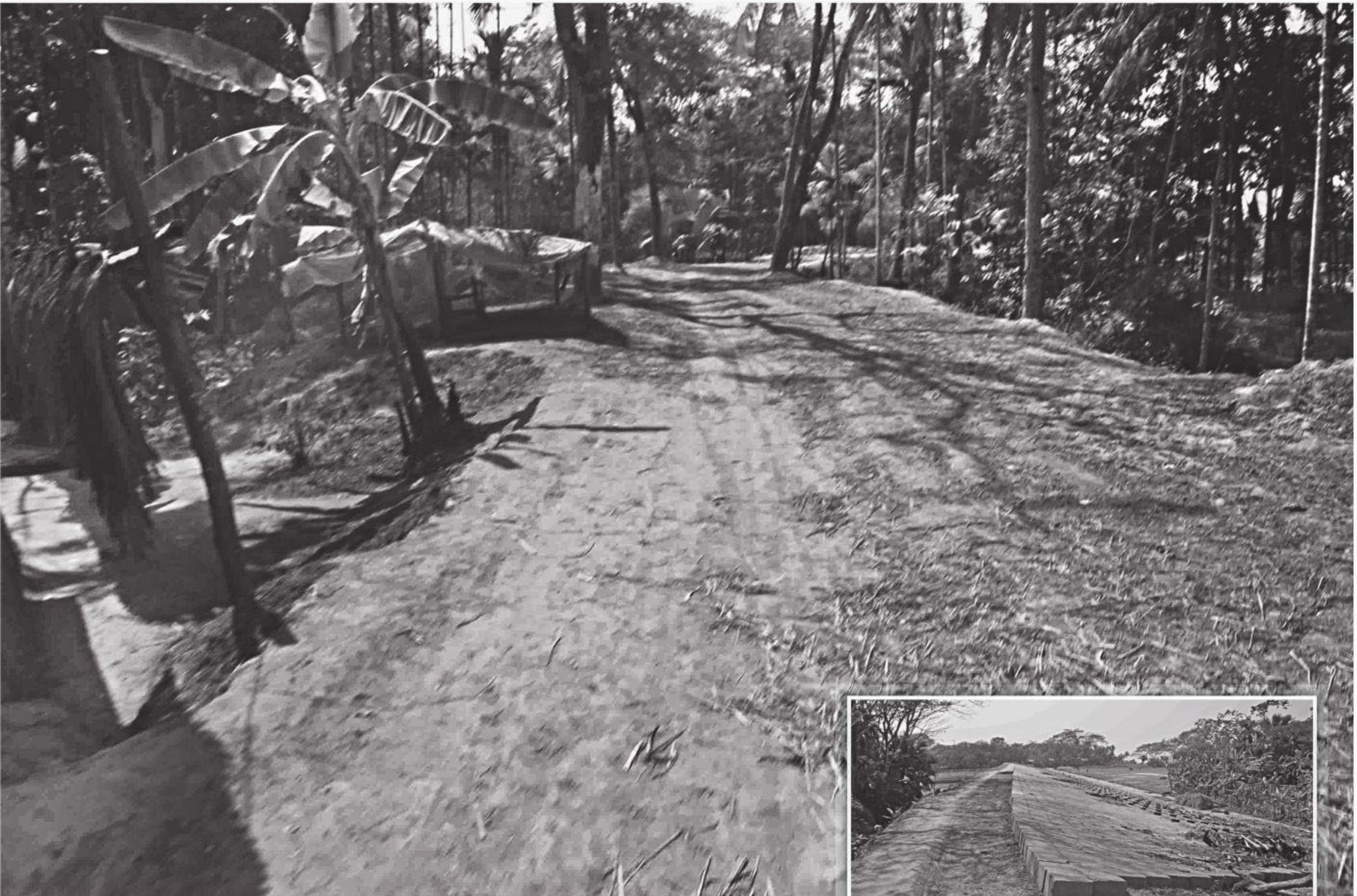
No construction work was done on a section of the 1.6km-long embankment from Baro Machua to Bholmara village in pirojpur's Mathbaria upazila. Inset, the construction work of another portion of the embankment remains incomplete.