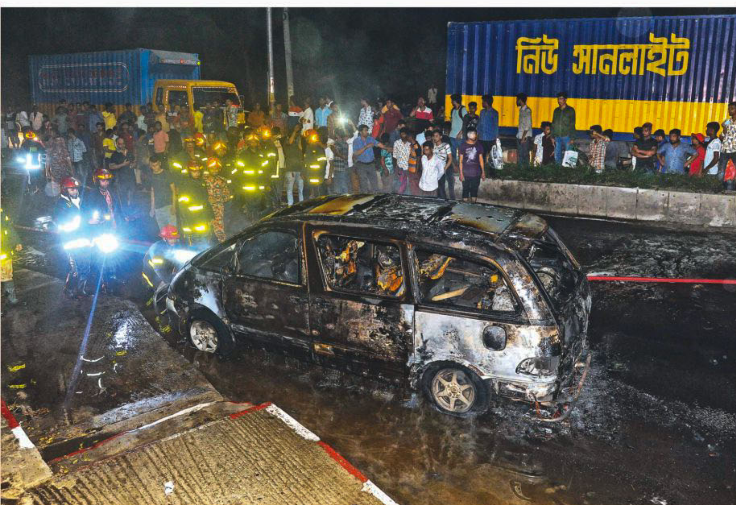
Firefighters douse a minivan that caught on fire at Tiger Pass intersection in Chattogram yesterday evening. The reason of the fire could not be known immediately, and no casualty occurred, said fire service sources.