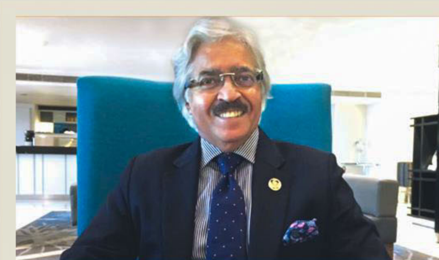
Dr Ashok Seth

Delhi has had "odd-even" traffic regulations to control air pollution when it rises beyond a particular level, especially in winter. Bangladesh needs to take effective steps to lower pollution and