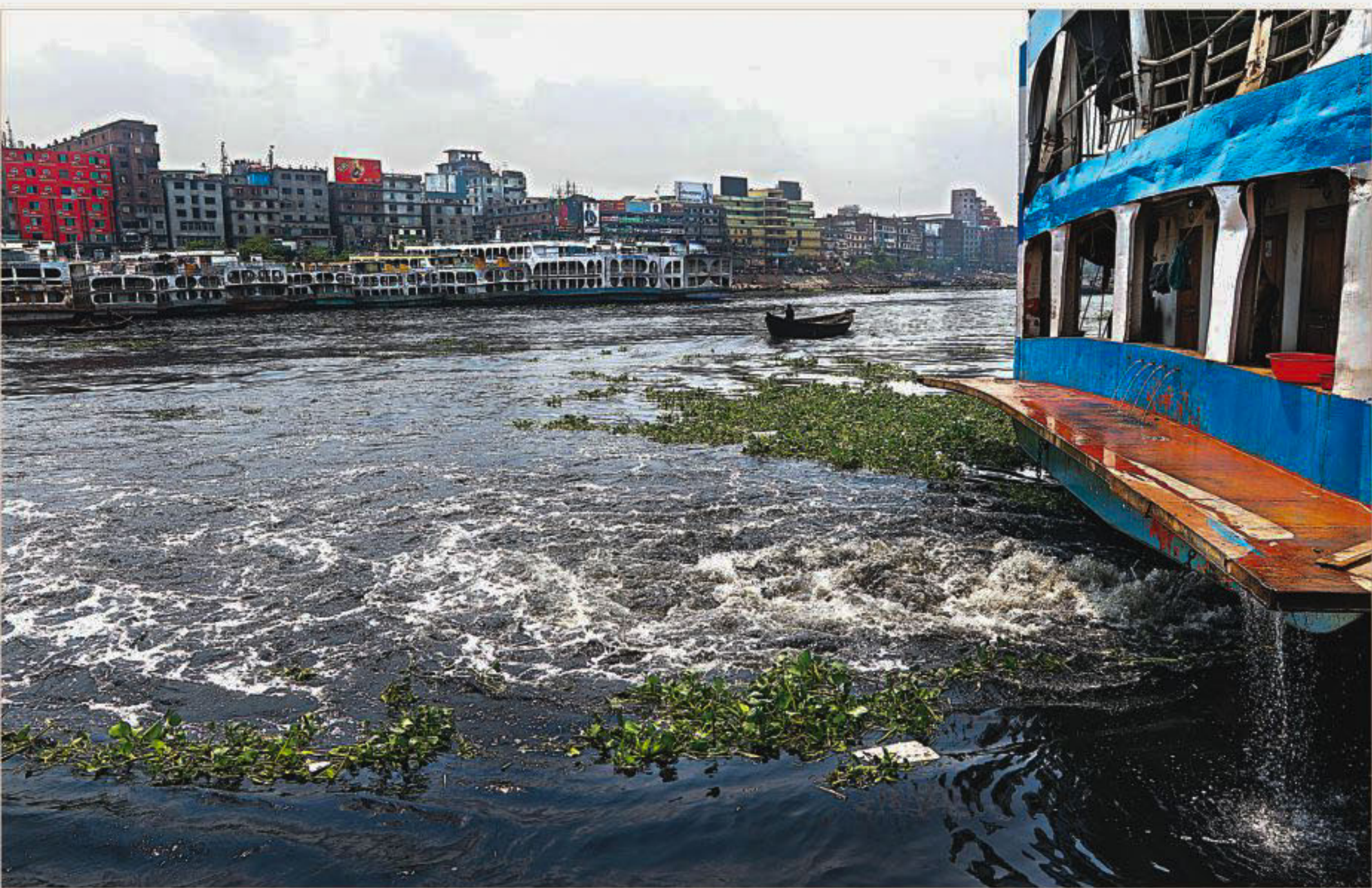
A launch prepares to dock at Sadarghat terminal on the river Buriganga, cruising through what resembles far more than water. At a seminar marking World Water Day yesterday, an environmental activist said he has been campaigning to save the river from pollution for over two decades, to little avail.