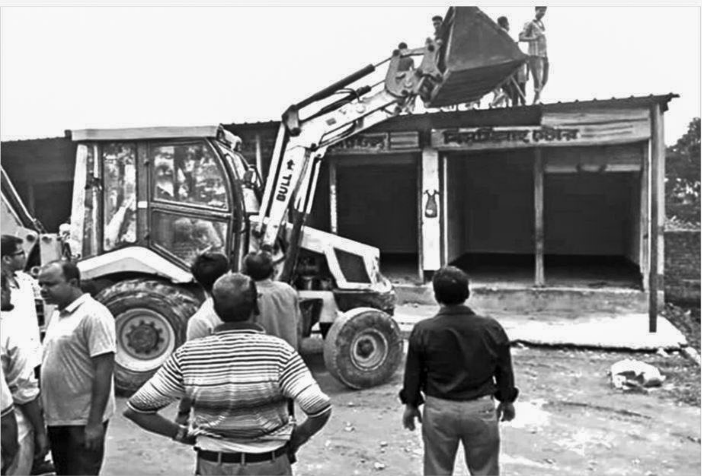
Mymensingh City Corporation authorities during an eviction drive yesterday demolished six illegal structures in Teenkona Pukurpar area of Mymensingh town.

Her inspirational story has touched many on the internet, with netizens praising her as an example of strength and resilience.