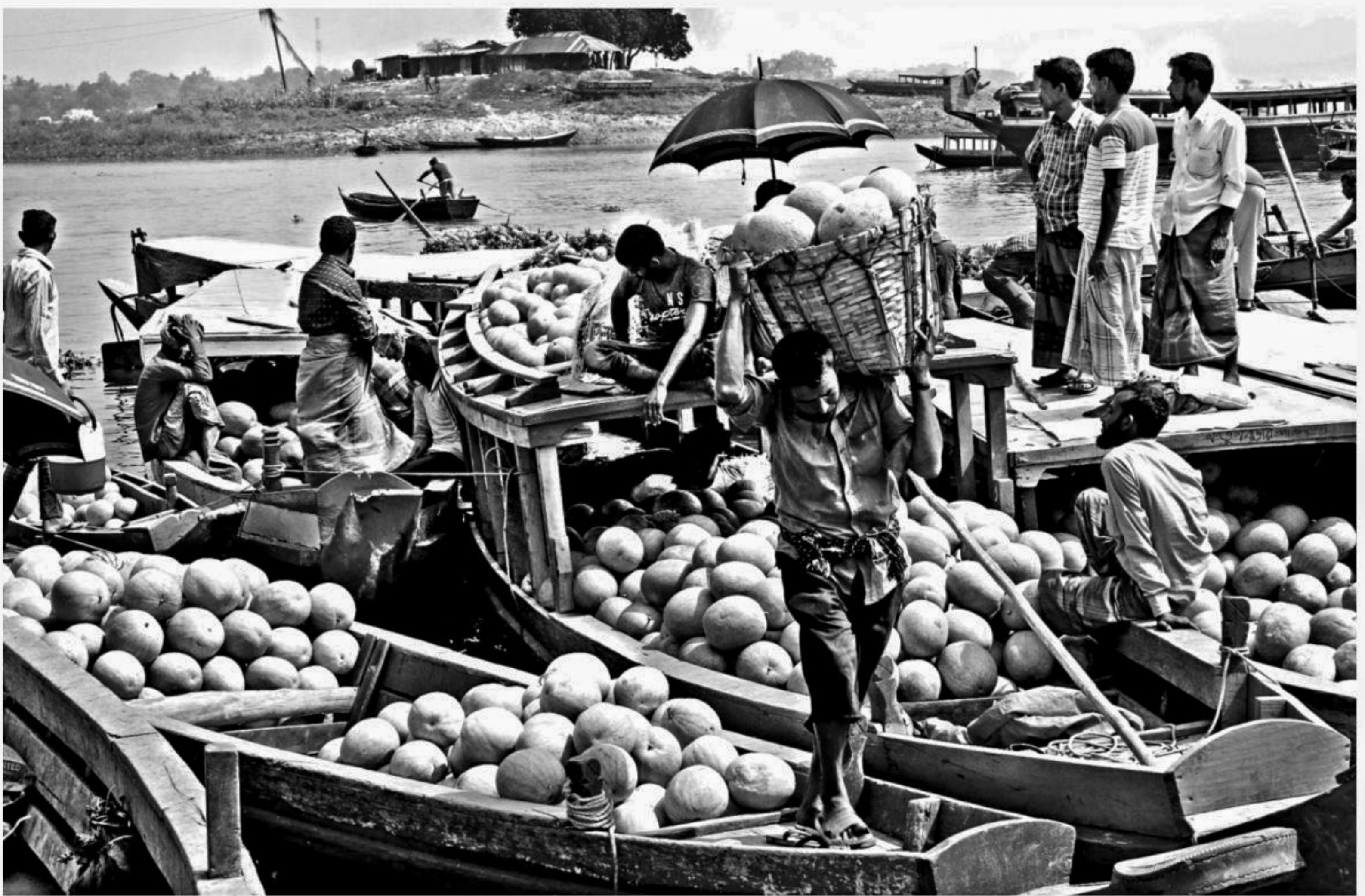
Farmers selling watermelons on their boats at Samataghat Bazar in Rangamati town.