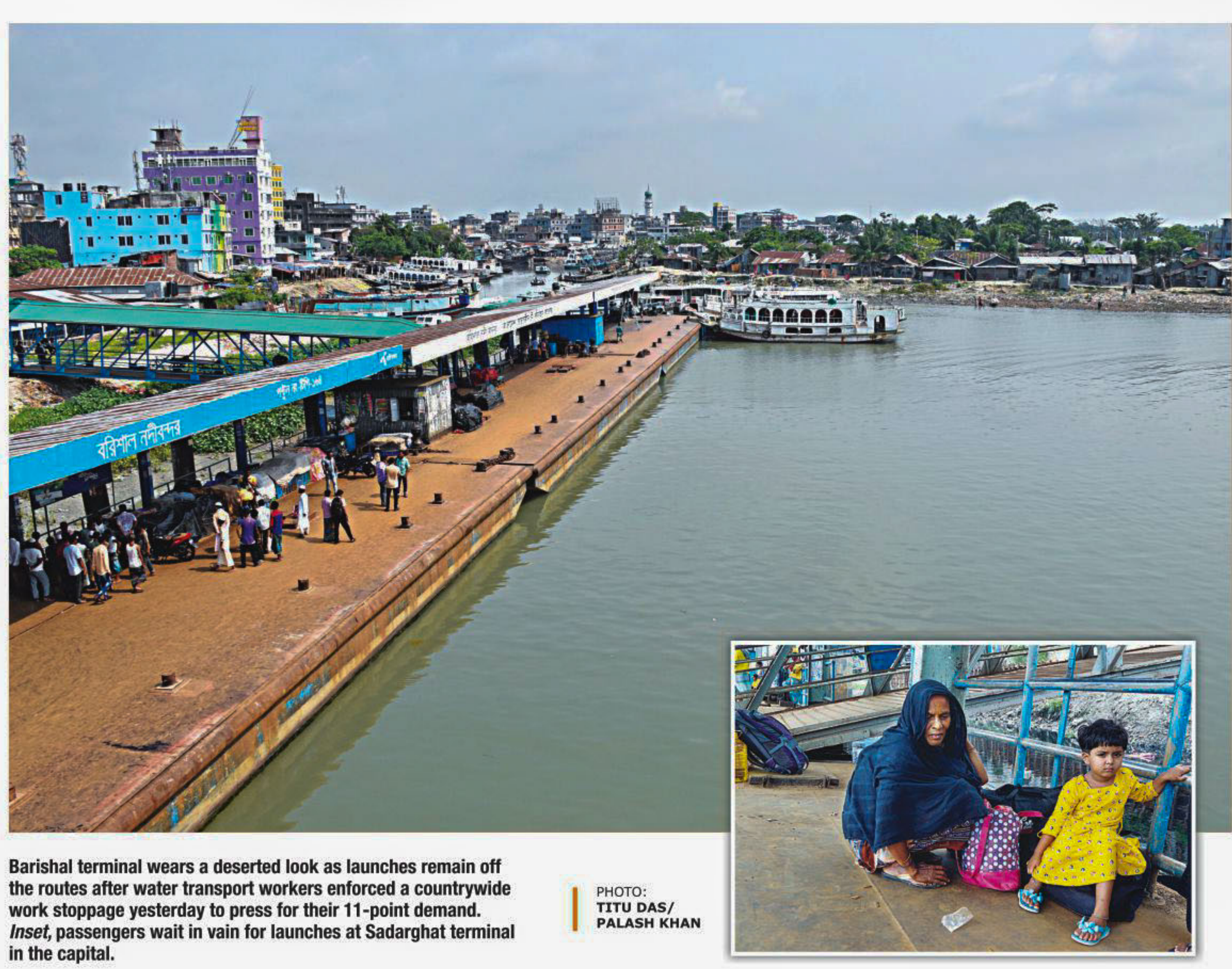
Barishal terminal wears a deserted look as launches remain off the routes after water transport workers enforced a countrywide work stoppage yesterday to press for their 11-point demand. Inset, passengers wait in vain for launches at Sadarghat terminal in the capital.

River communications across the country came to a near halt yesterday as water transport workers went on a nationwide strike that caused huge public sufferings and hampered business activities. Operation of all types of passenger and cargo vessels remained suspended from 12:01am yesterday. Loading and unloading of goods at two seaports and major river ports were severely disrupted, dealing a blow to traders. People of southern districts suffered immensely as only a few launches operated from the capital's Sadarghat and other major terminals in Narayanganj, Chandpur, Barishal and Khulna. Bangladesh Water Transport Workers Federation (BWTWF) called the strike to press home their 11-point demand, including full implementation of the pay scale of 2016, stopping extortion and robbery in river transport, and providing appointment letters, identity cards and service books to transport workers. SEE PAGE 2 COL 2