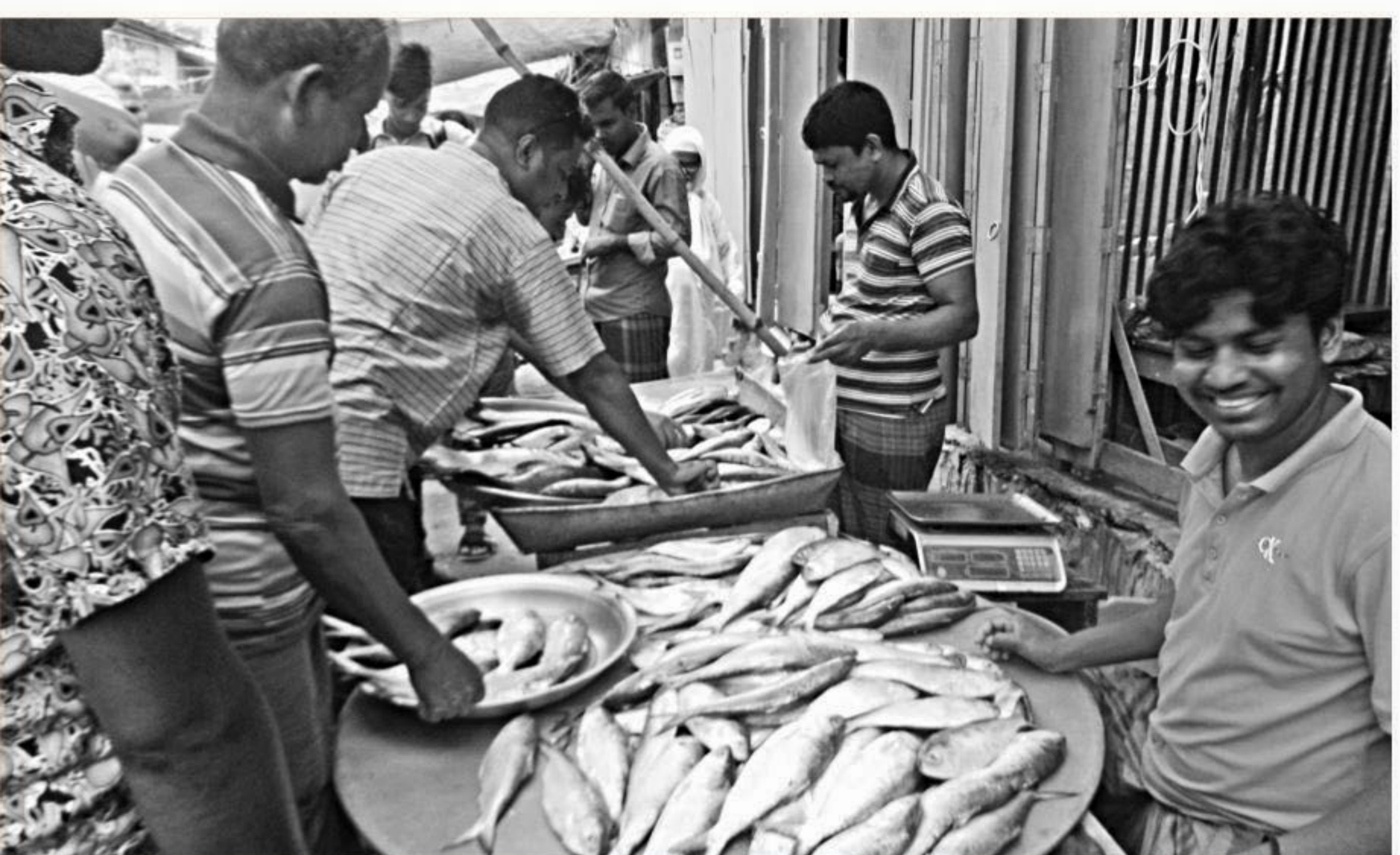
This photo taken from New Market area in Patuakhali town on Friday shows that random sale of jatka goes on unabated, defying the ongoing government-imposed ban.