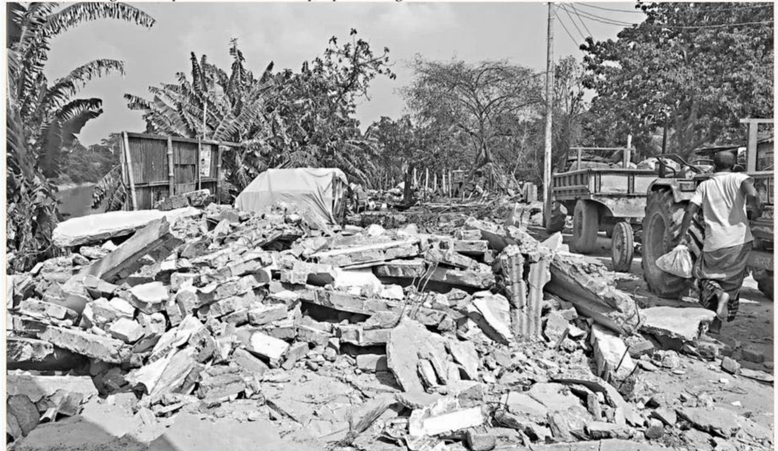
The district administration during an eviction drive knocked down many such illegal structures along Khowai riverbank in Habiganj town yesterday.

Though there are over 1,000 illegal structures on the riverbank, WDB has prepared a list of 250 illegal structures to be removed in phases, Sohel added.