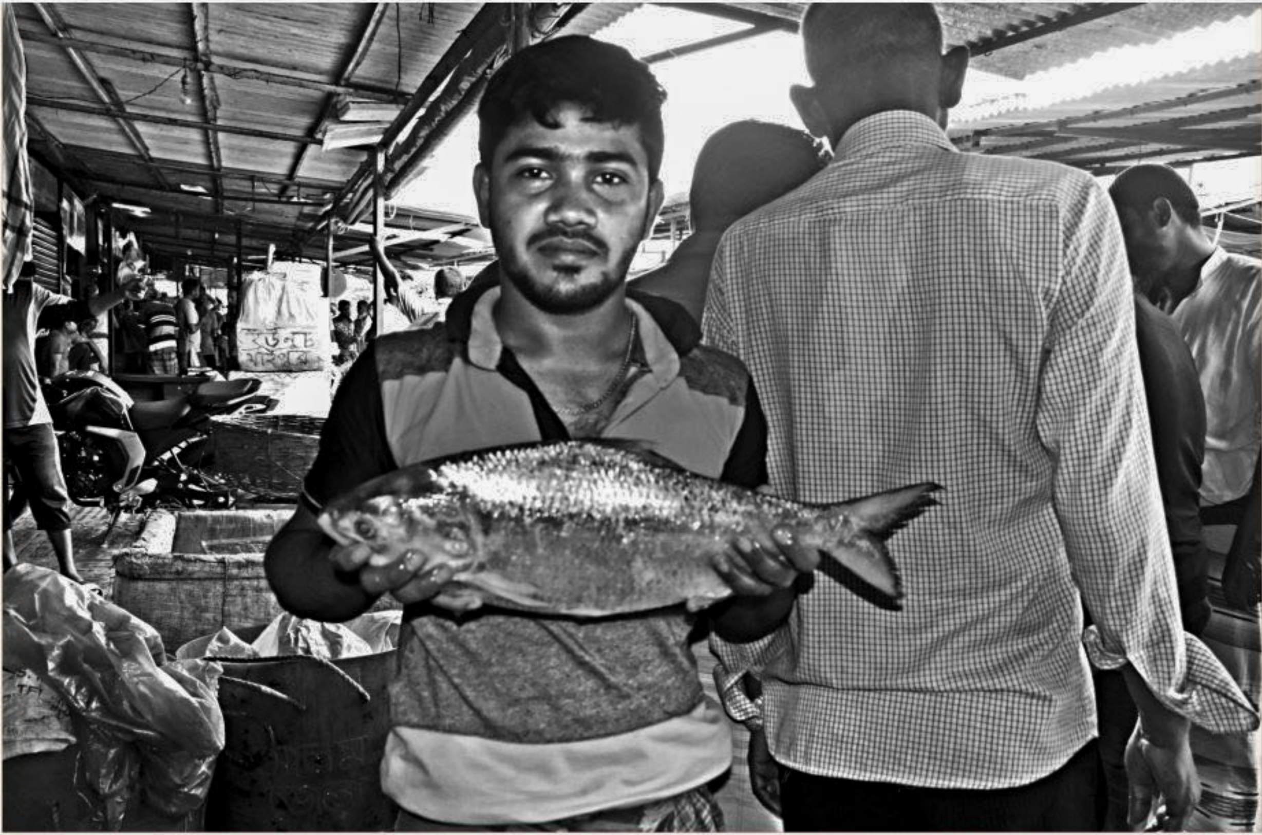
Hilsa has become an inseparable part of Pahela Baishakh celebrations and demand for the national fish shoots up ahead of the festival. This trader in Barishal Port Road market is asking Tk 7,000 for the 1.5kg hilsa. The photo was taken around noon yesterday and he was yet to sell the fish.